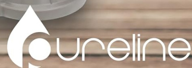
Image 2: The Pureline filter is compatible with Hayward Star Clear Plus C-1750, Sta-Rite PXC-150, and Waterway Proclean 175 systems.