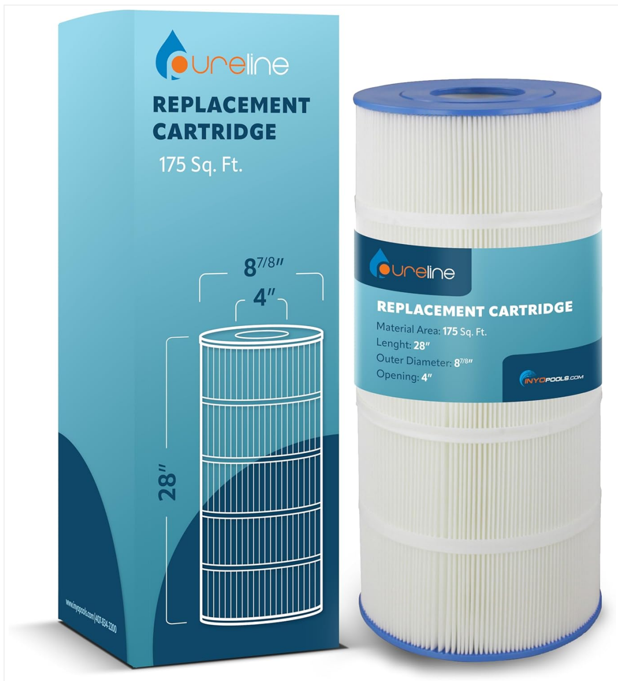
Image 1: Pureline 175 Sq Ft Pool Replacement Cartridge Filter and its packaging.

This filter is engineered to provide maximum water flow, which helps extend the life of the cartridge and ensures even dirt distribution, leading to increased flow rates and reduced wear on your pump.