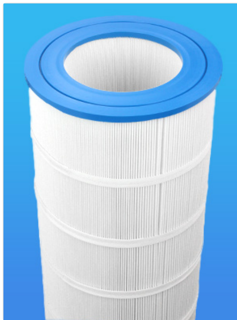
Image: Pureline filter cartridge ready for installation.