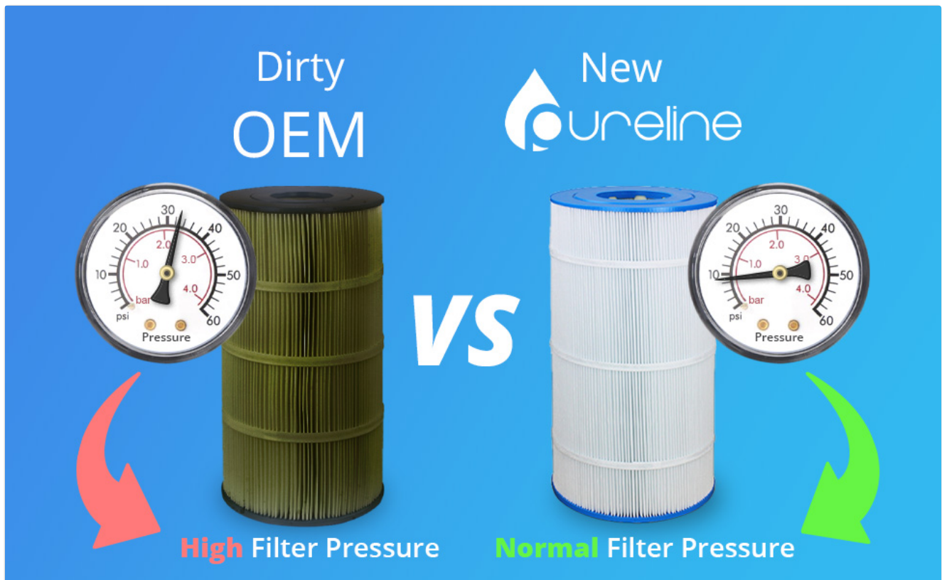
Image: Visual comparison of a dirty filter cartridge (high pressure) and a new Pureline cartridge (normal pressure).