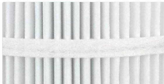
Image: Detailed view of the filter cartridge pleats, highlighting the filtration surface.