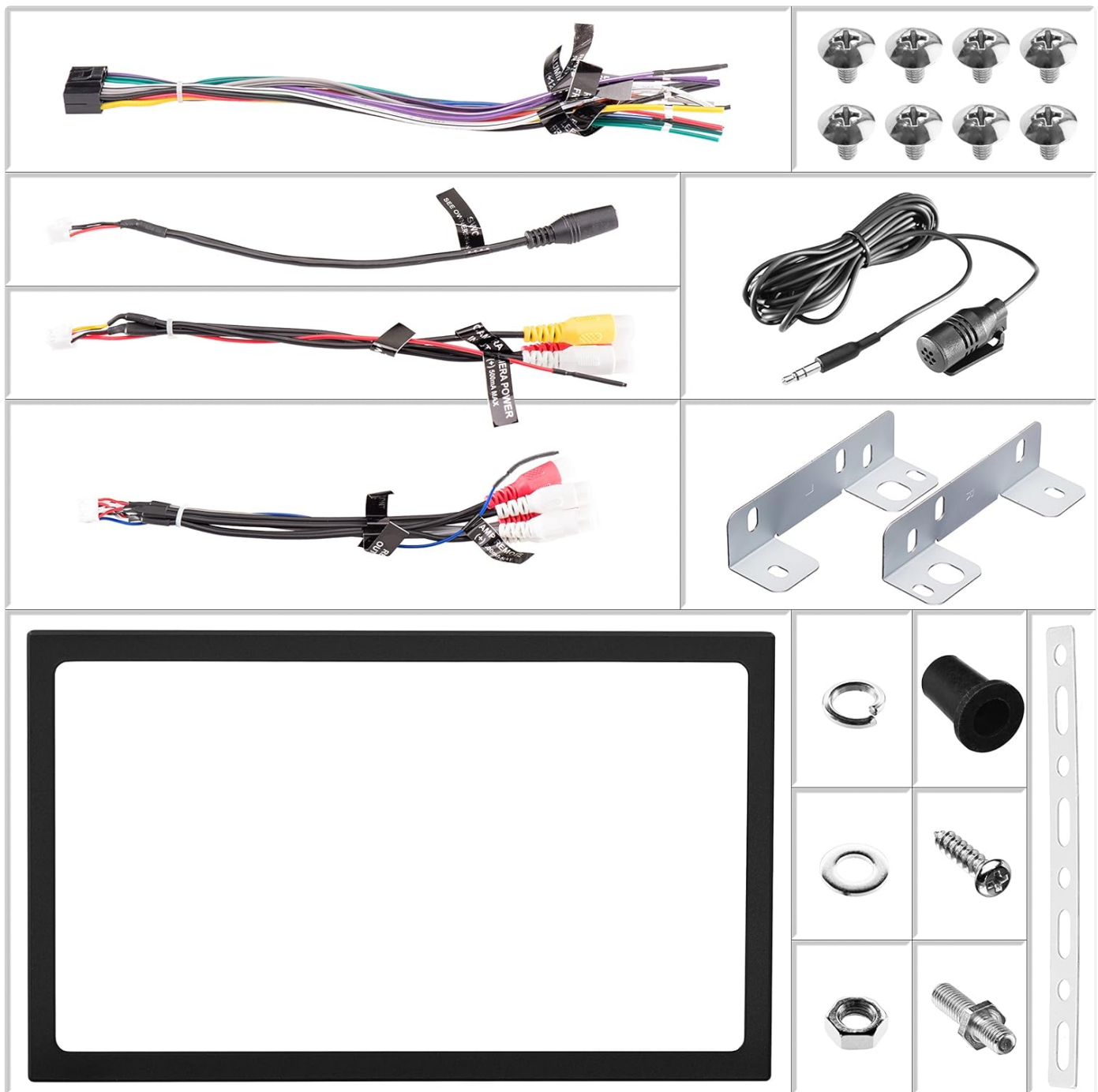
Figure 1: Included components and accessories.