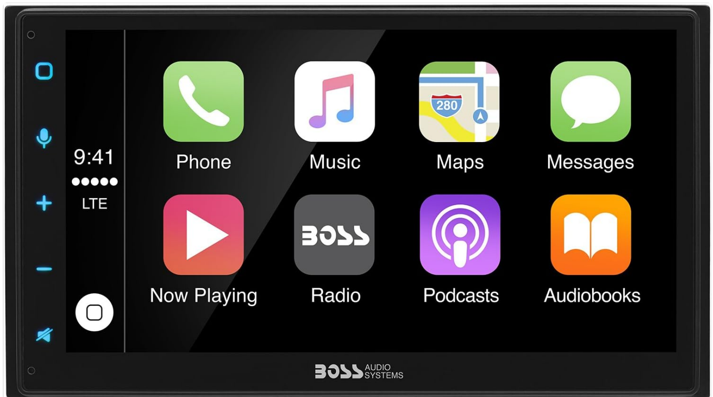
Figure 4: Front panel and touchscreen interface.

The BVCP9675A features a 6.75-inch LCD touchscreen for primary control. Physical buttons are located on the side for essential functions like volume, voice assistant, and home.