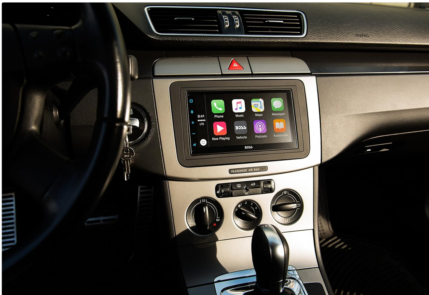
Figure 5: Unit installed in a vehicle dashboard, showing CarPlay in action.