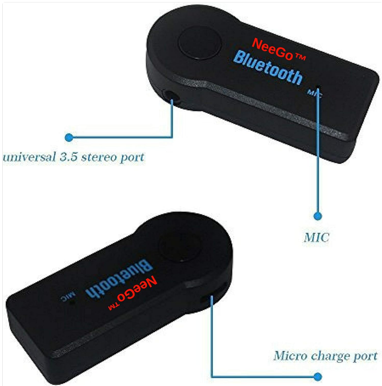
Figure 4.2: Detailed view of the NeeGo Bluetooth Receiver ports.