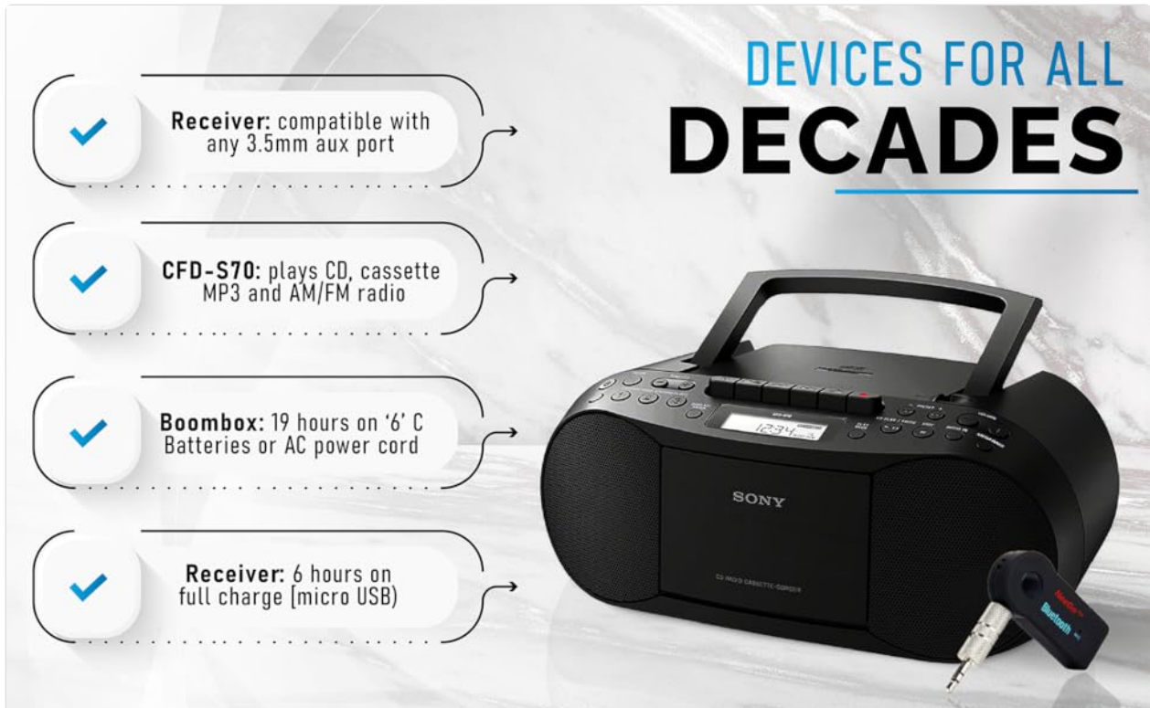
Figure 3.1: Contents of the NeeGo Portable Boombox bundle, including the main unit, Bluetooth receiver, and necessary cables.