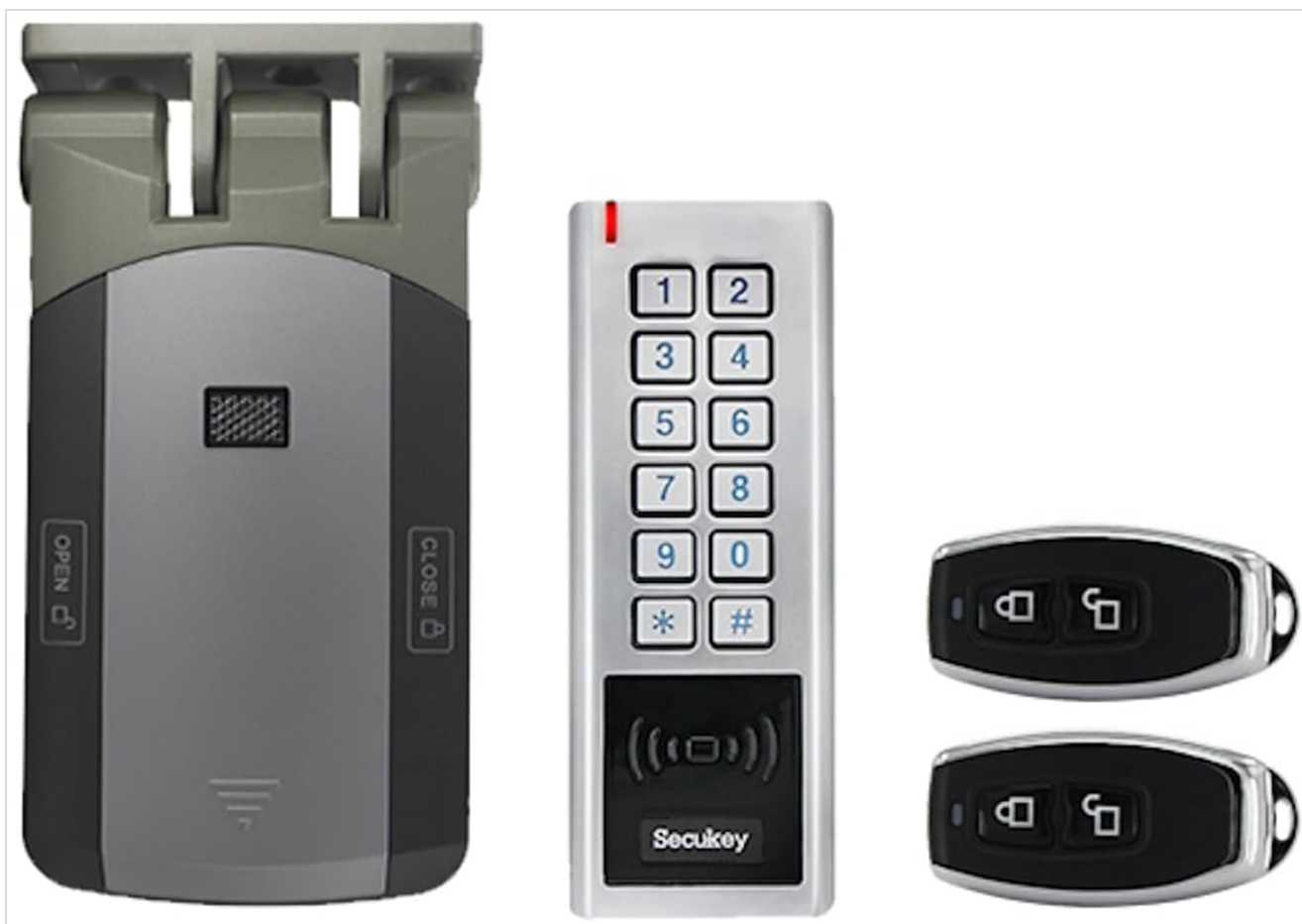
Figure 1: The complete Secukey D3 system, including the wireless lock unit, the numeric keypad, and two remote control fobs.

The Secukey D3 is a standalone RFID and PIN-code access control system designed for both indoor and outdoor use. It features a wireless keypad, a wireless lock unit, and two remote controls, offering a convenient and secure solution for access management. The system is battery-operated, eliminating the need for complex wiring, and boasts an IP66 rating for weather resistance.