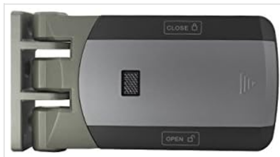
Figure 2: Installation steps for the wireless lock unit. The process involves marking, drilling, and securing the unit to the door frame.

The wireless lock unit is typically mounted on the inside of the door frame. Ensure the mounting surface is clean and stable.