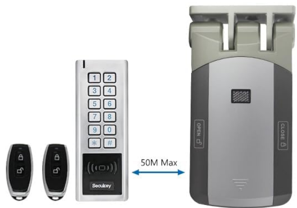
Figure 3: The wireless design of the Secukkey D3 system simplifies installation, allowing components to be placed without extensive wiring.