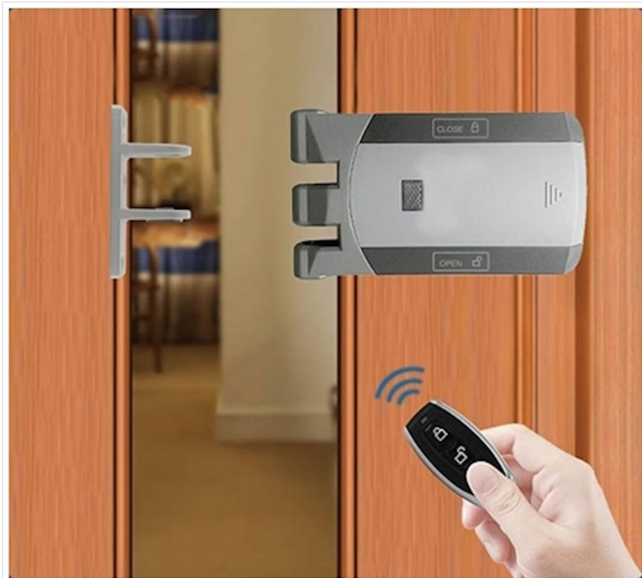
Figure 5: Operating the wireless lock unit using one of the provided remote controls.