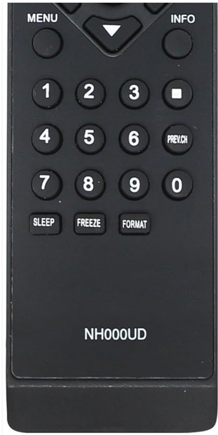
Figure 1: Front view of the remote control, displaying its layout and buttons.