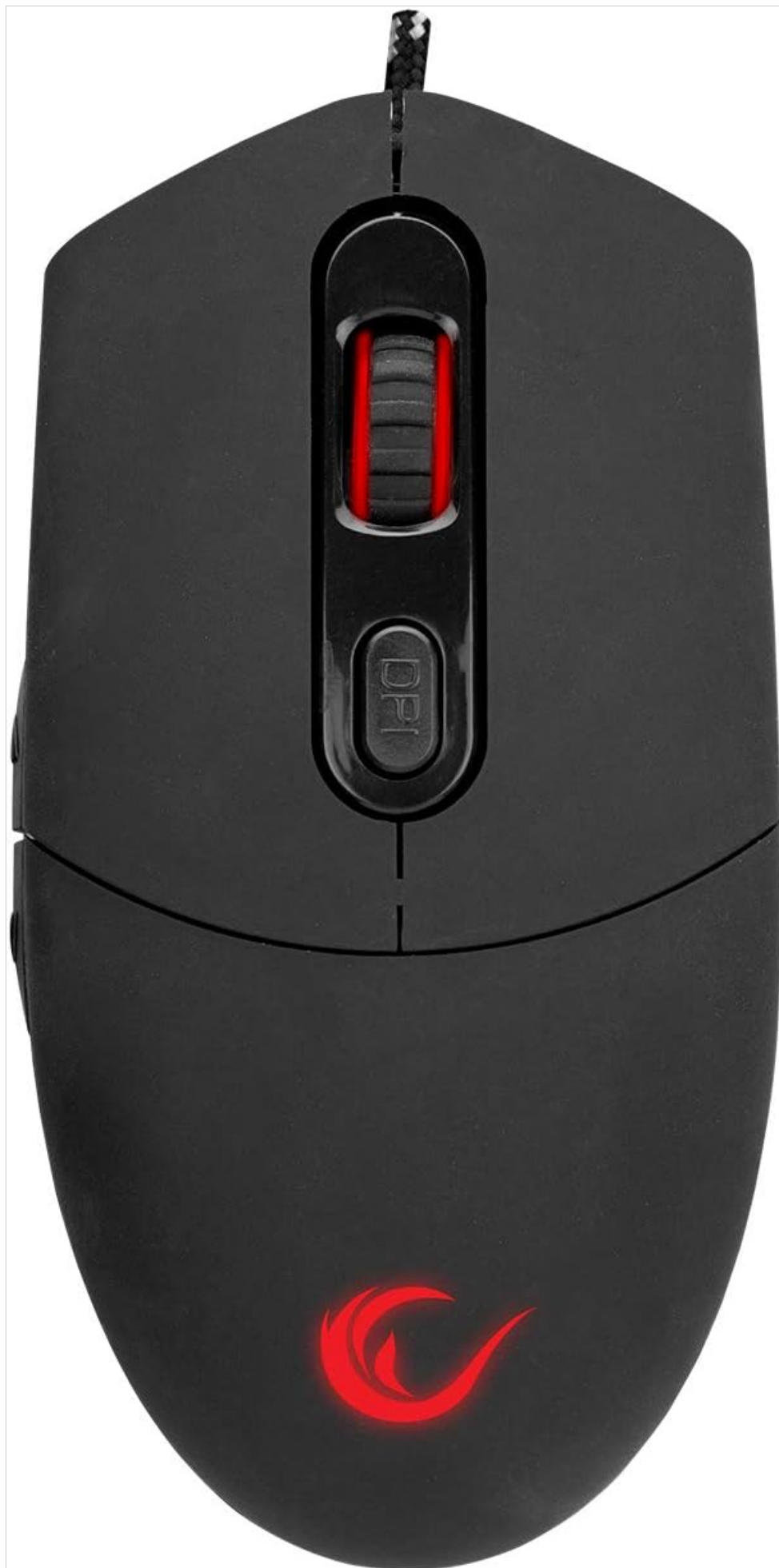
Figure 2: Top view of the Rampage KM-RX9 CYPHER Gaming Mouse, featuring the scroll wheel and DPI adjustment button.