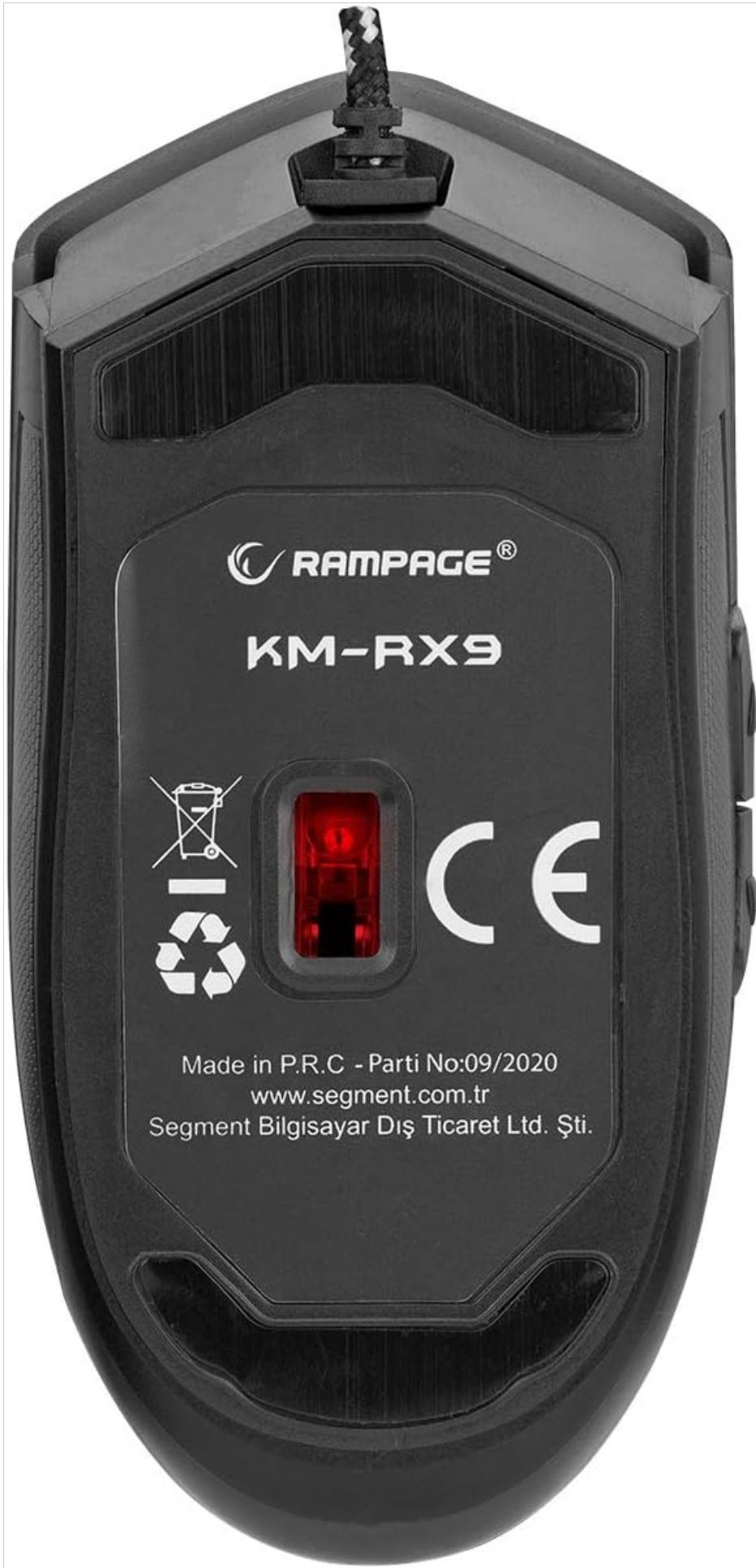
Figure 6: Bottom view of the Rampage KM-RX9 mouse, displaying the model number and optical sensor.