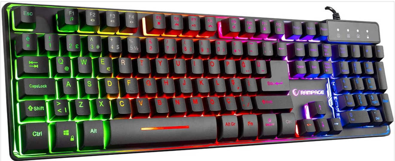
Figure 1: Top view of the Rampage KM-RX9 CYPHER Gaming Keyboard, showcasing its full QWERTY layout and vibrant rainbow backlighting.