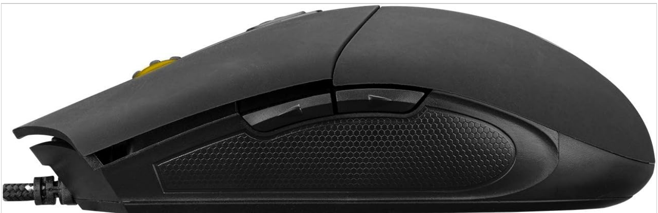
Figure 5: Side view of the Rampage KM-RX9 mouse, showcasing its ergonomic design and textured grip for enhanced control.