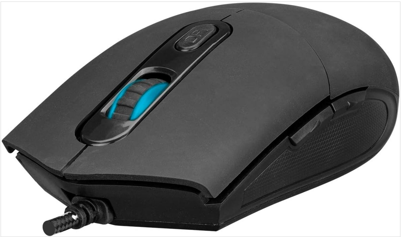
Figure 4: Angled view of the Rampage KM-RX9 mouse, highlighting the scroll wheel and the DPI adjustment button.