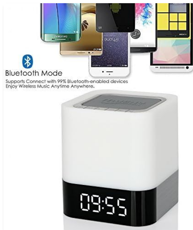
Image: The MUSKY DY 28 Plus speaker displaying the time, with various smartphones floating above it, illustrating its compatibility with Bluetooth-enabled devices for wireless music playback.