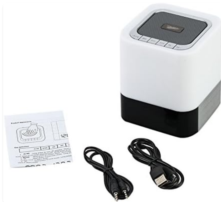
Image: The MUSKY DY 28 Plus speaker, along with its USB charging cable, 3.5mm audio cable, and user manual.