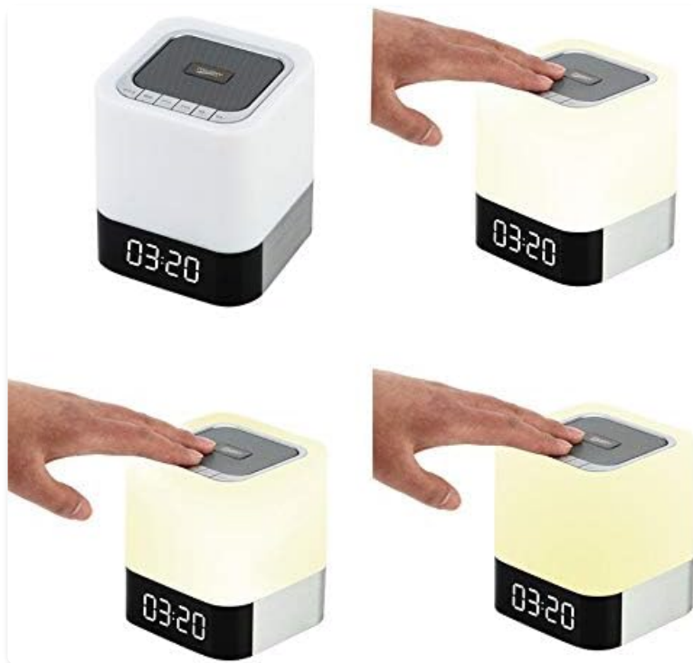
Image: A sequence of four images demonstrating the touch-controlled light function of the MUSKY DY 28 Plus speaker, showing the light off, then progressively increasing in brightness from dim to intermediate to bright with each tap on the top surface.