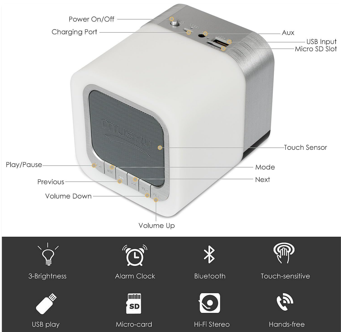
Image: A detailed diagram showing the front and top views of the speaker with labels for its buttons, ports, and features, including Power On/Off, Charging Port, Aux input, USB Input, Micro SD Slot, Touch Sensor, Play/Pause, Previous, Volume Down, Mode, Next, and Volume Up buttons.