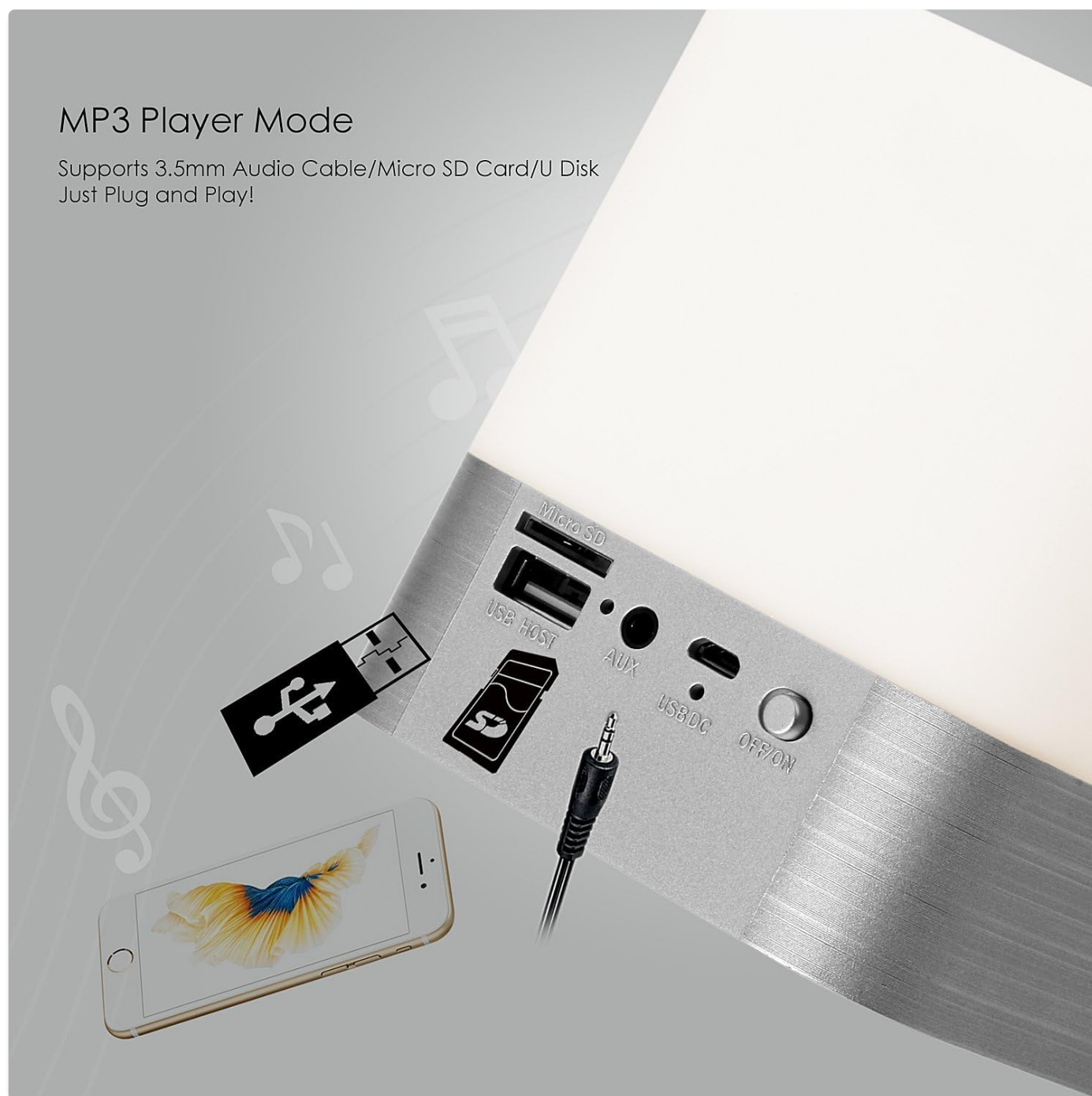
Image: A close-up of the MUSKY DY 28 Plus speaker's side panel, highlighting the Micro SD, USB HOST, AUX, and USB DC ports, with a USB stick and a 3.5mm audio cable connected, demonstrating its MP3 player capabilities.

The speaker supports playing music directly from a TF card (Micro SD), U disk (USB flash drive), or via a 3.5mm AUX cable.