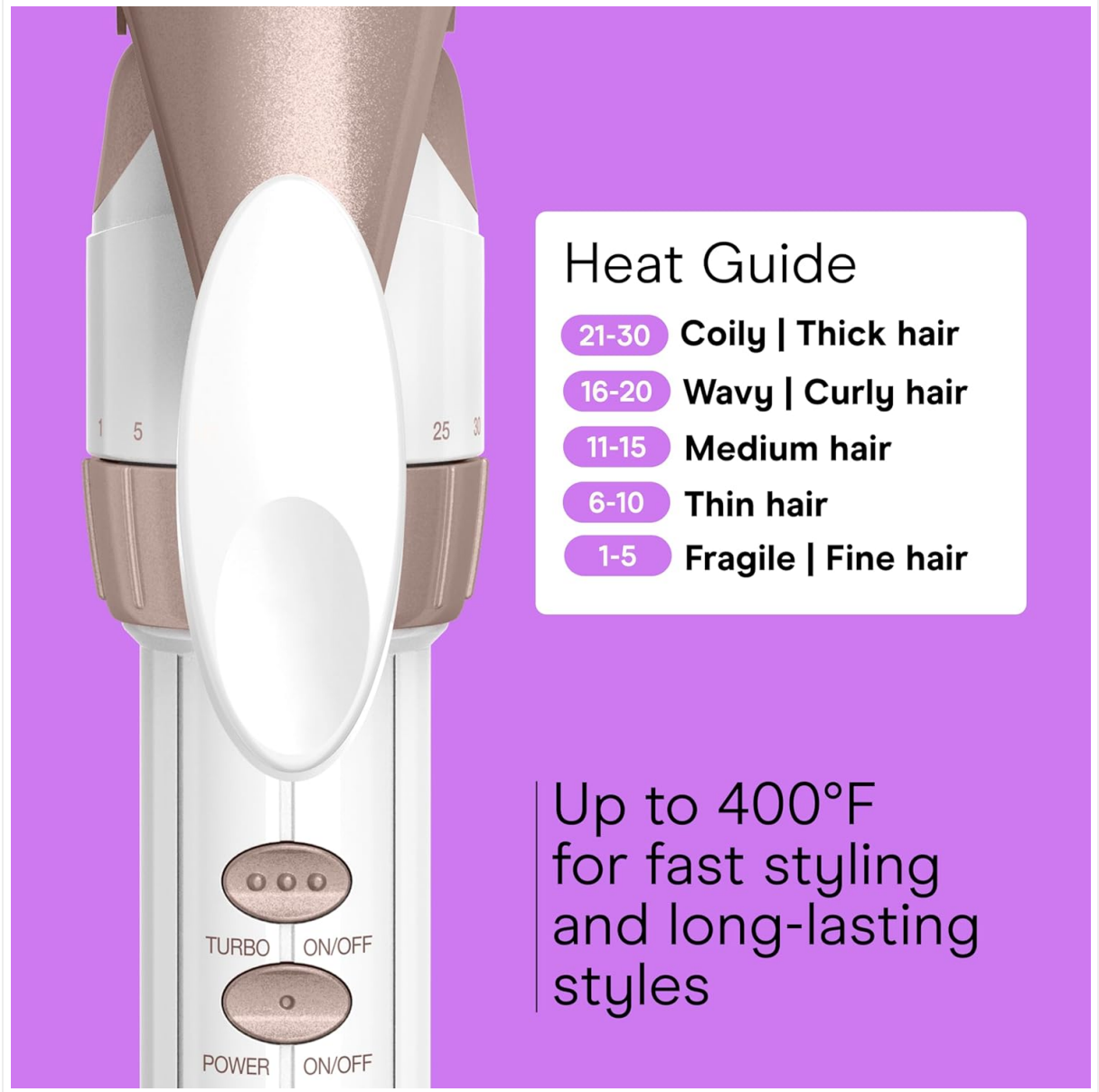
Image: Close-up of the curling iron's heat dial and buttons, with a visual heat guide for different hair types.