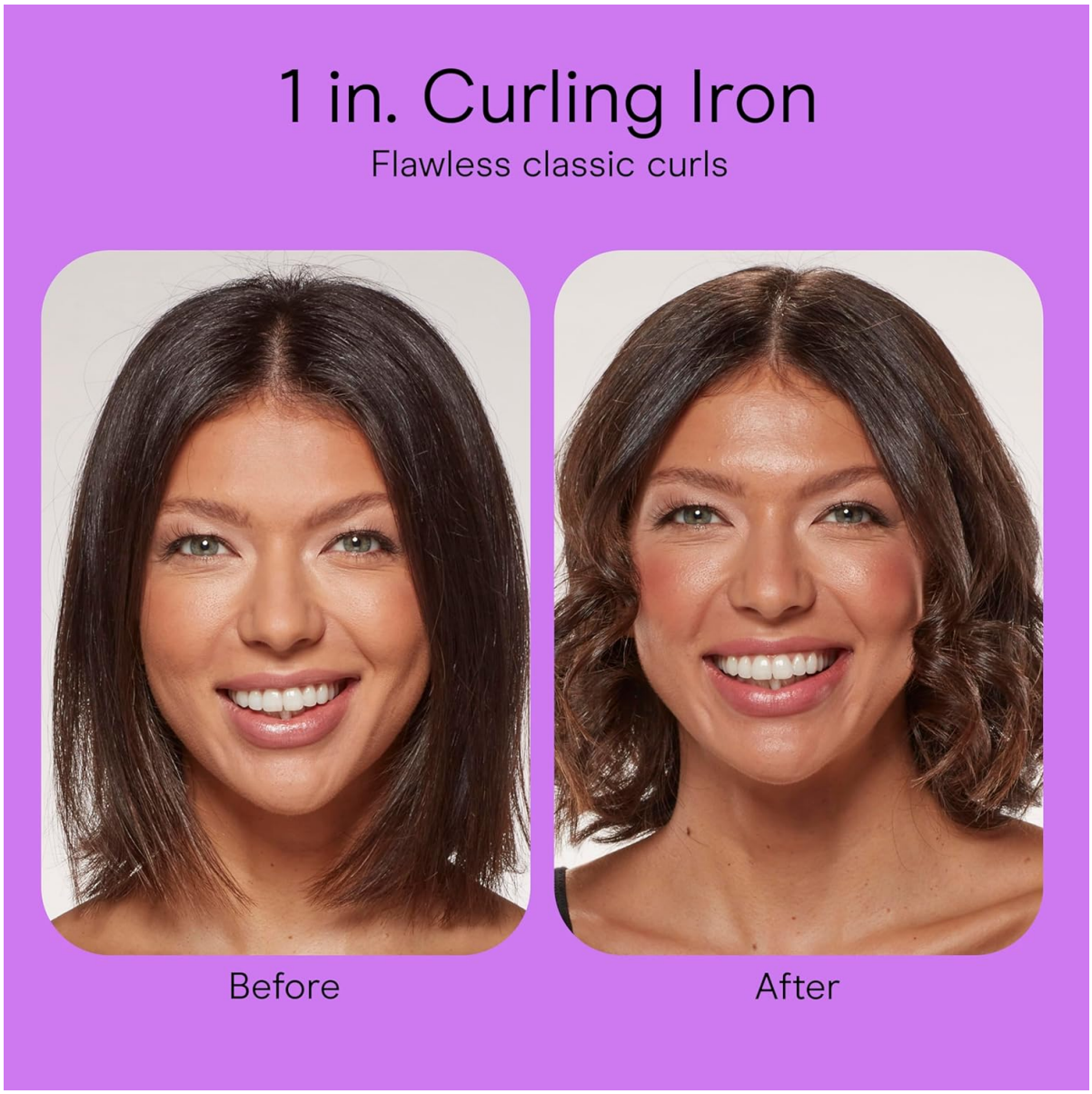
Image: A woman's hair before and after using the 1-inch curling iron, demonstrating the creation of flawless classic curls.

The Conair Double Ceramic 1-Inch Curling Iron offers 30 heat settings. Use the following guide to select the appropriate temperature for your hair type: