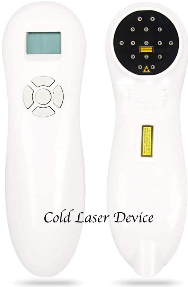
Cold Laser Device