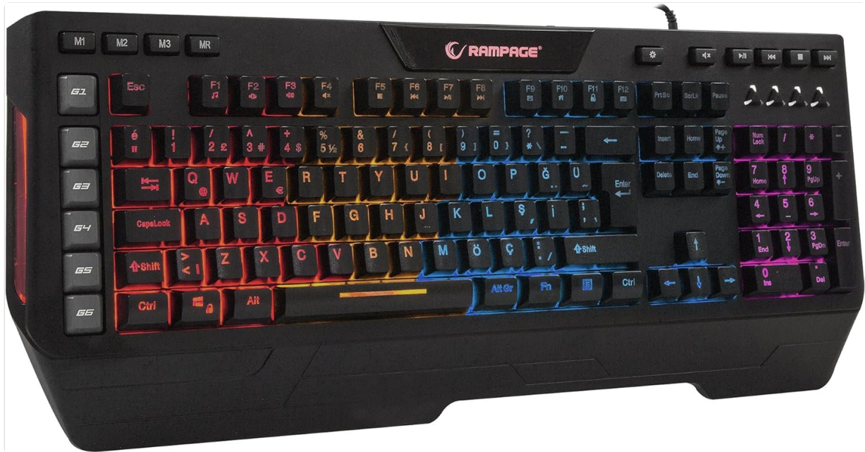
Image: The Rampage MACROMY KB-R33 RGB Gaming Keyboard ready for use, showing its full layout and connection cable.