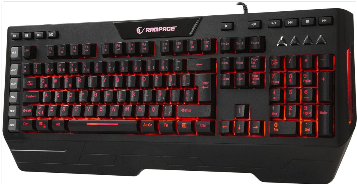
Image: The Rampage MACROMY KB-R33 RGB Gaming Keyboard illuminated with a red backlight, highlighting key visibility.