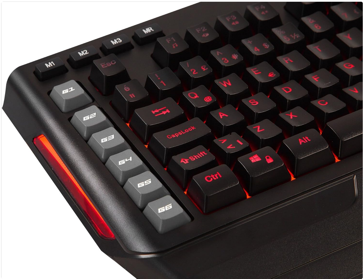
Image: A close-up view of the dedicated G1-G6 macro keys on the left side of the Rampage MACROMY KB-R33 keyboard.