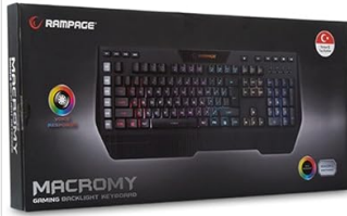
Rampage MACROMY KB-R33 Siyah RGB Aydınlatmalı Q Multimedia Oyuncu Klavyesi

Image: Top-down view of the Rampage MACROMY KB-R33 RGB Gaming Keyboard showcasing its full RGB lighting and key layout.