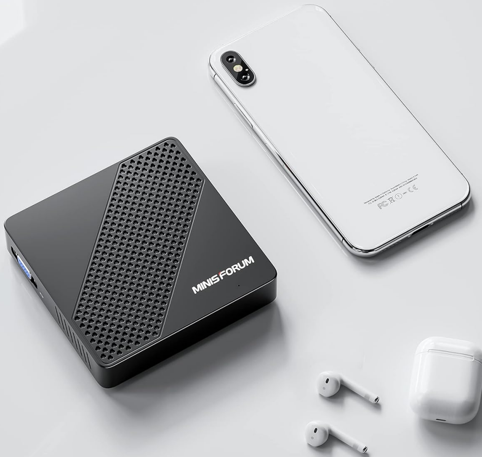
Figure 3: Size comparison of the MINISFORUM N40 Mini PC with a smartphone, highlighting its ultra-compact design.

Super mini but powerful, does not occupy space, but can meet your office and entertainment needs