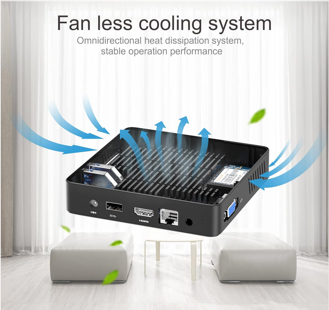
Figure 8: Internal view of the Mini PC, illustrating its fanless cooling system with heat dissipation elements.

Omnidirectional heat dissipation system, stable operation performance