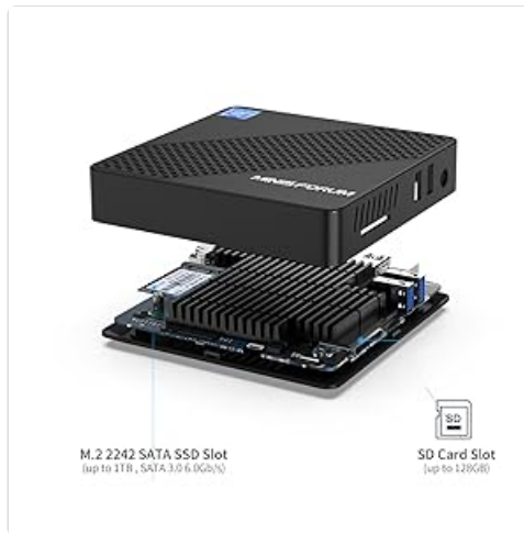
Figure 5: Internal view of the Mini PC, highlighting the M.2 2242 SATA SSD slot and SD card slot for storage expansion.