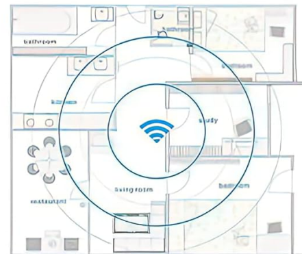
Figure 6: Illustration of the Mini PC's wireless and wired connectivity options, including Dual Band WiFi and Gigabit Ethernet.