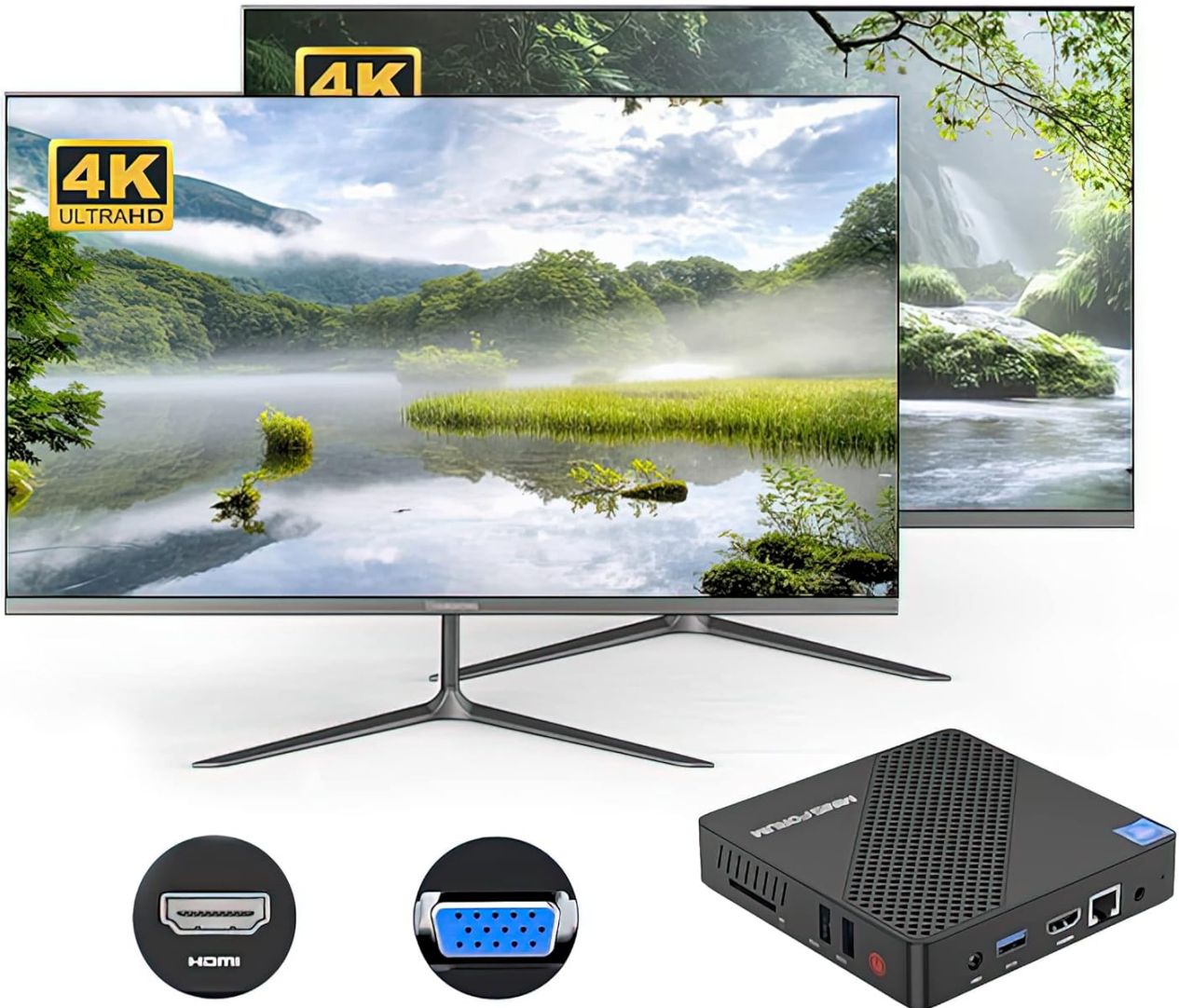
Figure 4: Rear view of the Mini PC, illustrating the HDMI and VGA ports for display connections. The HDMI port supports up to 4K@60Hz UHD resolution.

HDMI2.0a port greatly improves 4k resolution output, give you 4k@60Hz UHD.