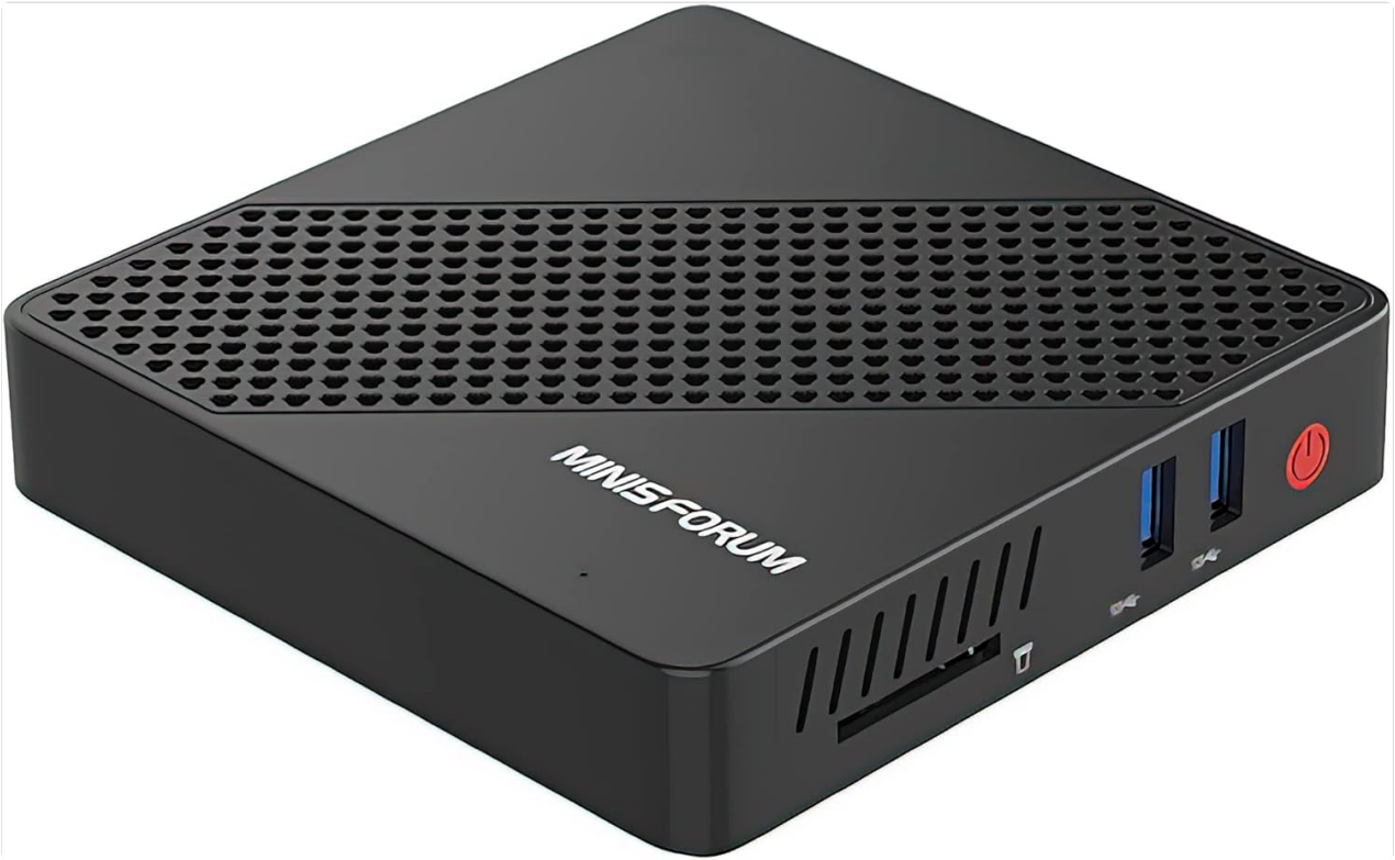
Figure 1: Front view of the MINISFORUM N40 Mini PC, showing USB ports and power button.

The MINISFORUM N40 Mini PC measures approximately 4.72 x 4.72 x 1.14 inches (LxWxH) and weighs about 1.39 pounds, making it highly portable and space-saving.