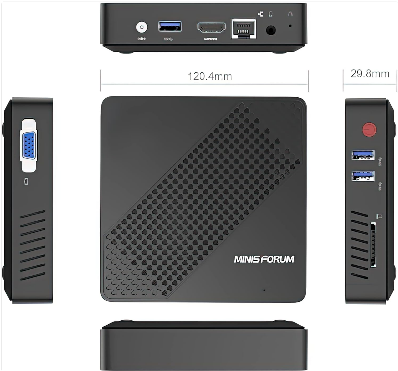
Figure 2: Detailed dimensions of the MINISFORUM N40 Mini PC from multiple angles.