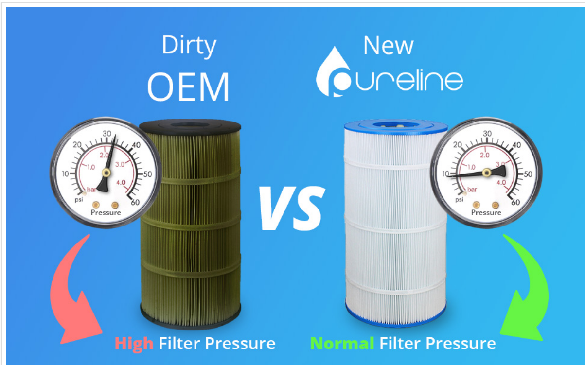
Image: A visual comparison illustrating a dirty, old filter cartridge with high pressure versus a new Pureline cartridge with normal operating pressure, indicating when replacement is needed.