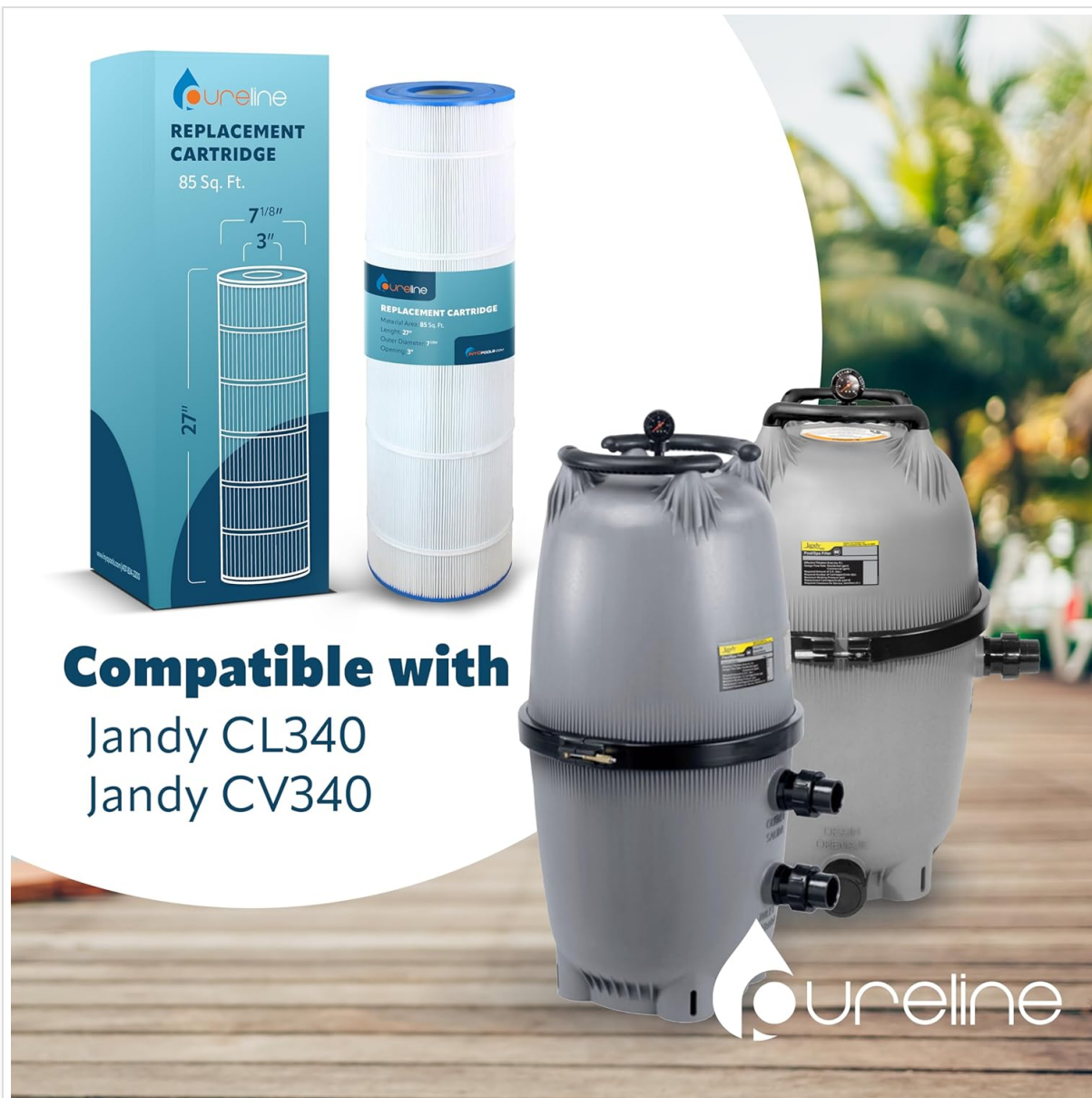
Image: The Pureline filter cartridge displayed next to two Jandy pool filter housings (CL340 and CV340), illustrating its compatibility.