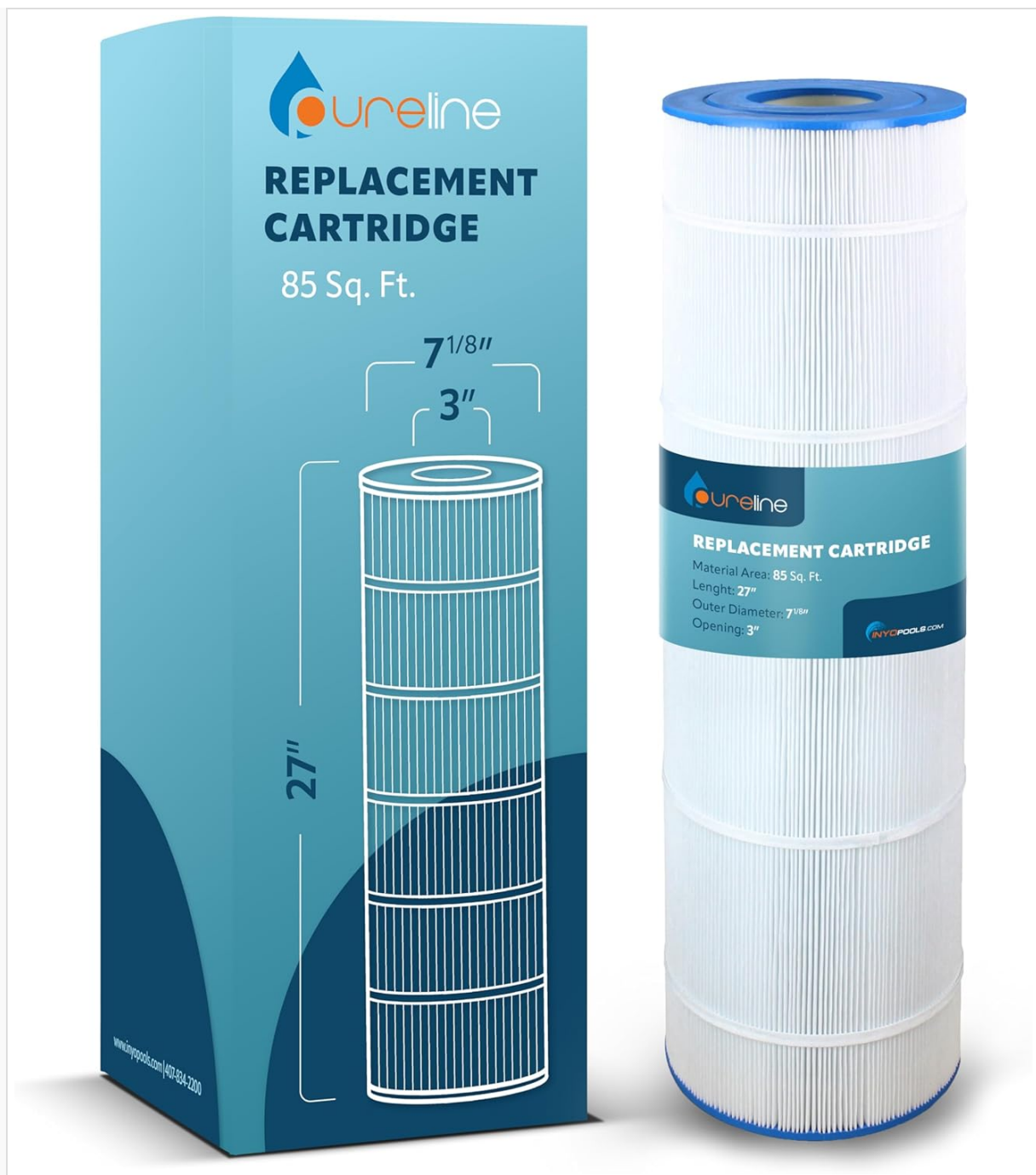
Image: The Pureline PL0100 pool filter cartridge shown alongside its product packaging, highlighting the brand and key specifications.