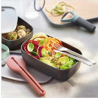
Flatware and sleeve with a salad.