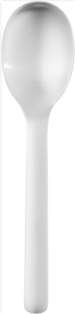
Stainless Steel Spoon