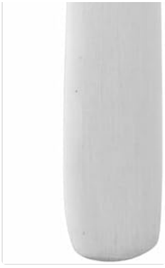
Stainless Steel Knife