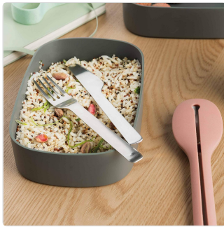
Flatware and sleeve with a meal.