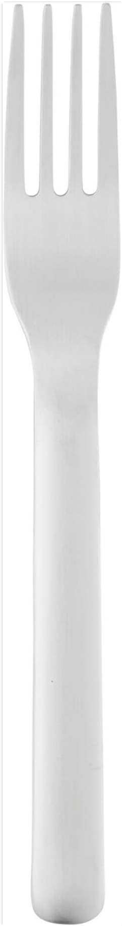
Stainless Steel Fork