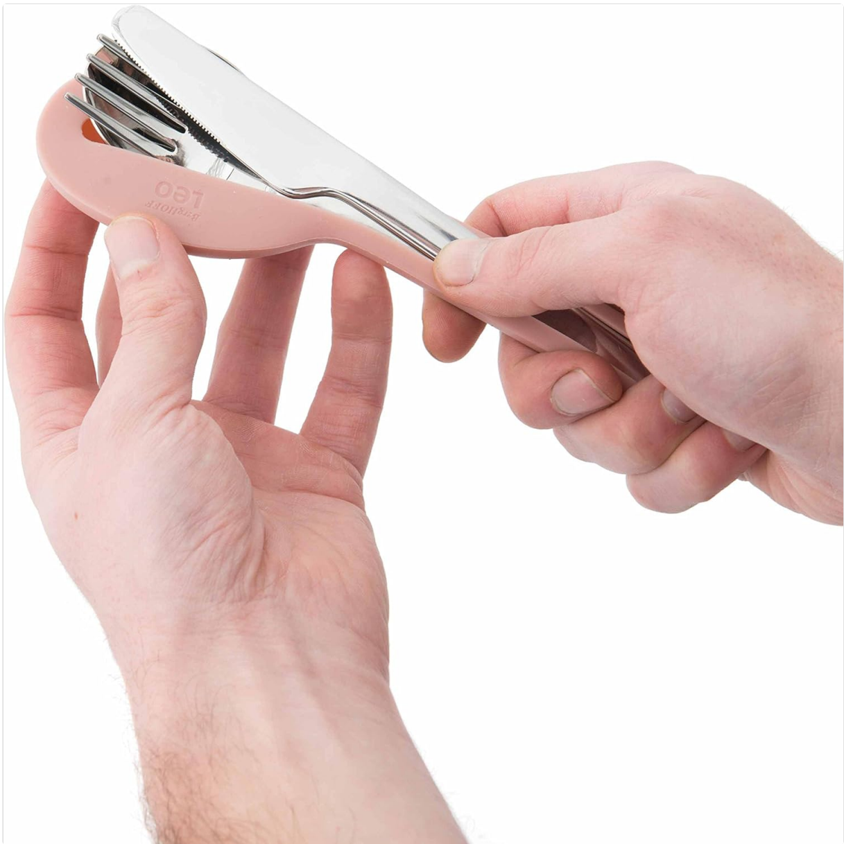
Inserting flatware into the silicone sleeve for compact storage.