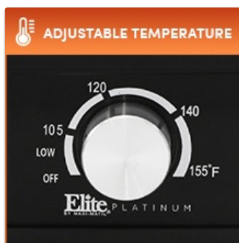
Image: A close-up of the control panel on the dehydrator base, showing the temperature dial with settings from OFF, 105°F (LOW), 120°F, 140°F, to 155°F. The Elite Platinum logo is visible below the dial.