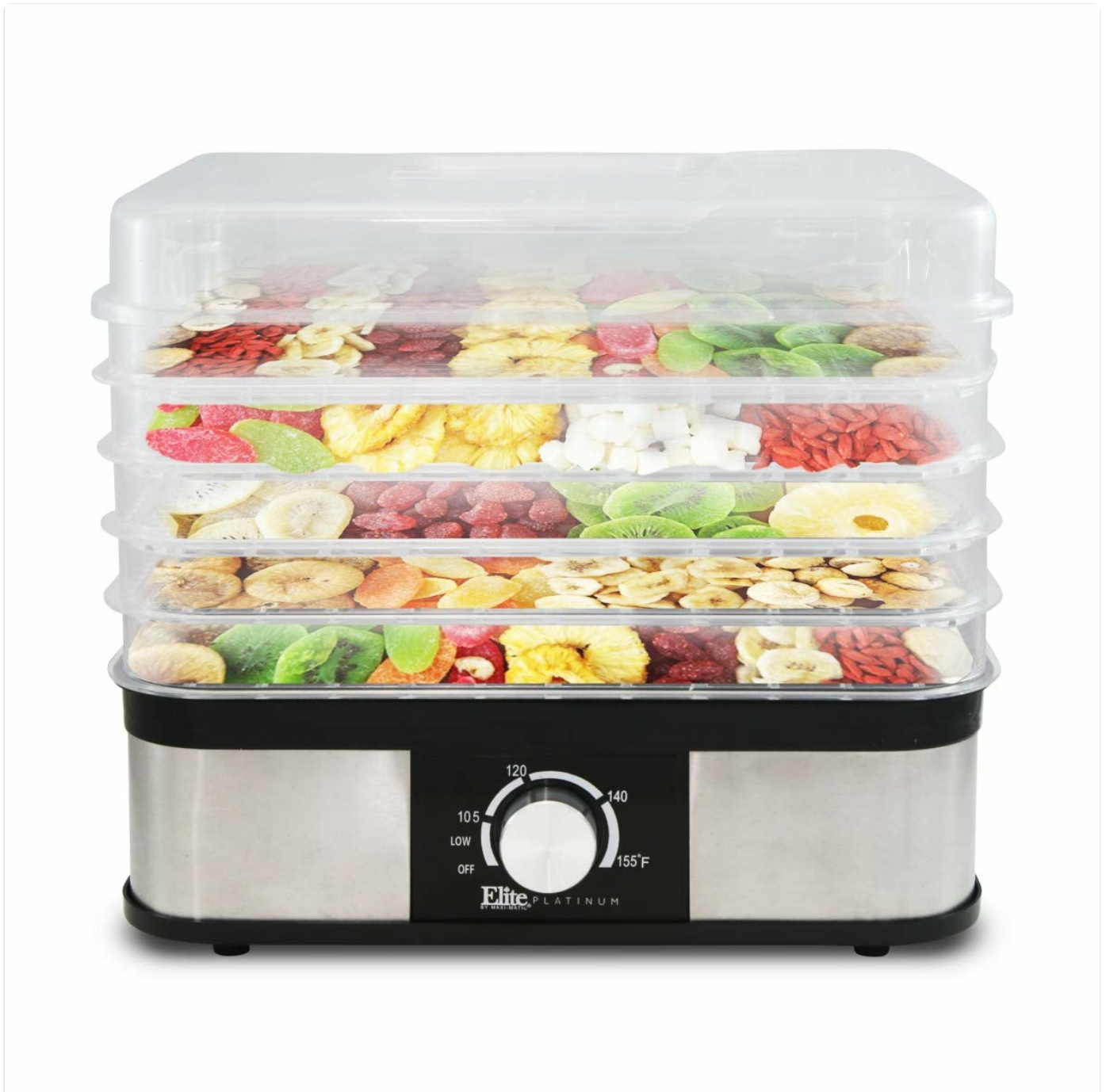
Image: The Elite Gourmet EFD-1159 Food Dehydrator showing its five clear drying trays, transparent lid, and stainless steel base with a control dial. Dimensions are indicated as approximately 10 inches wide, 11.25 inches high, and 12.75 inches deep.