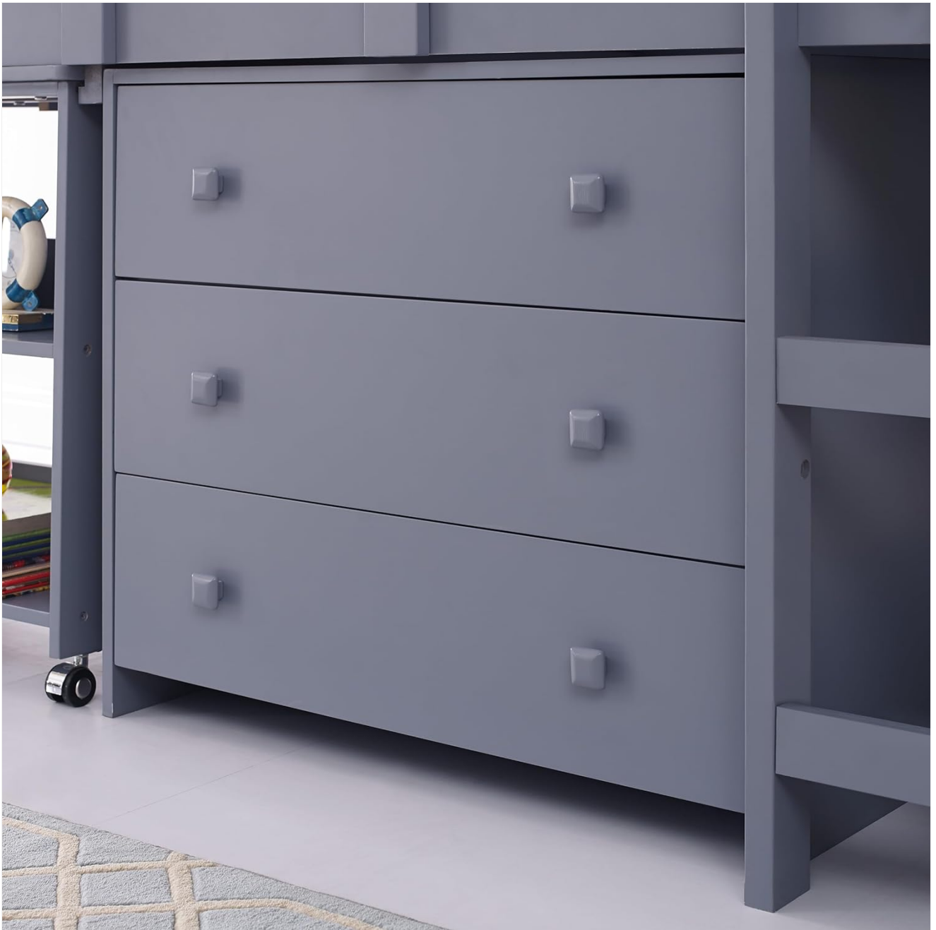
Image 5.2: Detail of the integrated bookcase, showing storage capacity.