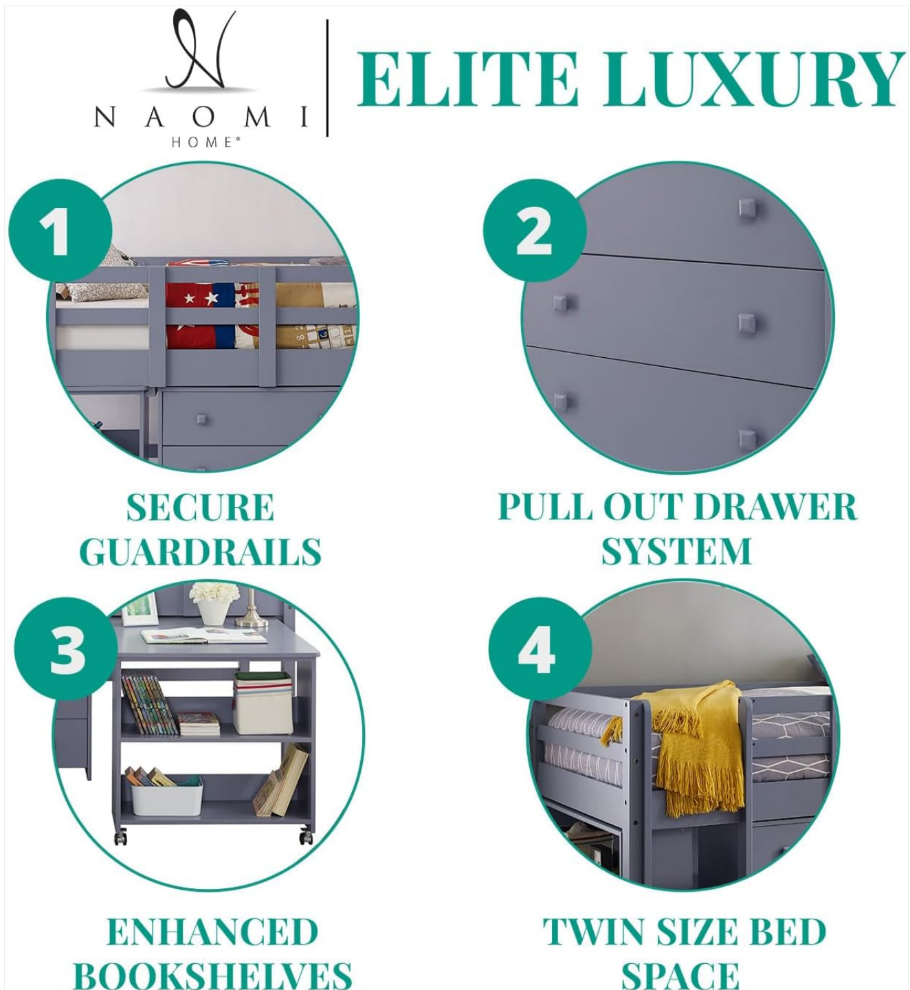
Image 5.1: The pull-out desk in use, demonstrating its functionality for study or activities.

The desk is designed to slide out for use and tuck away when not needed. Gently pull the desk unit outwards from under the bed until it is fully extended and stable. To retract, push the desk back into its storage position. Avoid placing excessive weight on the desk when extended.