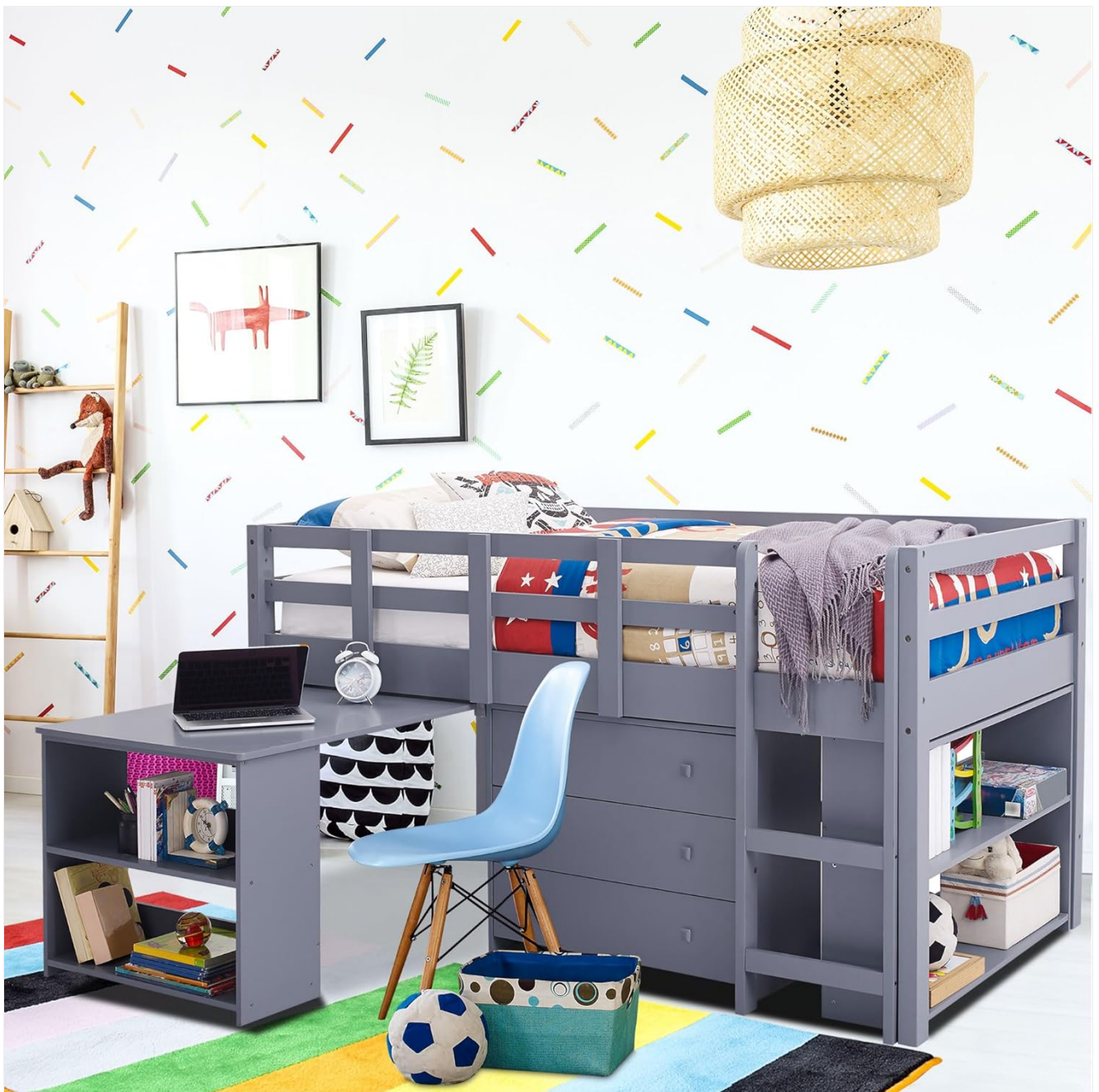
Image 1.1: Overview of the Naomi Home Grey Twin Size Loft Bed, showcasing the integrated desk, bookcase, and ladder.