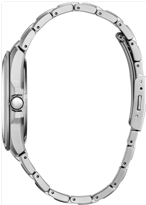
Figure 3: Side profile of the watch, illustrating the crown and the sleek design of the Super Titanium case.