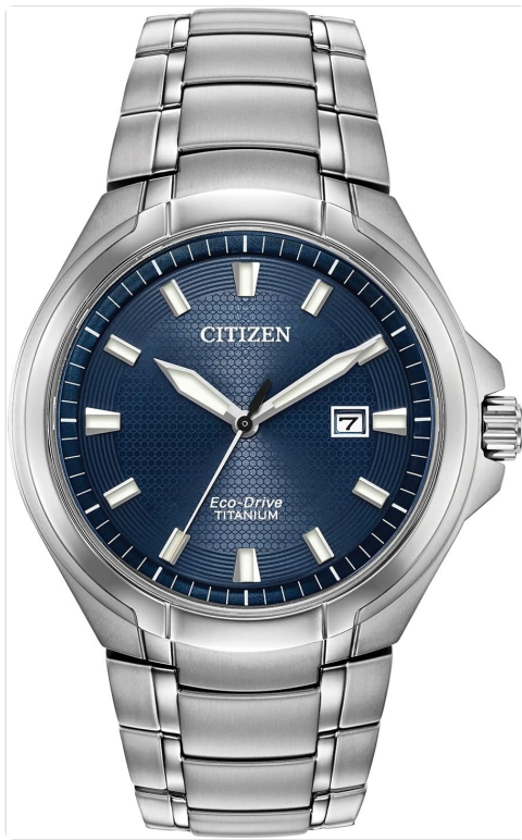
Figure 1: Front view of the Citizen Eco-Drive Paradigm watch, showcasing its blue dial, luminous hands and markers, and silver-tone Super Titanium bracelet.