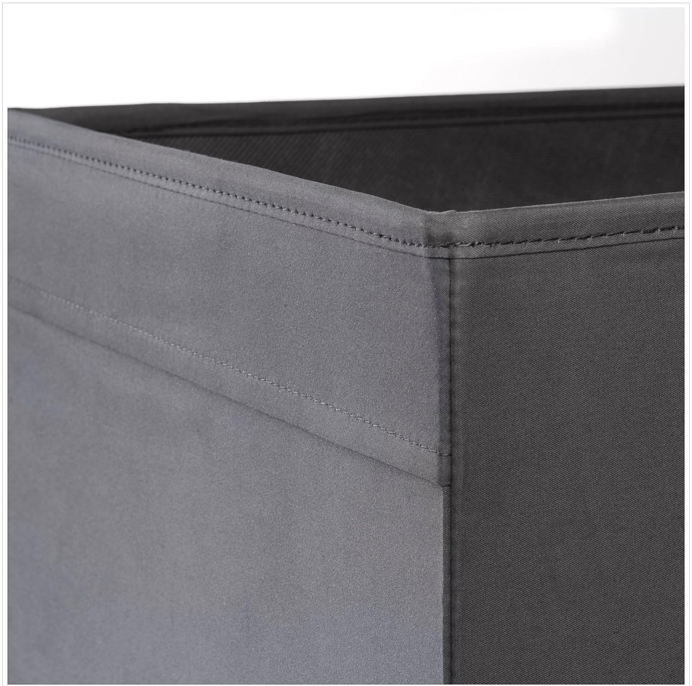
Image 1: Close-up view of the Drona storage box fabric and construction details.