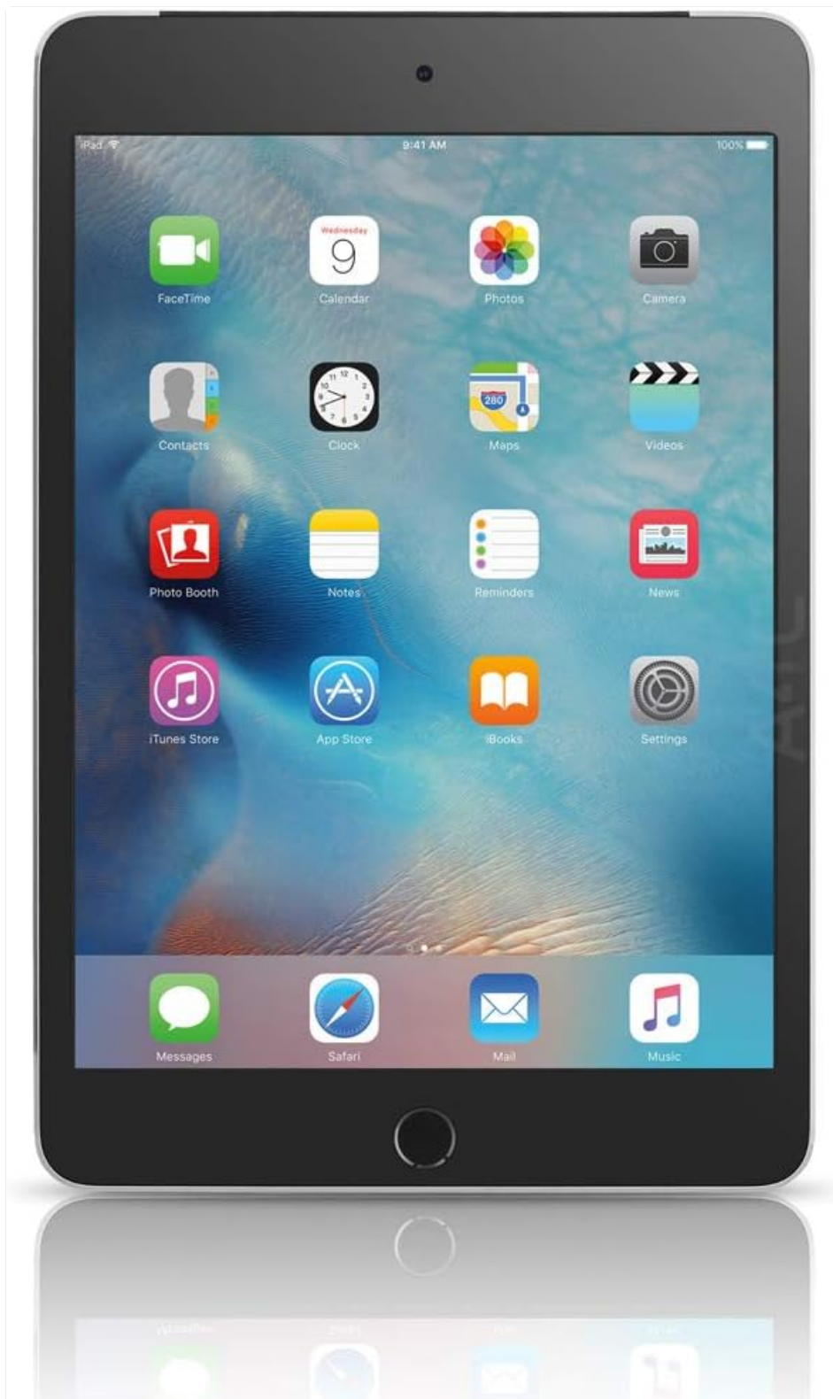
Image Description: A straight-on front view of the Apple iPad Mini 4, showcasing its display with the standard iOS home screen layout and app icons. The device is in Space Gray.