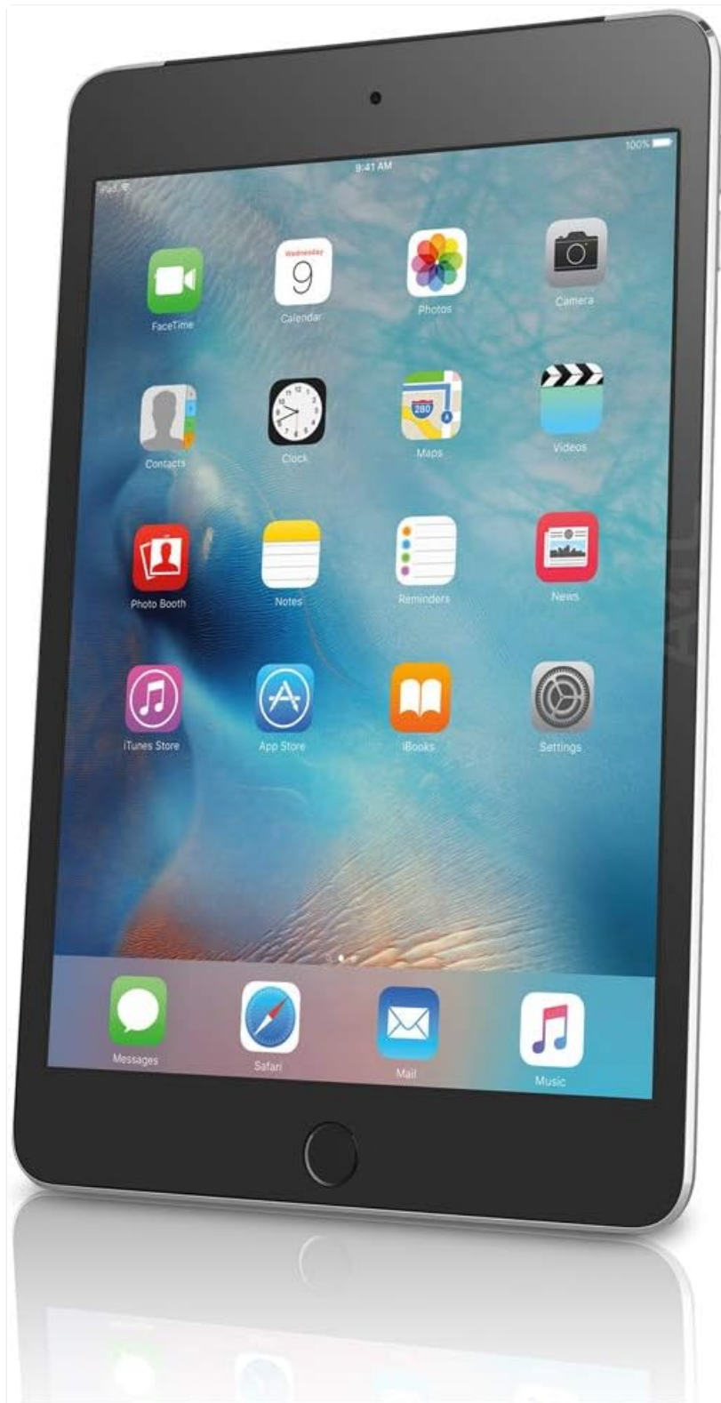
Image Description: A front view of the Apple iPad Mini 4, displaying its home screen with various app icons such as FaceTime, Calendar, Photos, Camera, and Settings. The device is in Space Gray color.