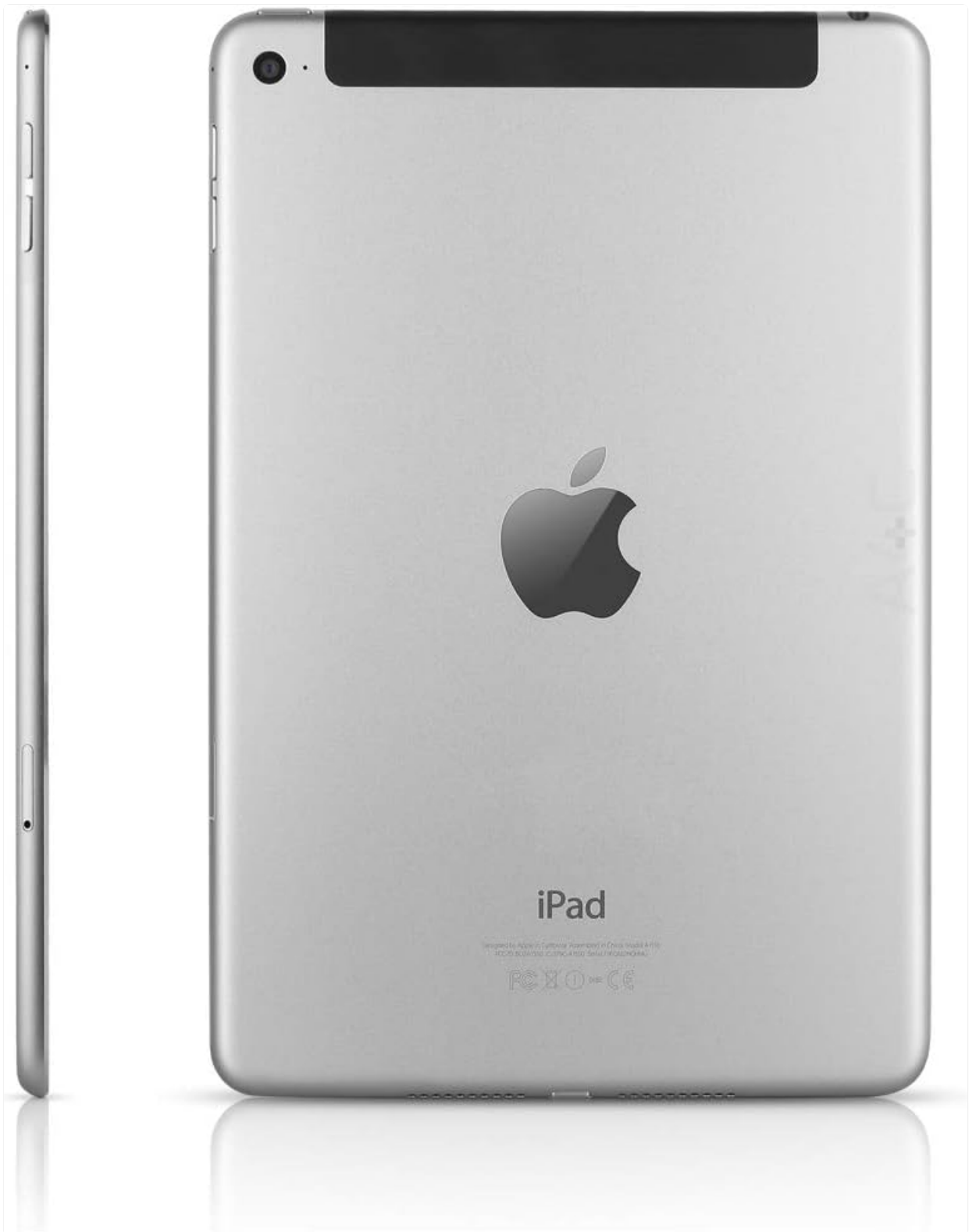
Image Description: A side view of the Apple iPad Mini 4, highlighting its slim profile and the placement of the volume buttons and mute/rotation lock switch on the side edge.