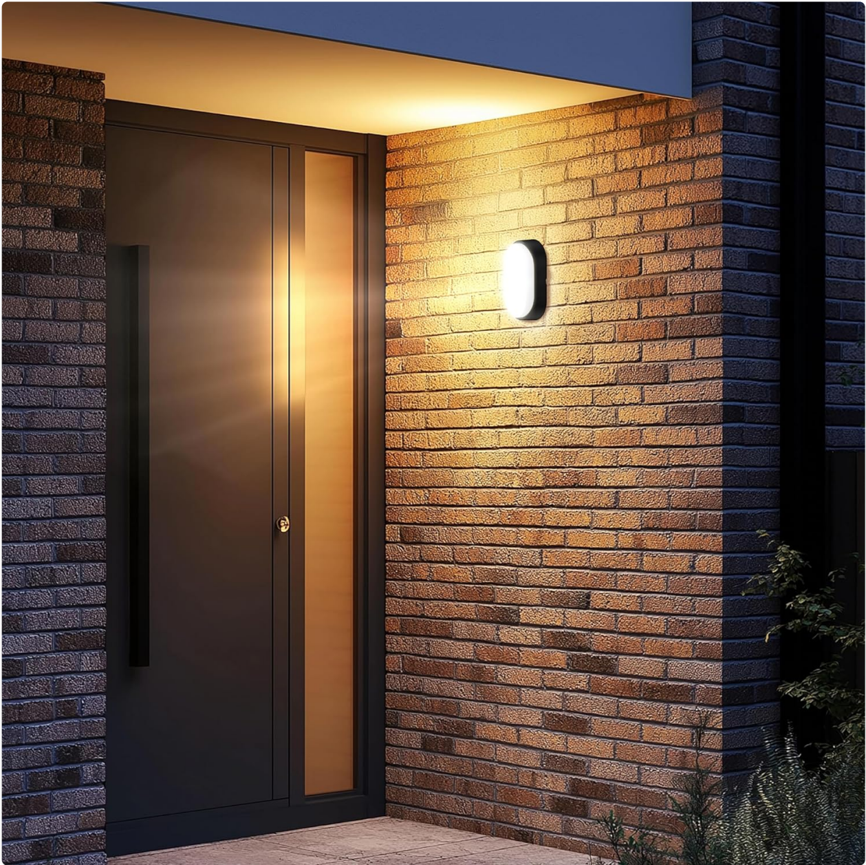
Image: The light fixture installed next to an entrance door, demonstrating its effective illumination for outdoor spaces.

Image: The Luceco Oval Wall Light provides versatile lighting options with a space-saving profile, ideal for interior and exterior use in hallways, porches, or driveways.