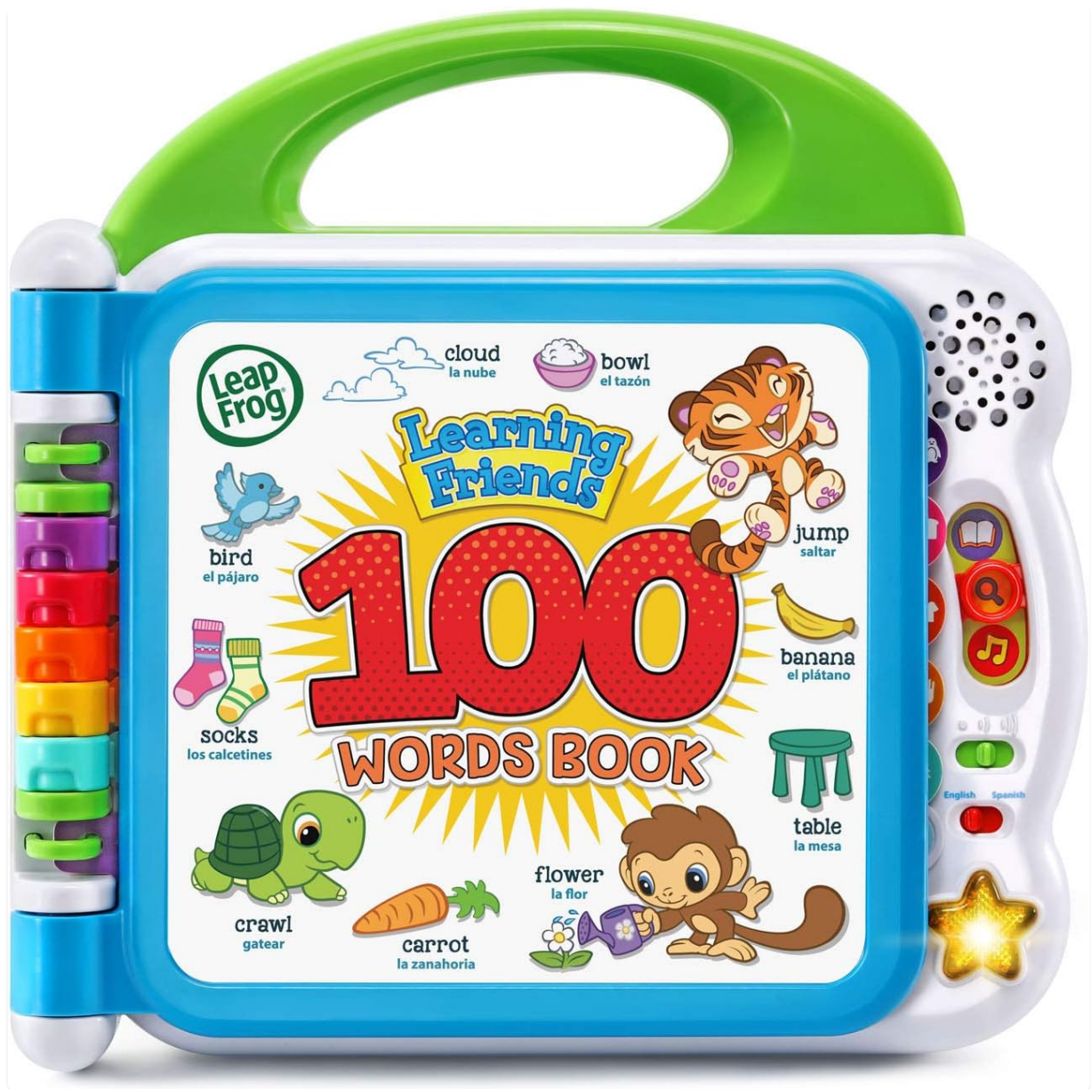
Image: Front view of the LeapFrog Learning Friends 100 Words Book.