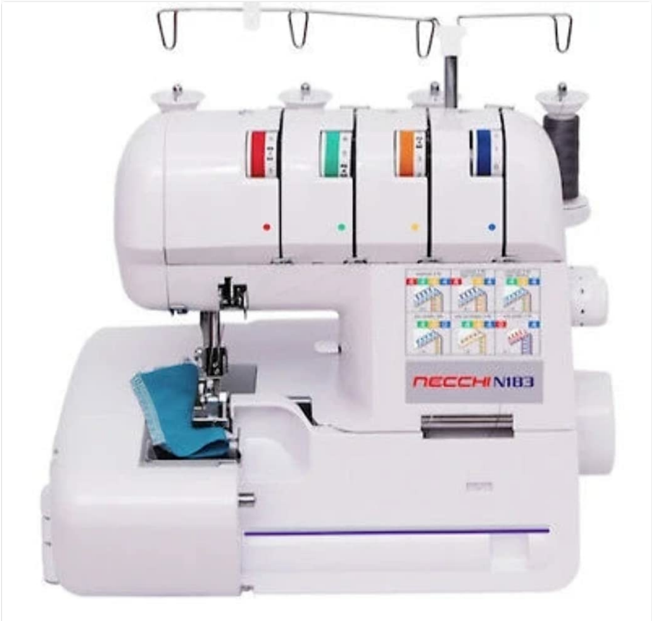
Figure 1: Front view of the Necchi N183 Overlock Sewing Machine, showing the thread guides and tension dials.

Carefully remove the machine from its packaging. Place the machine on a stable, flat surface with adequate lighting. Ensure there is enough space around the machine for comfortable operation and fabric handling.