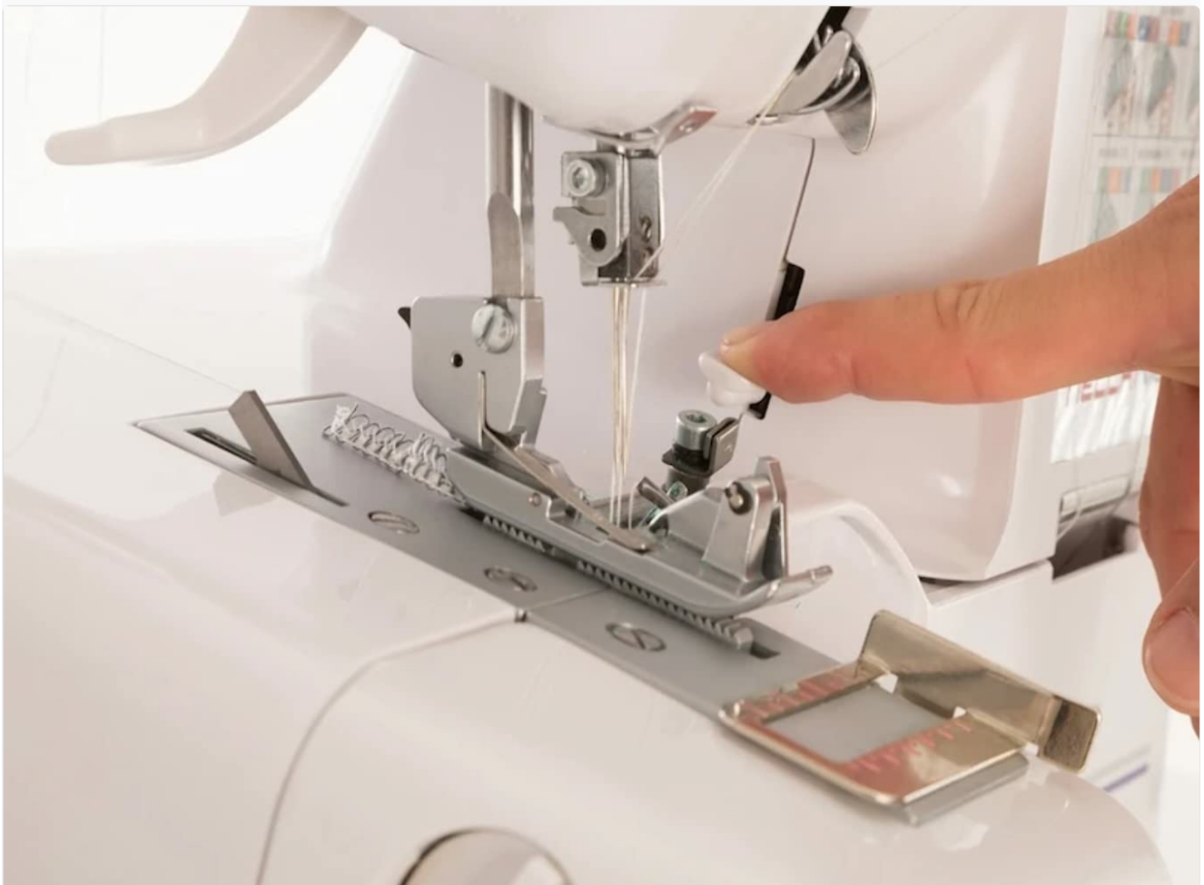
Figure 4: A close-up view demonstrating the precise operation of the Necchi N183, with a hand guiding fabric under the presser foot.

Use the dedicated dials to adjust the stitch length and cutting width. Experiment with different settings on scrap fabric to achieve the desired stitch appearance for your project.