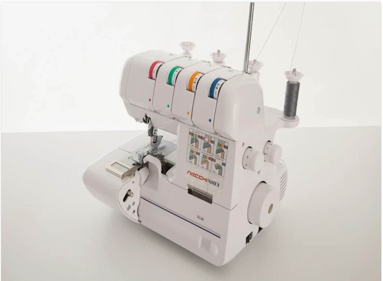
Figure 3: Angled view of the Necchi N183, highlighting the thread spools and the general setup for operation.