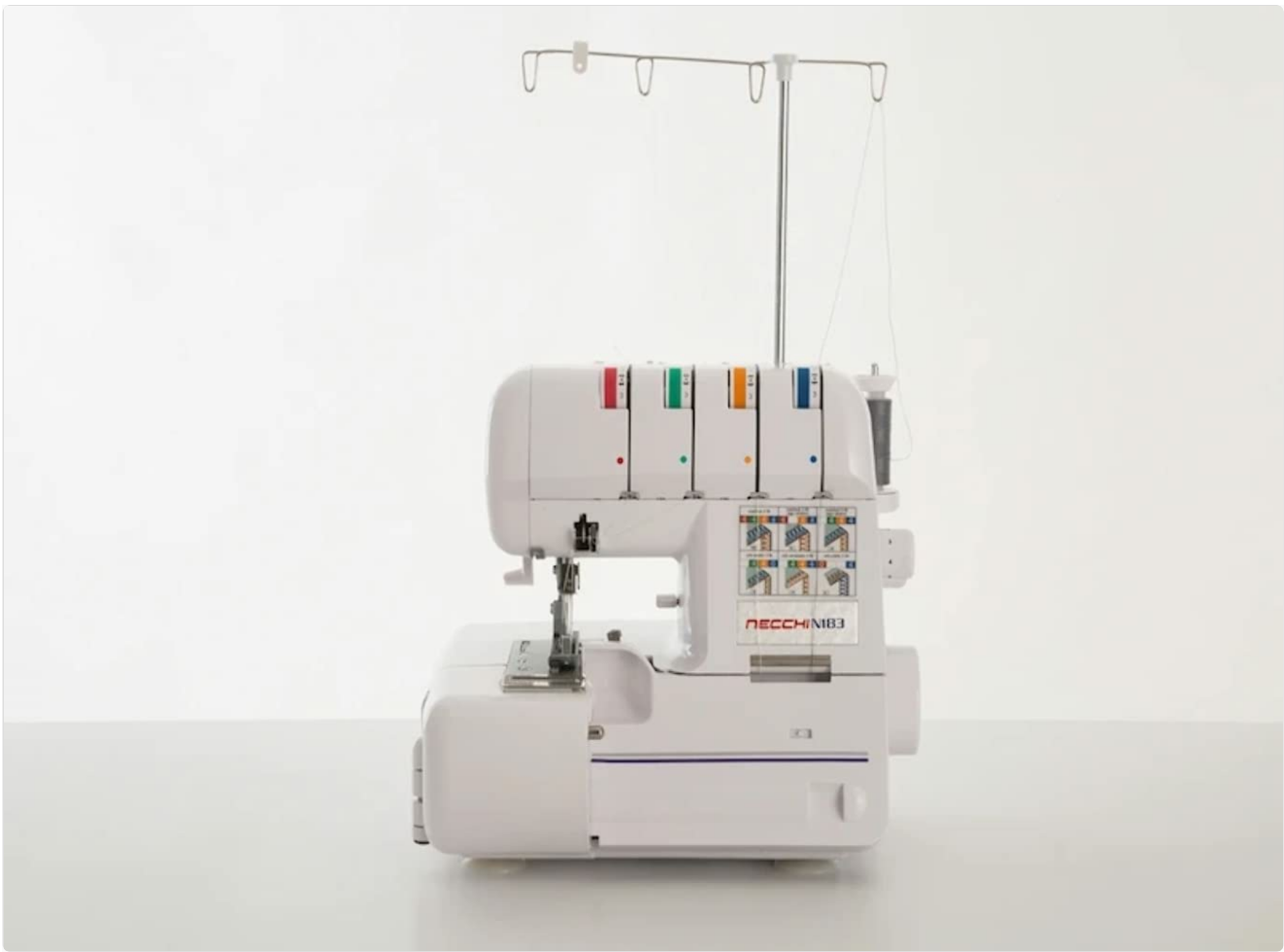
Figure 6: Side view of the Necchi N183 Overlock Sewing Machine, illustrating its compact design and overall structure.