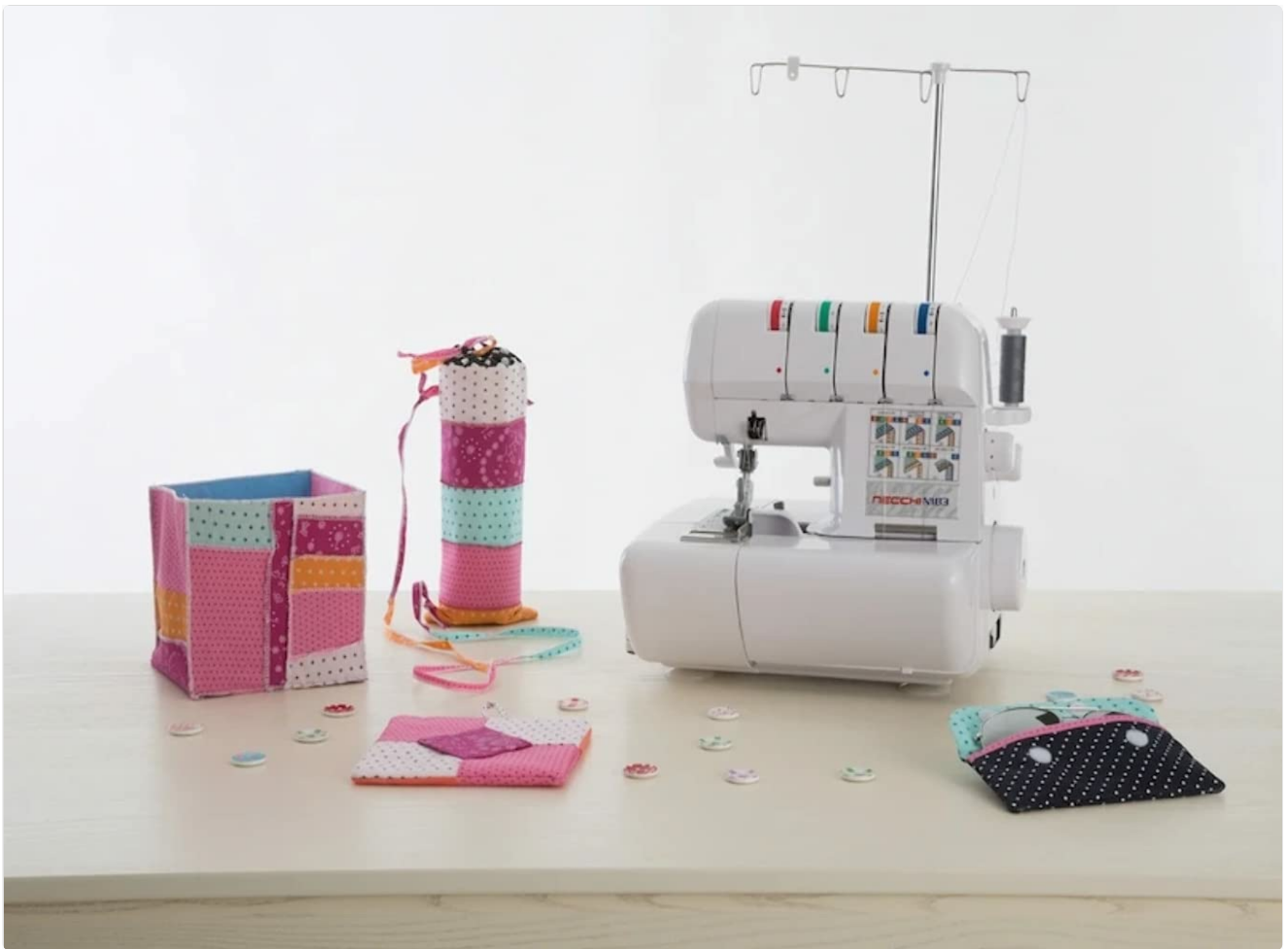
Figure 5: The Necchi N183 Overlock Sewing Machine displayed alongside various finished sewing projects, showcasing its versatility.