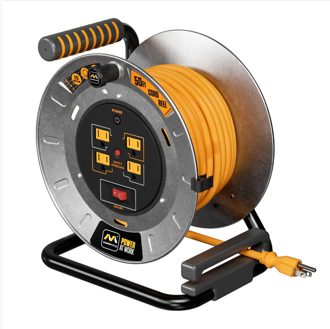
Figure 1: Masterplug 50ft Metal Cord Reel, showing the overall design with the orange cord and metal drum.