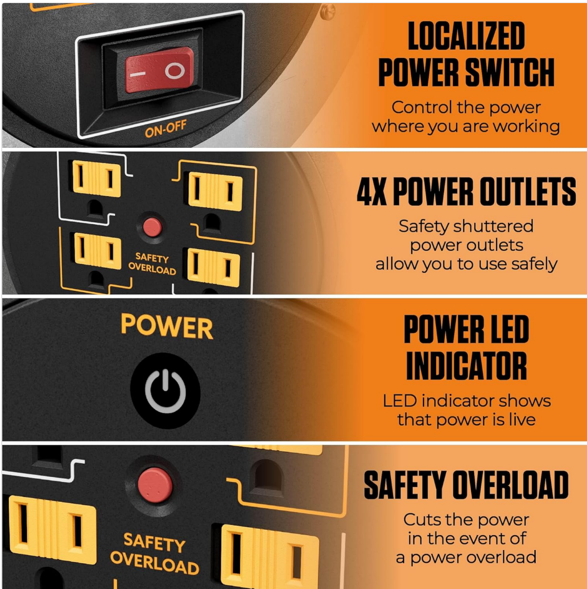
Figure 2: Close-up view of the cord reel's control panel, highlighting the localized power switch, four grounded outlets, power LED indicator, and safety overload reset button.

Video 1: Official Masterplug 'Power At Work' product overview, demonstrating various cord reel features and applications.