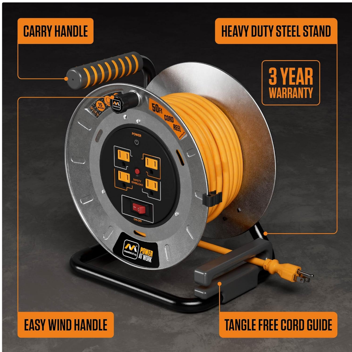
Figure 3: The cord reel featuring the easy wind handle and integrated cord guide for efficient cord management.