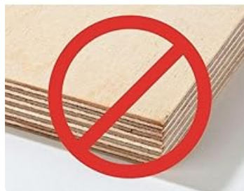
Image: A graphic emphasizing that the product is made of 100% solid wood, not plywood, highlighting material quality.

OUR PRODUCTS ARE MADE OF 100% SOLID WOOD, NOT PLYWOOD