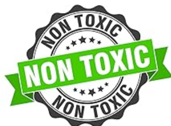
Image: A seal indicating the product is non-toxic, emphasizing safety features.