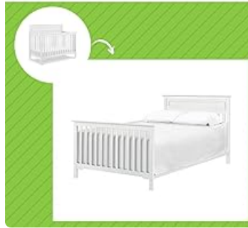
Image: A white crib frame successfully converted into a full-size bed, demonstrating the final appearance of the converted furniture.

The bed is designed to support up to 600 pounds when paired with appropriate additional slats (sold separately), ensuring long-term durability and safety for both children and adults.