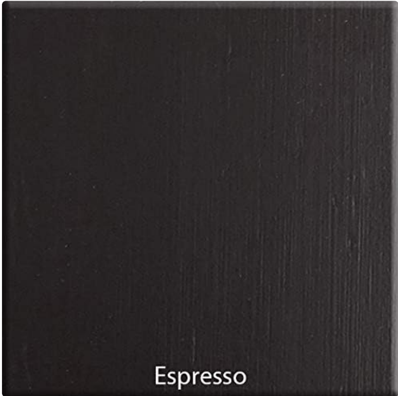
Image: A color swatch displaying the Espresso finish of the product.