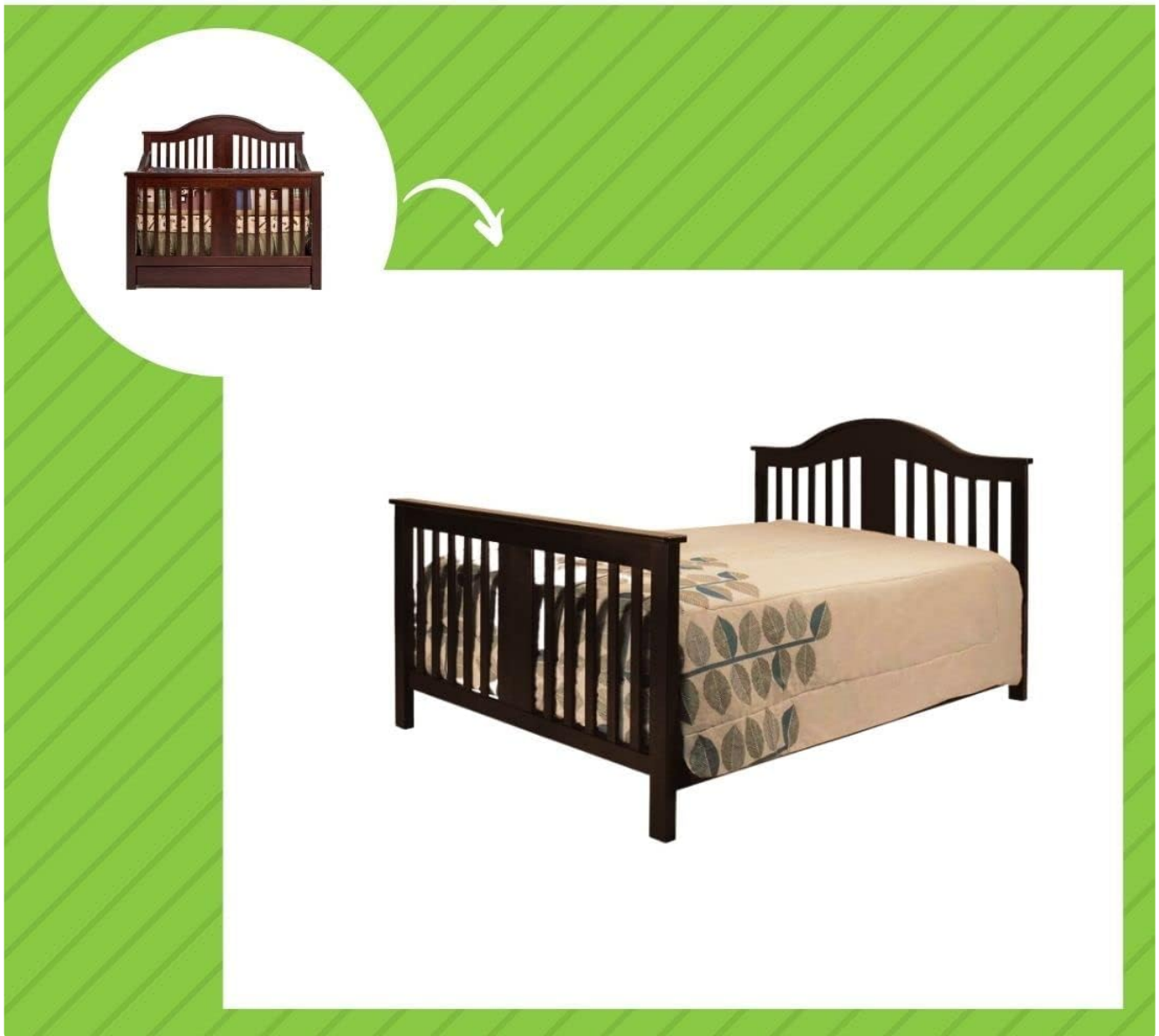
Image: A DaVinci Baby Cameron 4-in-1 Convertible Crib in espresso finish, shown in its crib configuration.