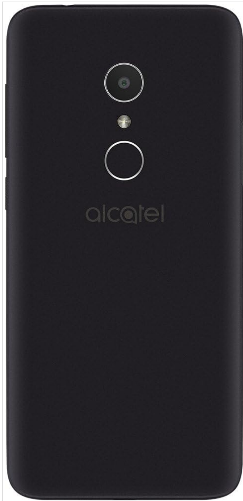
Image: Rear view of the Alcatel 1X smartphone, highlighting the camera module and fingerprint sensor. The back cover can be removed to access SIM and microSD card slots.