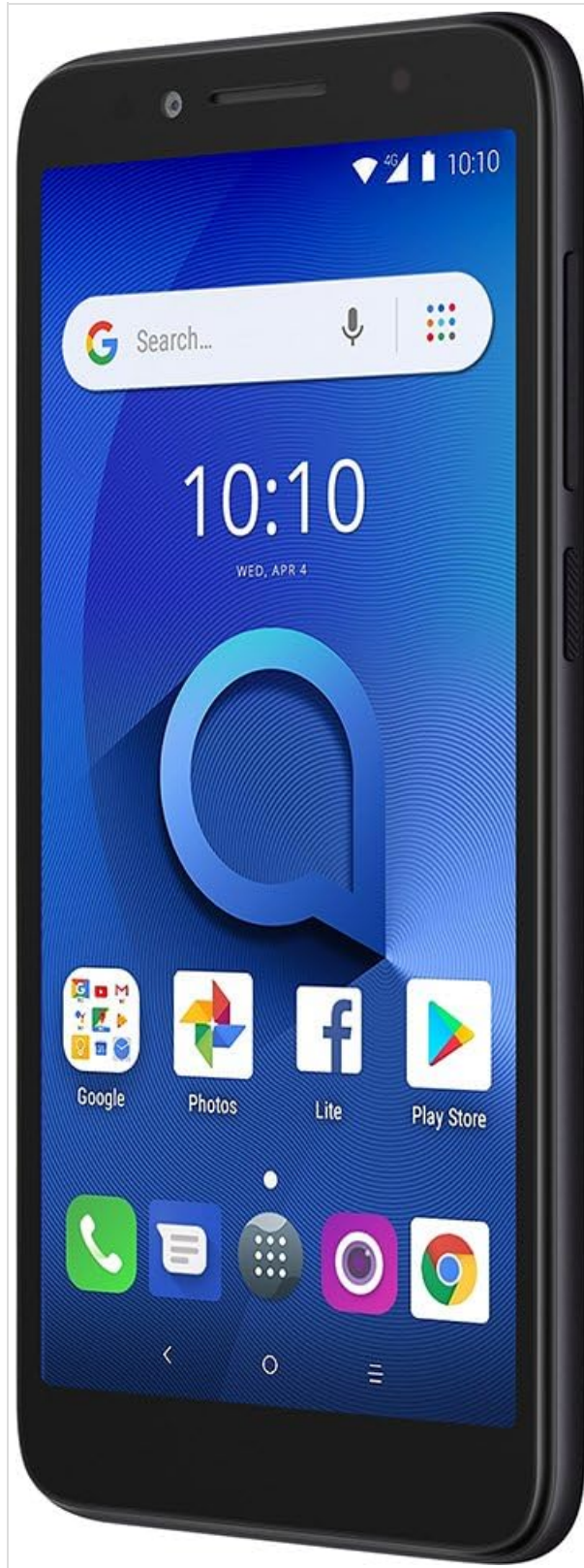
Image: Right side of the Alcatel 1X, showing the volume rocker and power button.