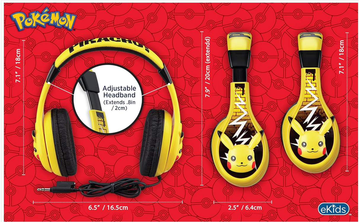
Image: The adjustable headband of the headphones, showing how it extends for a custom fit.

The headband is adjustable to provide a custom and comfortable fit for various head sizes. Gently slide the earcups up or down along the headband to achieve the desired size. The soft ear cushions are designed for extended wear comfort.