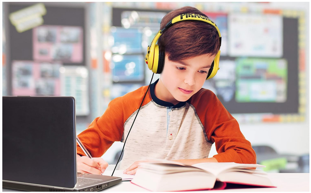
Image: A child wearing the headphones while engaged in schoolwork with a laptop and book.