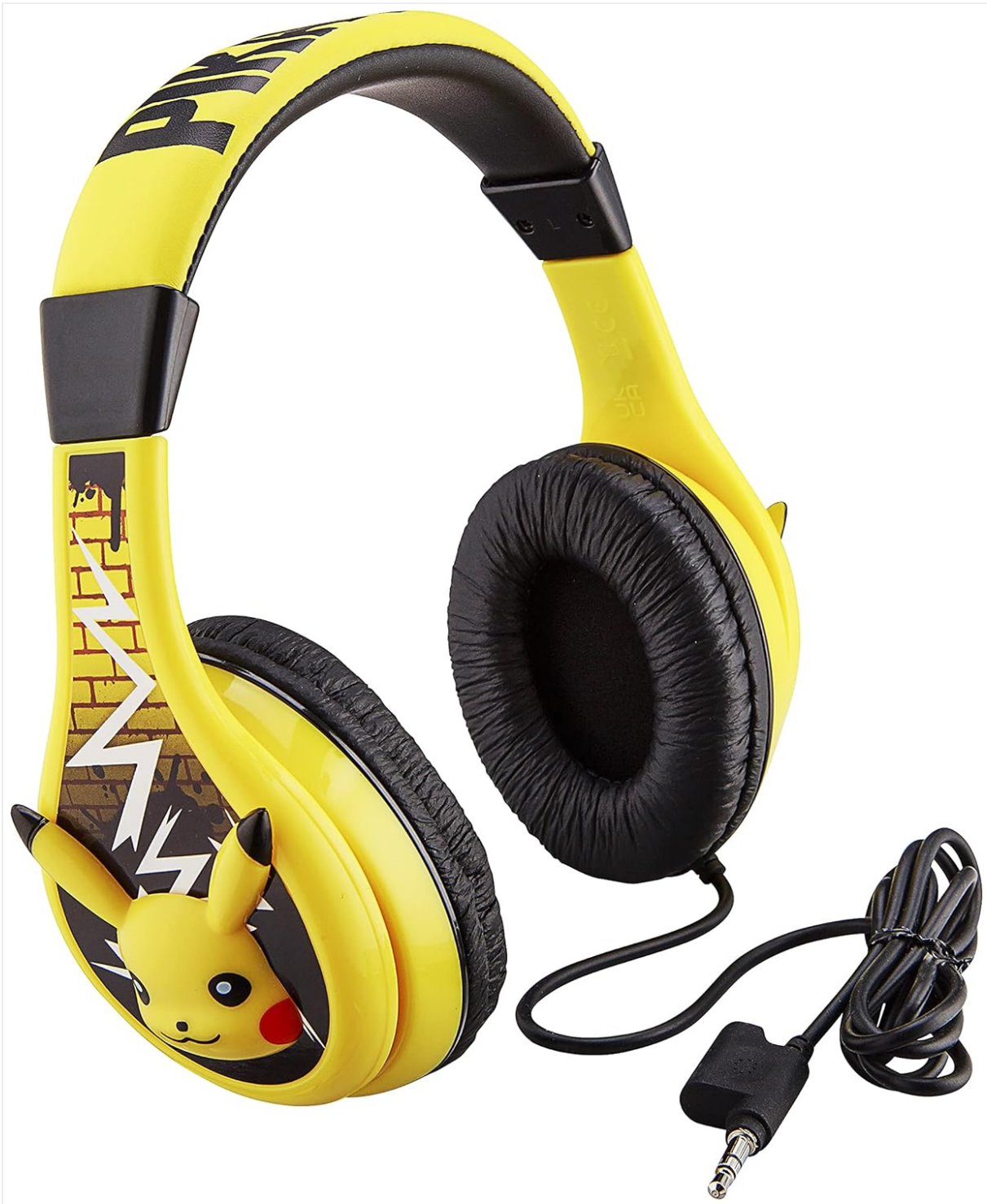
Image: Front view of the eKids Pokemon Pikachu Wired Kids Headphones.