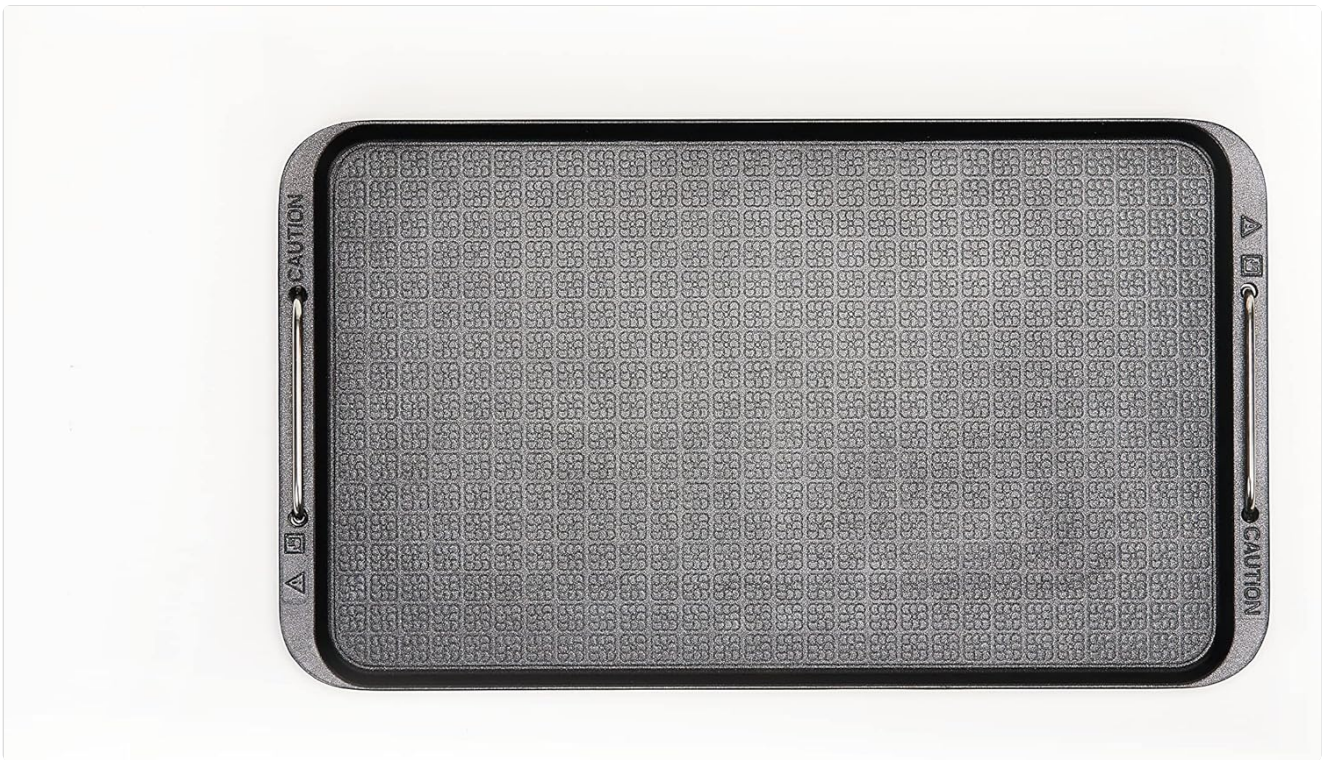
Figure 4: Griddle Plate