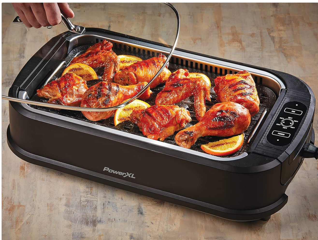
Figure 8: Dishwasher Safe Grill Plate