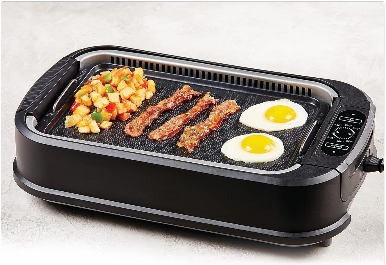
Figure 9: Product Dimensions