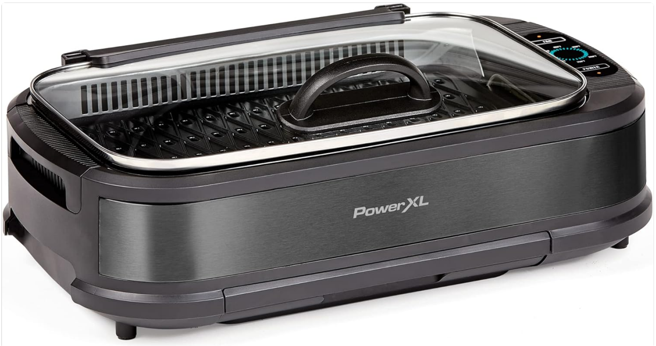
Figure 1: PowerXL Smokeless Electric Grill

Welcome to the PowerXL Smokeless Electric Grill user manual. This innovative indoor grill allows you to enjoy the authentic taste of grilled foods year-round, without the smoke typically associated with outdoor grilling. Equipped with a built-in fan and non-stick cooking surfaces, it ensures a clean and efficient cooking experience. Please read this manual thoroughly before first use to ensure safe and optimal operation of your appliance.