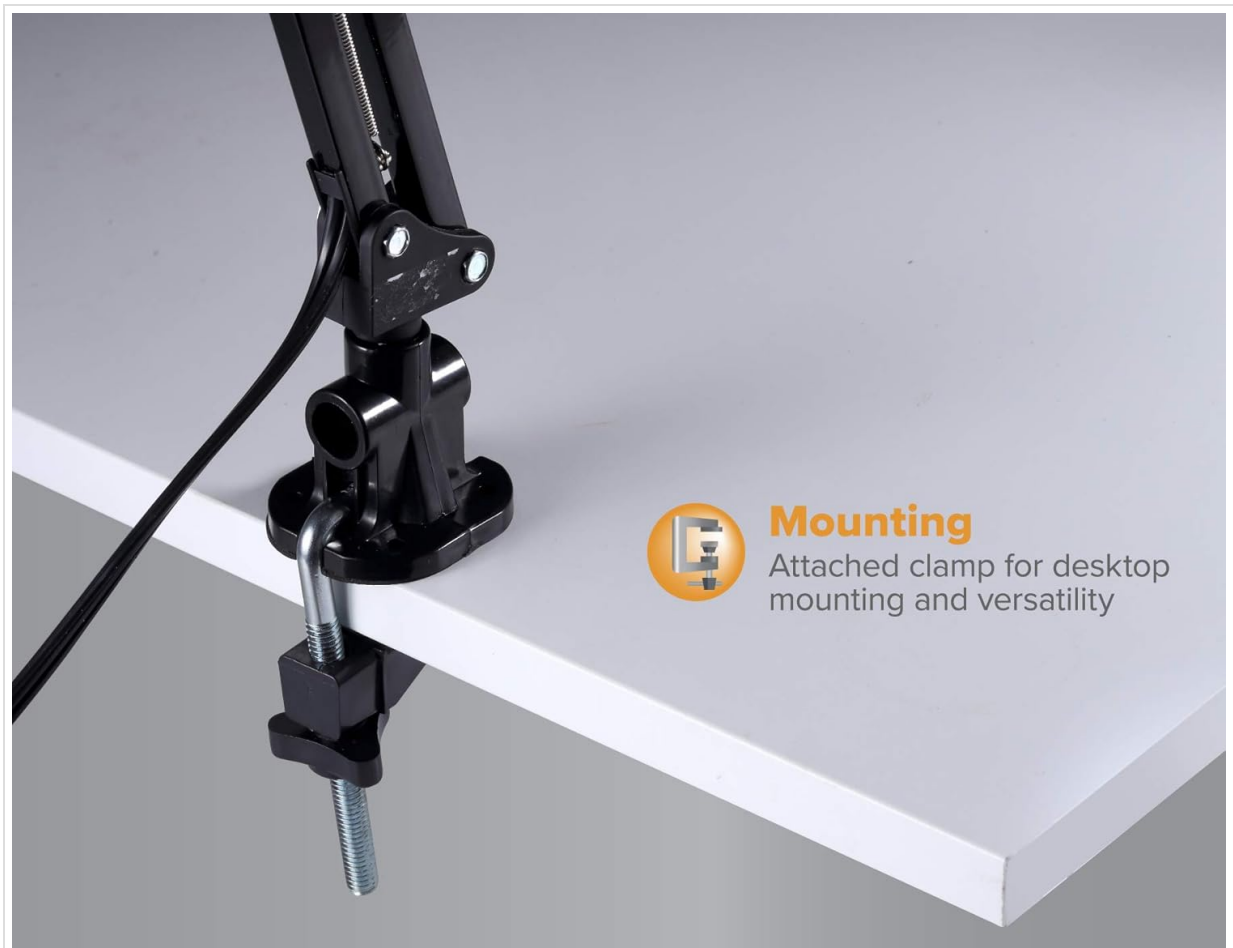
Image: The clamp mount provides versatile and secure attachment to various desk surfaces.