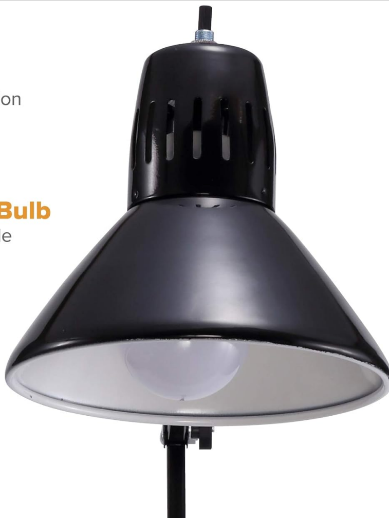
Image: The lamp head features durable all-metal construction and a replaceable LED bulb.