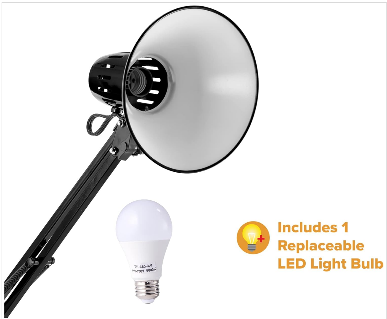
Image: The lamp includes a standard E26 replaceable LED light bulb.