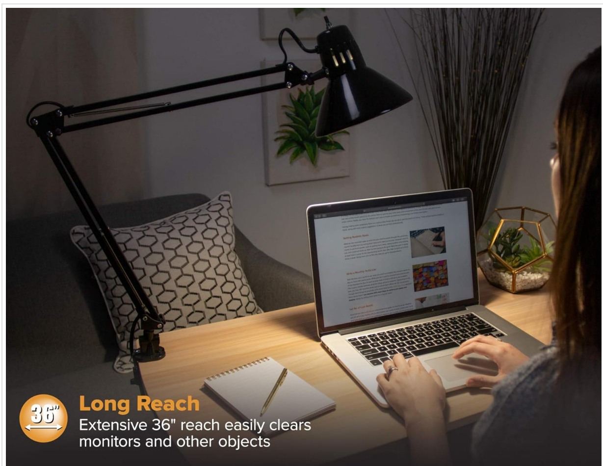
Image: The lamp's extensive 36-inch reach provides ample lighting coverage for various tasks.

Video: This video demonstrates the adjustability and functionality of the Bostitch Swing Arm Desk Lamp.