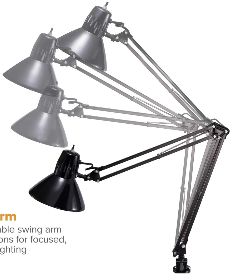
Image: The fully adjustable swing arm allows for precise positioning of the light.

Fully adjustable swing arm easily positions for focused, directional lighting