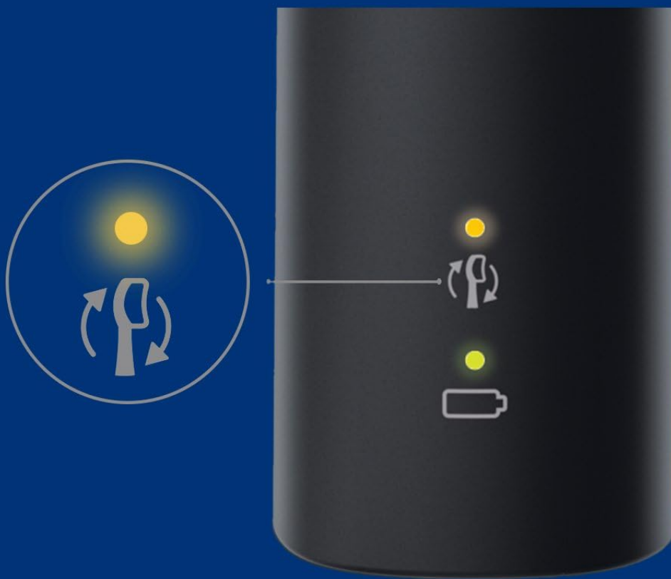
Image: A visual depiction of the BrushSync replacement reminder, indicating when a new brush head is needed for optimal performance.

BrushSync replacement reminder lets you know when to replace brush head