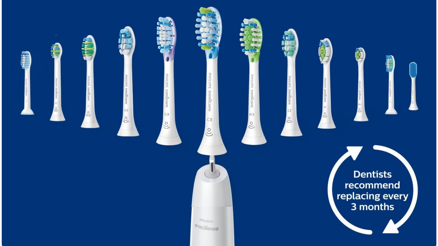
Image: An array of Philips Sonicare click-on brush heads, illustrating their compatibility with the toothbrush handle and the recommendation for 3-month replacement.