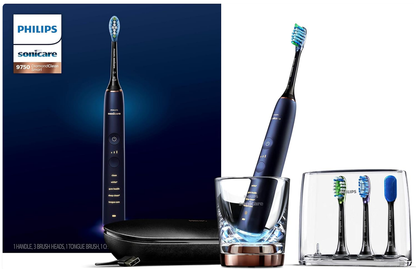
Image: The Philips Sonicare DiamondClean Smart 9750 system, including the toothbrush handle, charging glass, USB travel case, and various brush heads.

The Philips Sonicare DiamondClean Smart 9750 is an advanced rechargeable electric power toothbrush designed to provide comprehensive oral care. This manual offers detailed instructions for setup, operation, maintenance, and troubleshooting to ensure optimal performance and a superior brushing experience.