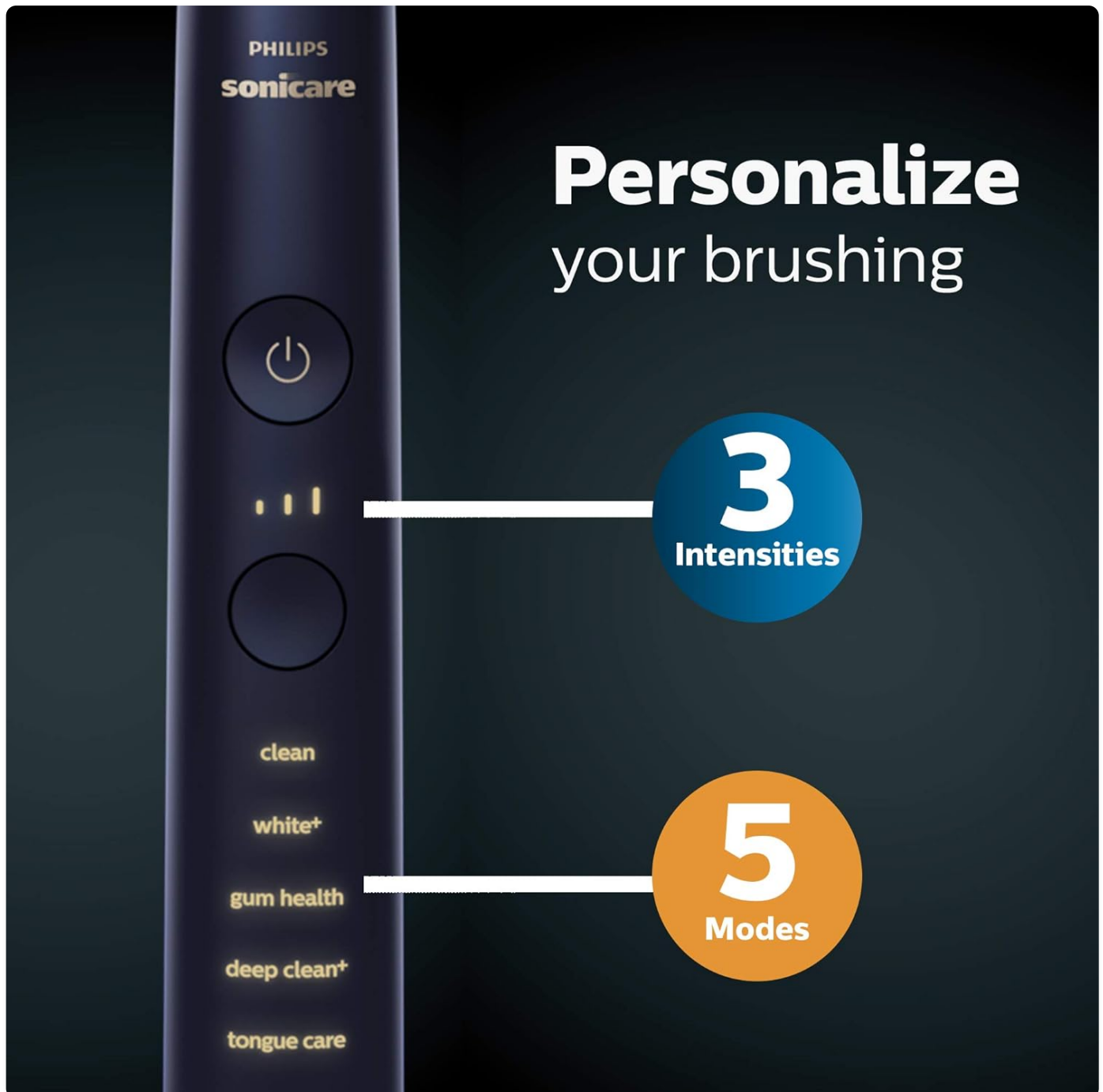
Image: A close-up of the Philips Sonicare DiamondClean Smart 9750 toothbrush handle, illustrating the five distinct brushing modes and three intensity settings for personalized oral care.

Press the mode button to cycle through the available modes. Use the intensity button to select your preferred intensity level (low, medium, high).