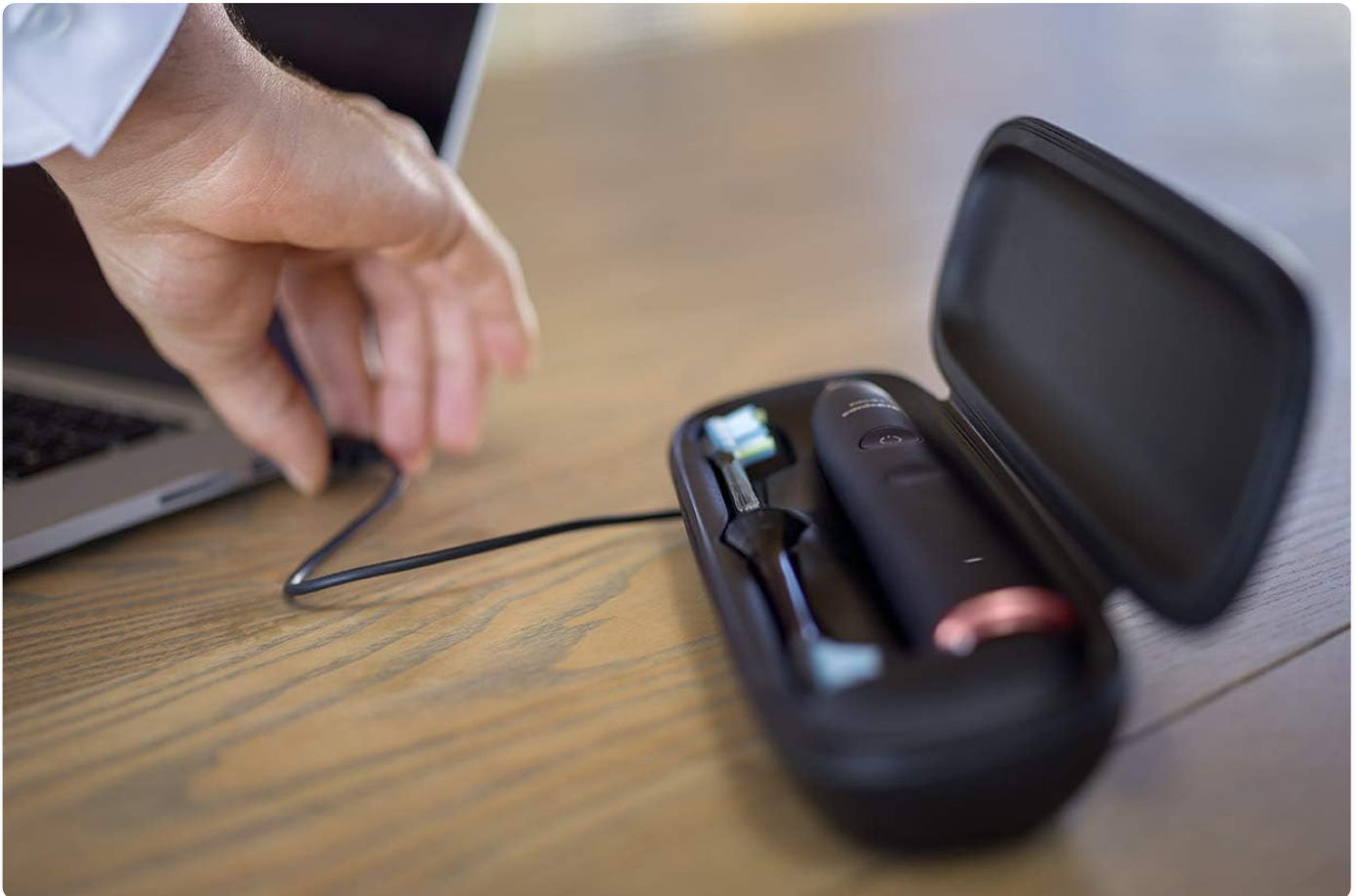
Image: The Philips Sonicare DiamondClean Smart 9750 toothbrush being charged inside its travel case using a USB connection, highlighting its portability.