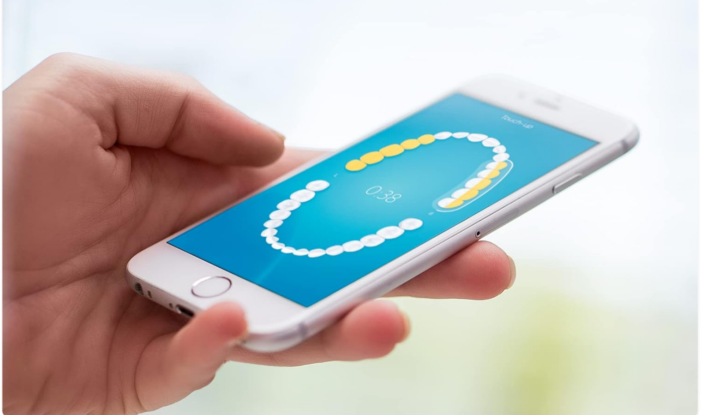
Image: A user's hand holding a smartphone showing the Philips Sonicare app, which provides real-time feedback on brushing technique and coverage.

Your browser does not support the video tag.