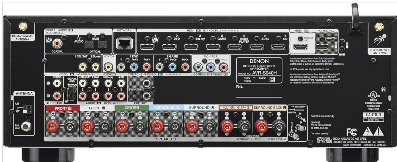
Image: Denon AVR-S940H Rear Panel Connections. This image displays the comprehensive rear panel of the Denon AVR-S940H receiver, detailing all input and output ports for audio, video, network, and speaker connections. Key sections include HDMI inputs/outputs, digital audio inputs (optical, coaxial), analog audio inputs, speaker terminals for 7.2 channels, pre-outs, and antenna connections for Wi-Fi/Bluetooth and FM/AM.