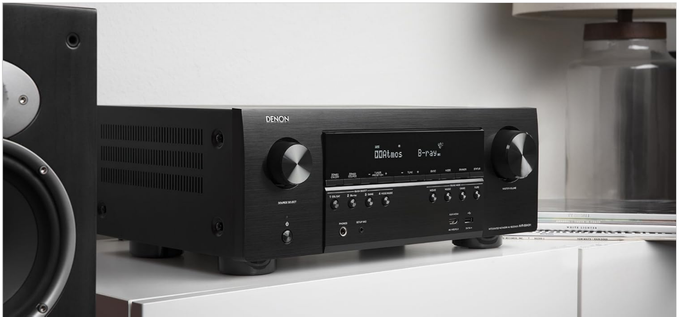
Image: Denon AVR-S940H Front View. This image shows the front panel of the Denon AVR-S940H receiver, featuring the main display, input selector knob, master volume knob, and various control buttons for functions like quick select, zone control, and headphone output.