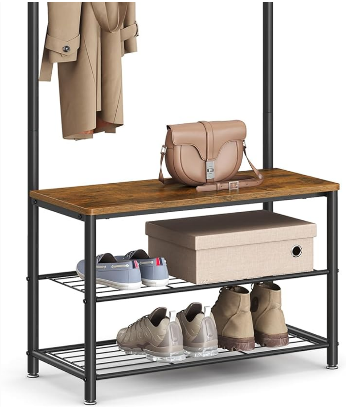
Image: Front view of the VASAGLE 3-in-1 Hall Tree, showcasing its coat hooks, bench, and shoe storage shelves. A hat, coat, bag, and various shoes are organized on the unit.