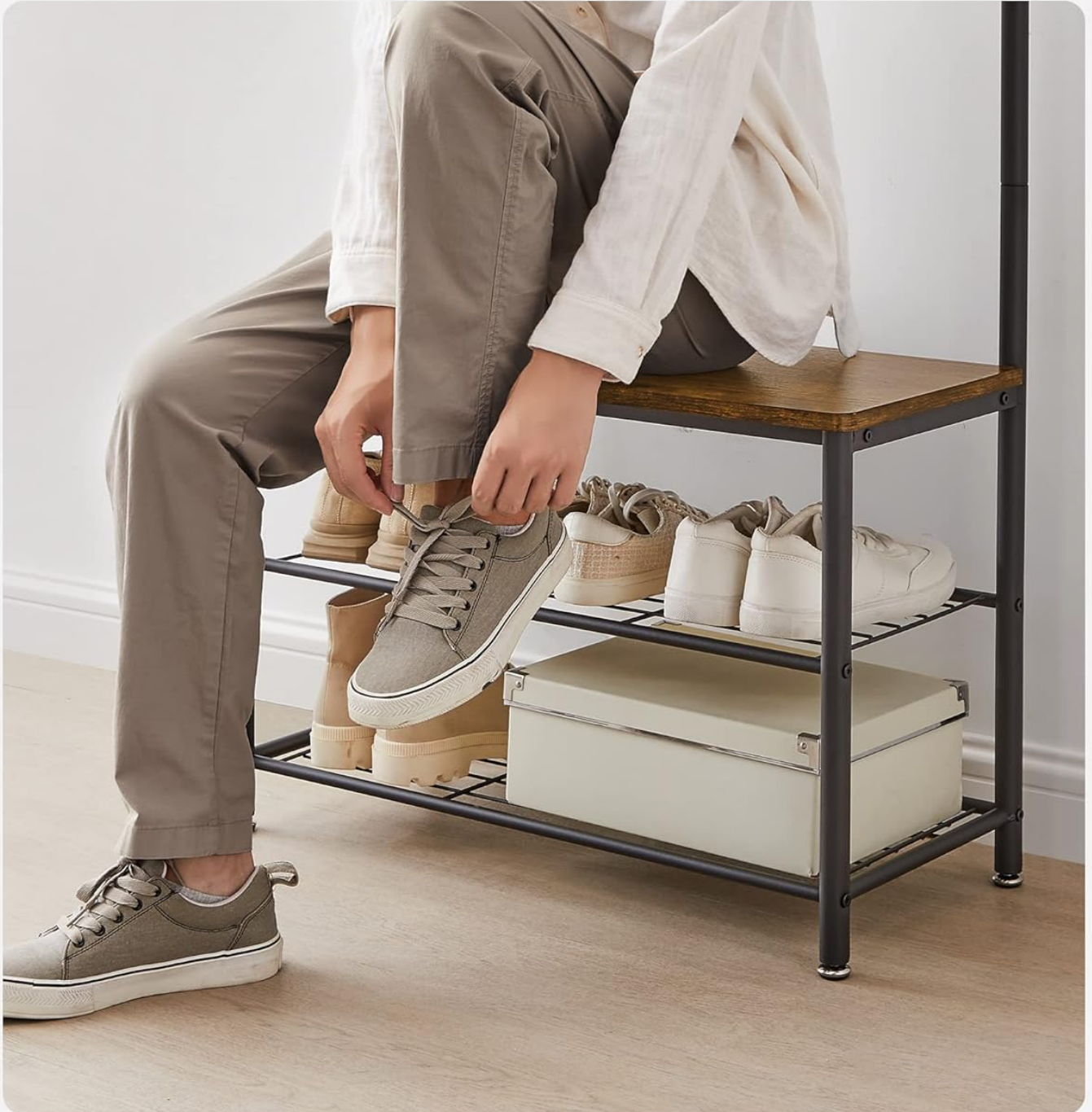
Image: A person is shown sitting on the hall tree's bench, tying their shoes, illustrating the bench's practical use.

Makes it easy for you to change shoes and organize items