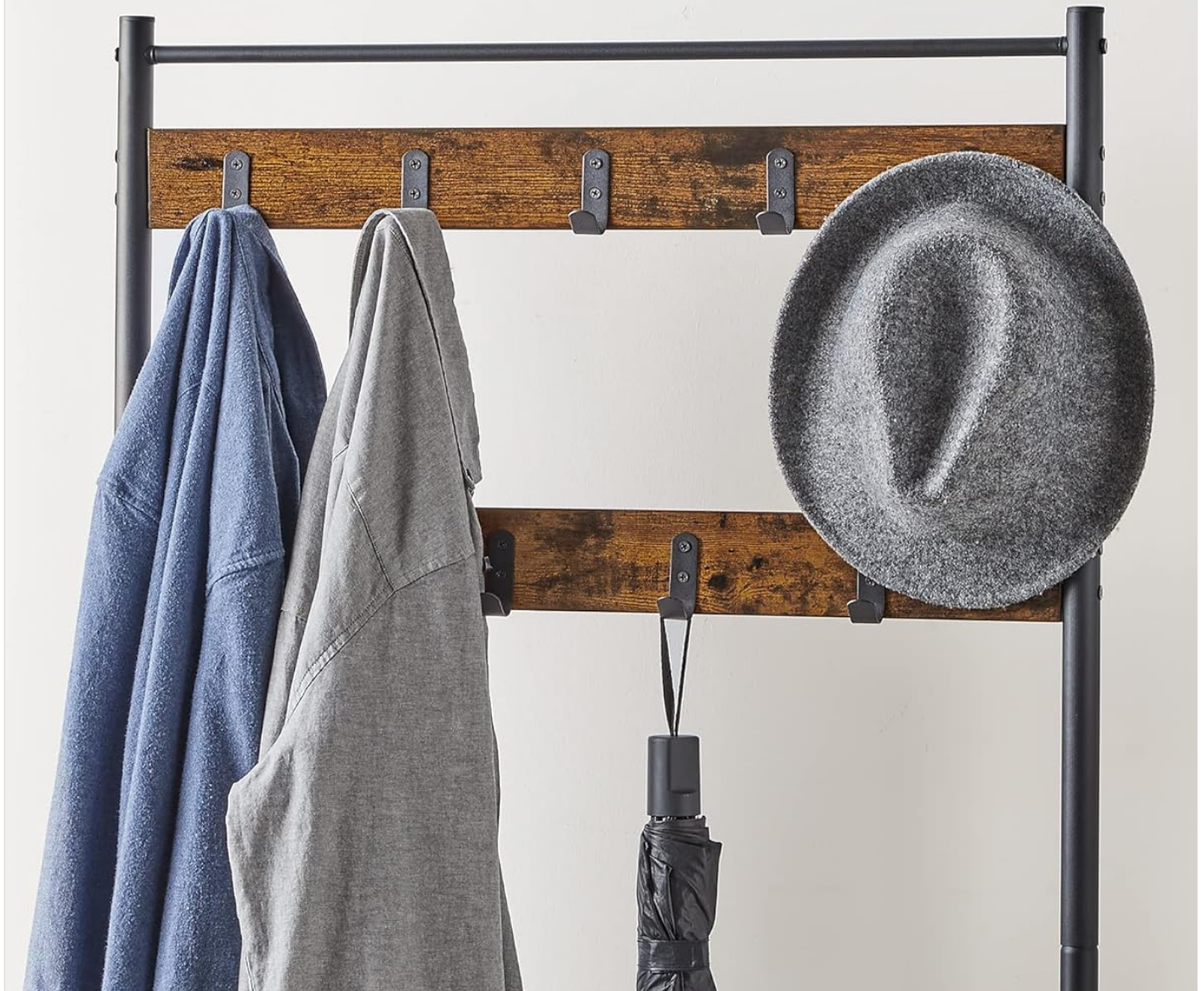
Image: A close-up of the two rows of hooks on the hall tree, with a coat and hat demonstrating their use.