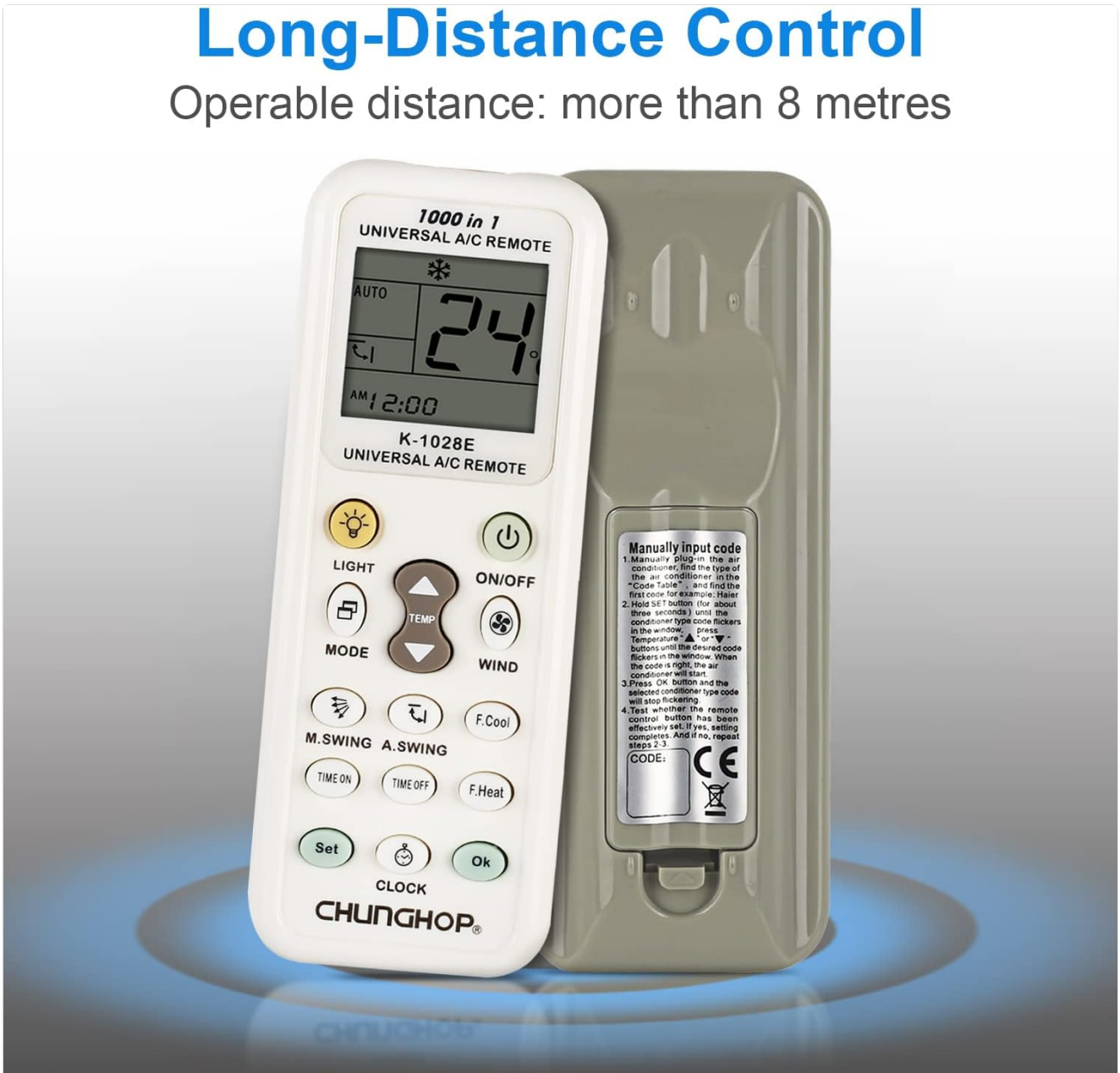
Image: The remote control demonstrating its long-distance operability.