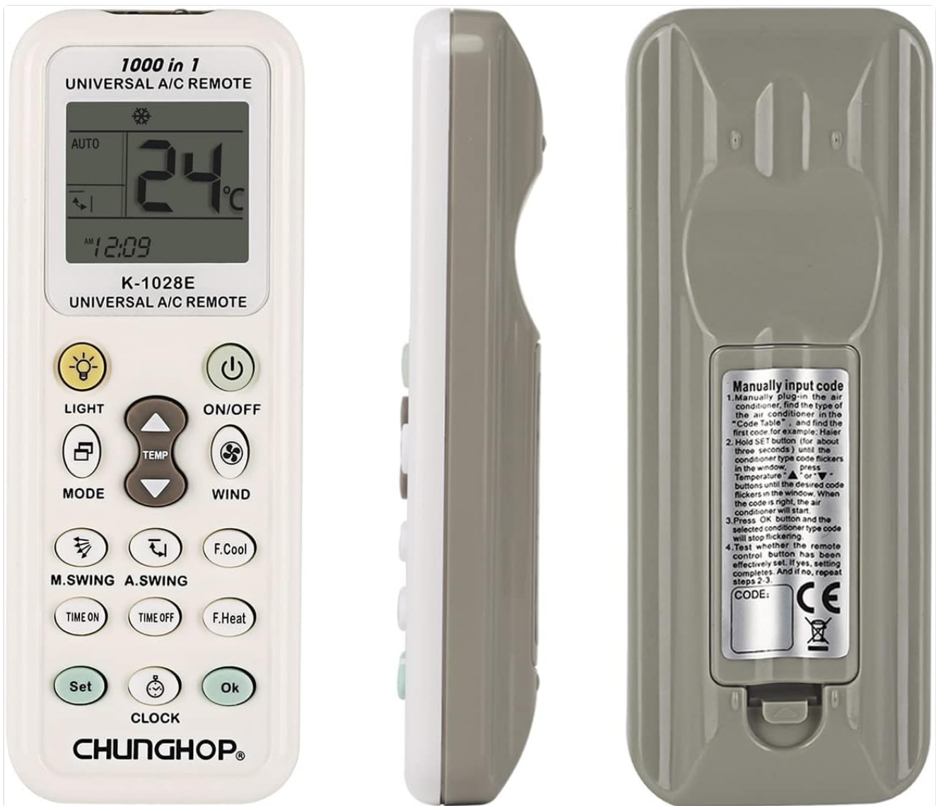
Image: The CHUNGHOP K-1028E Universal A/C Remote Control, showing its front with LCD screen and buttons, a side profile, and the back with the battery compartment and manual input code instructions.