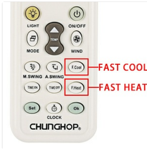
Fast Heat Function