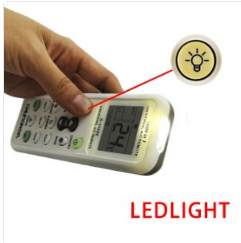
Built-in LED Light