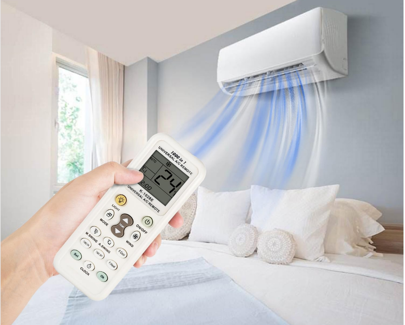
Image: A hand holding the K-1028E remote control, pointing it towards a wall-mounted air conditioner unit, illustrating its universal compatibility with common AC types.

K-1028E is compatible with most of common Wall mounted type, Cabinet type air conditioner brands in the market. Please refer to the applicable brand and code list through figure 3.