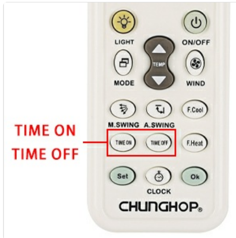
Time On/Off Functions