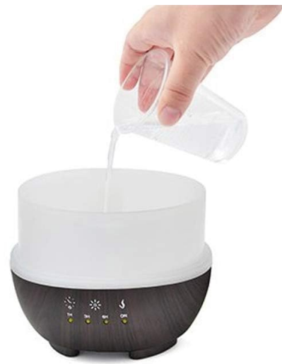
2. Add Clean Fresh Water