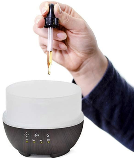
3. Add Favorite Blend of Oils