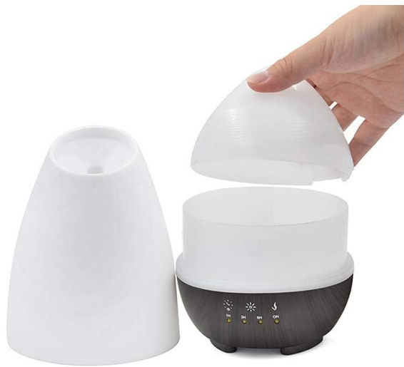
1. Gently Remove Cover