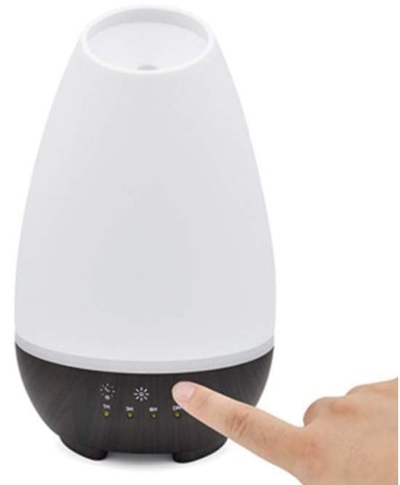
4. Plug In, Turn On, and Enjoy

Image: A visual guide demonstrating the four setup steps: removing the cover, adding water, adding essential oils, and plugging in the unit.