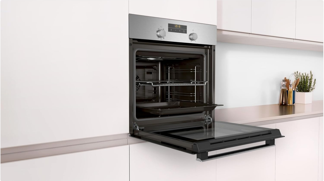
Figure 4: Oven interior showing the professional grill rack and universal tray.

To prevent accidental operation, activate the child lock function. Refer to the display instructions or the specific symbol on the control panel for activation and deactivation.