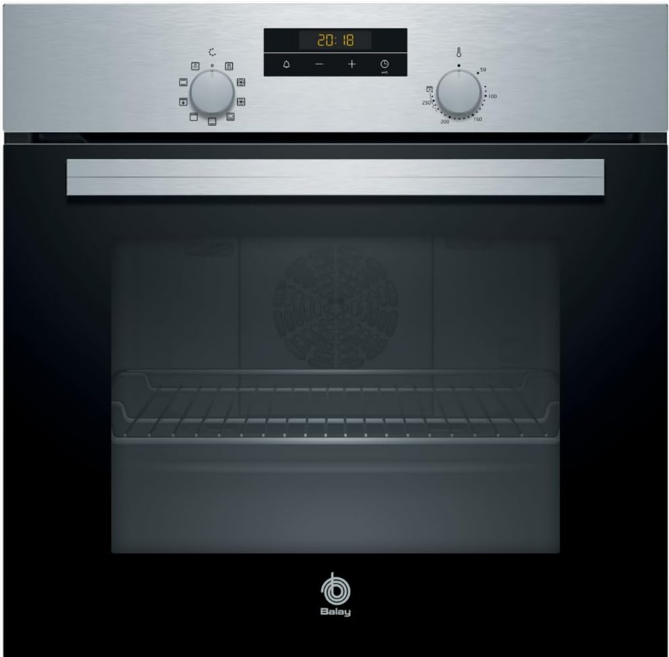
Figure 1: Front view of the Balay Multifunction Oven 3HB2030X0.