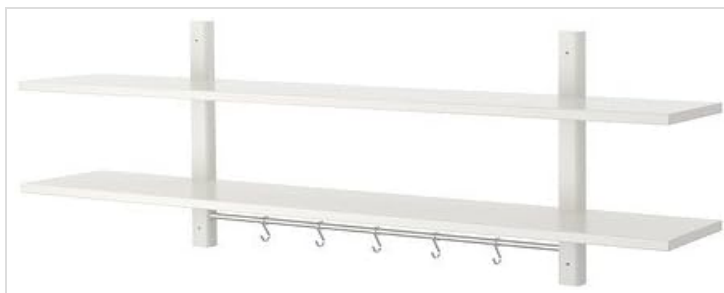
Image: The IKEA Varde Wall Shelf, showing its two white shelves and the stainless steel rail with five hooks positioned below the lower shelf.

This product requires assembly. All necessary hardware for assembly (excluding wall fasteners) is included.