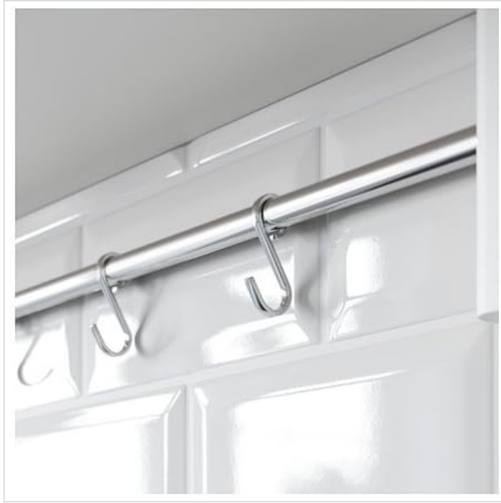
Image: A close-up view of the stainless steel rail and S-hooks, highlighting their design and functionality for hanging items.

Image: The IKEA Varde Wall Shelf installed in a kitchen, holding various kitchenware such as bowls, jars, and mugs, demonstrating its practical use.