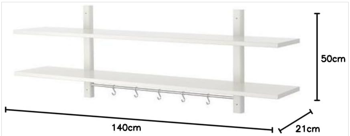
Image: The IKEA Varde Wall Shelf with key dimensions indicated: Width 140 cm, Depth 21 cm, Height 50 cm.