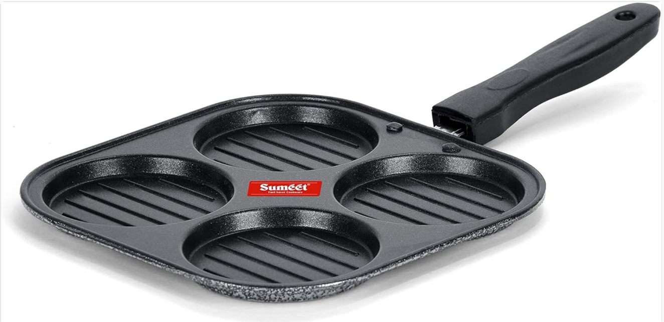
Figure 1: Top-down view of the Sumeet 4-in-1 Nonstick Multi Snack Maker, showing the four circular cooking compartments with grill lines and the attached handle.