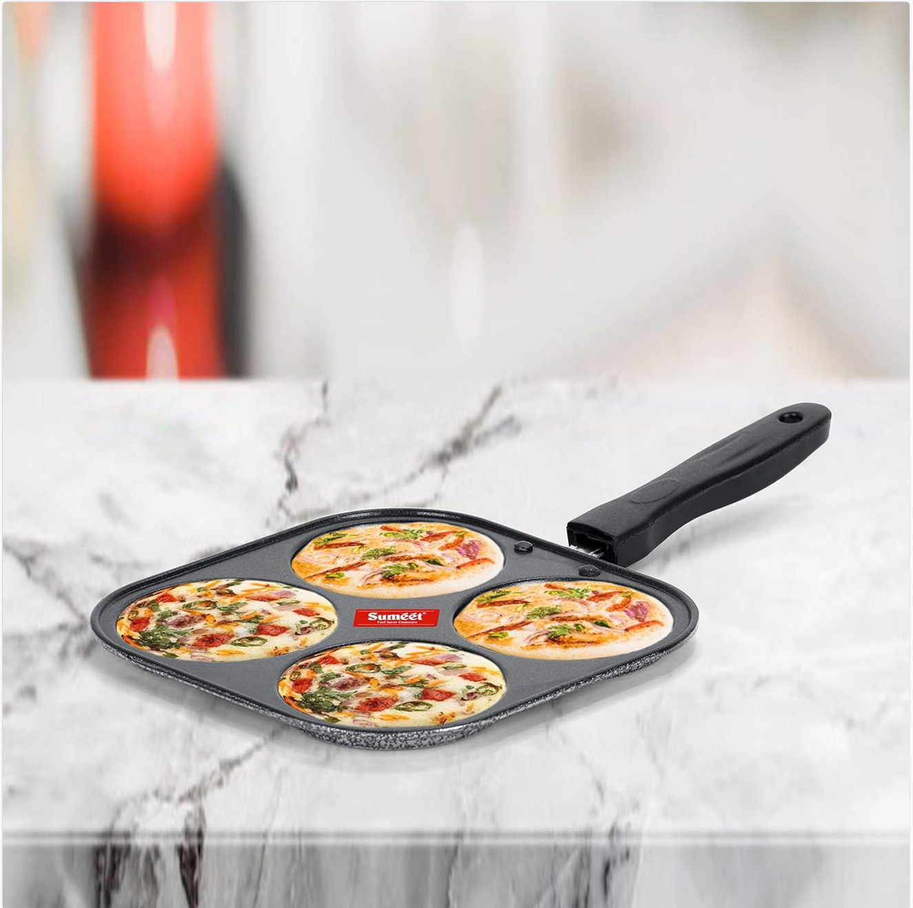
Figure 3: The Sumeet 4-in-1 Nonstick Multi Snack Maker in use, demonstrating four mini pizzas cooking simultaneously in its compartments.