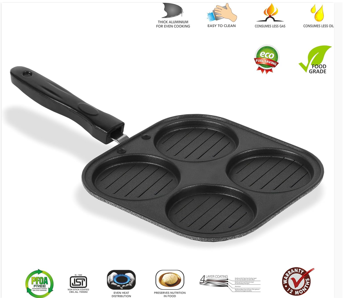
Figure 2: Angled view of the snack maker highlighting key features such as thick aluminum construction, easy cleaning, fuel efficiency, food-grade material, PFDA-free coating, even heat distribution, nutrition preservation, and 4-layer nonstick coating with a 12-month warranty.