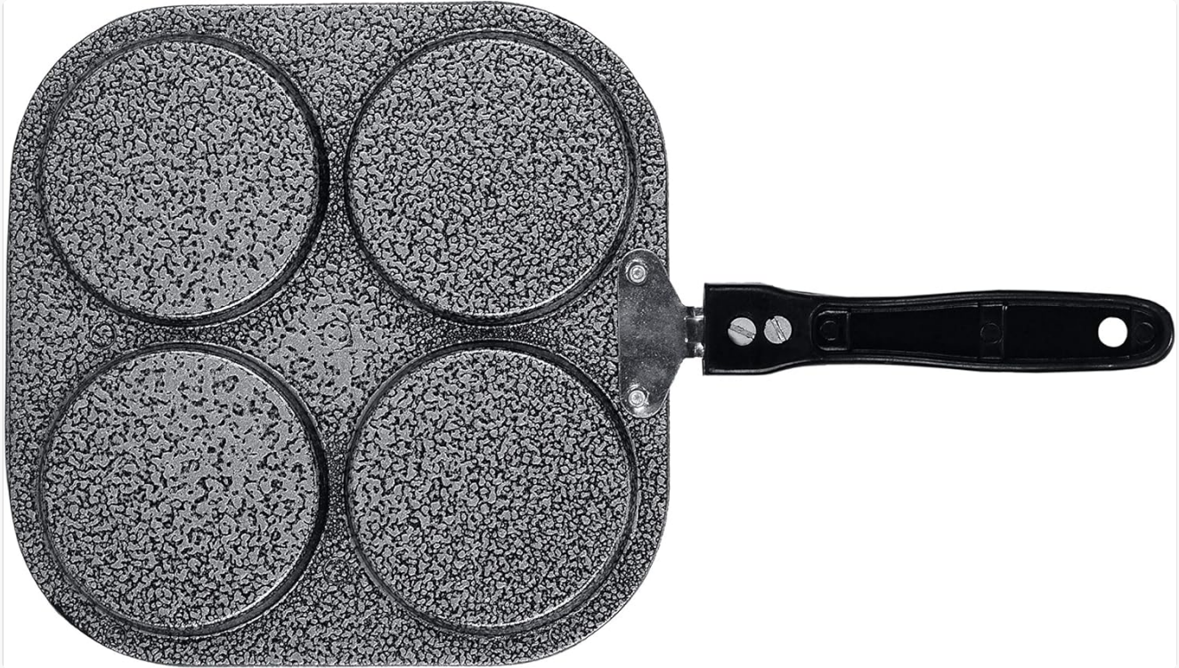
Figure 5: Bottom view of the Sumeet 4-in-1 Nonstick Multi Snack Maker, showing the textured base designed for even heat distribution and the attachment point for the handle.