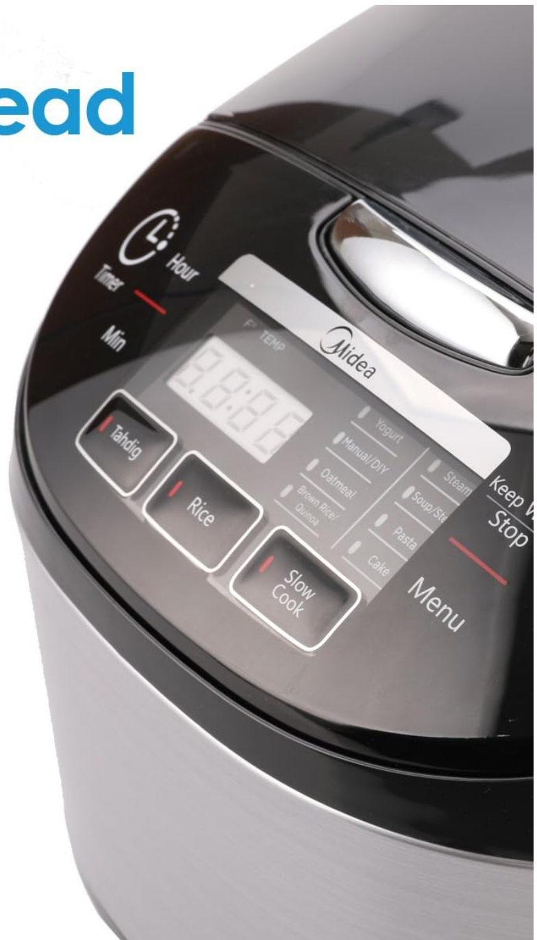
Figure 2.3.3: Close-up of the easy-to-read LED Digital Panel, highlighting the touch buttons for various functions and the 24-hour preset timer.