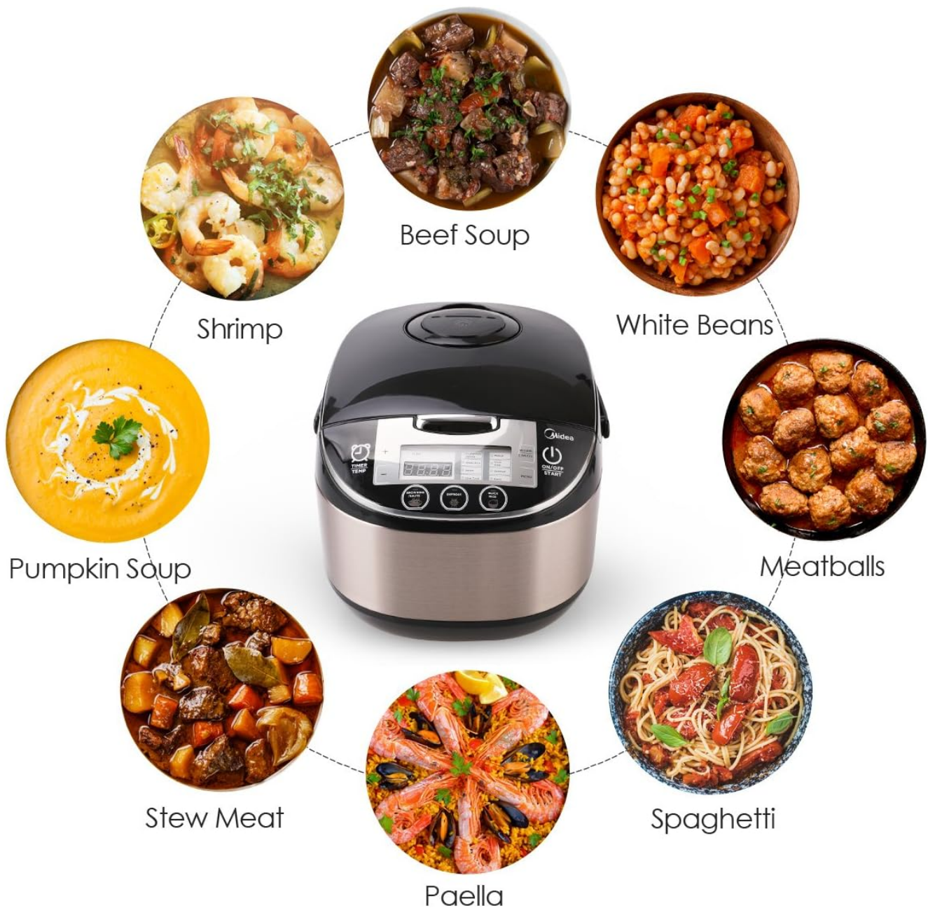
Figure 2.3.6: Visual representation of the diverse dishes that can be prepared using the multi-function rice cooker, such as Beef Soup, Shrimp, White Beans, Meatballs, Spaghetti, Paella, Stew Meat, Pumpkin Soup.