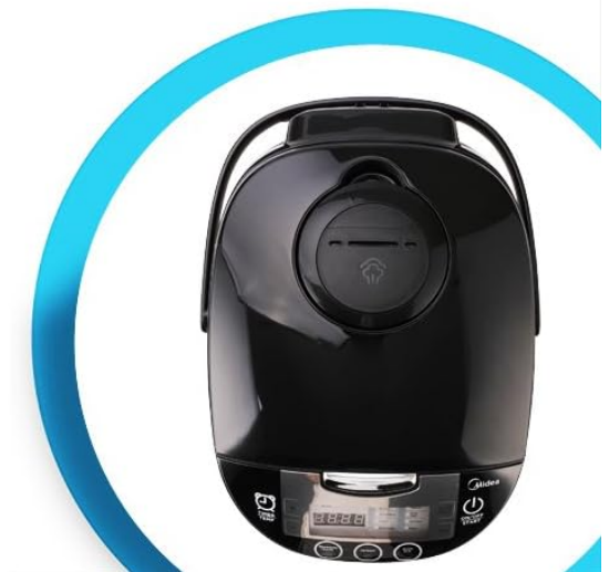
Figure 2.3.5: Illustration demonstrating the capacity of the rice cooker, capable of producing up to 12 cups of cooked rice from 10 cups of uncooked rice.