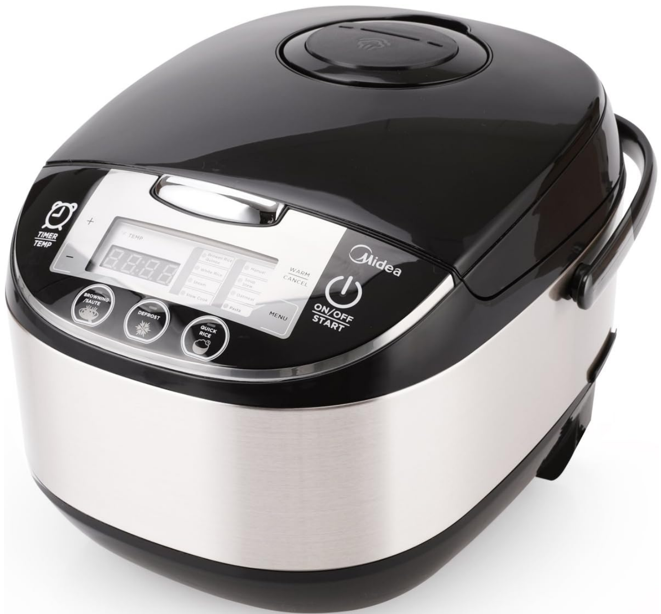
Figure 2.3.1: Front view of the Midea Multi-Function Rice Cooker, showcasing its sleek design and digital control panel.