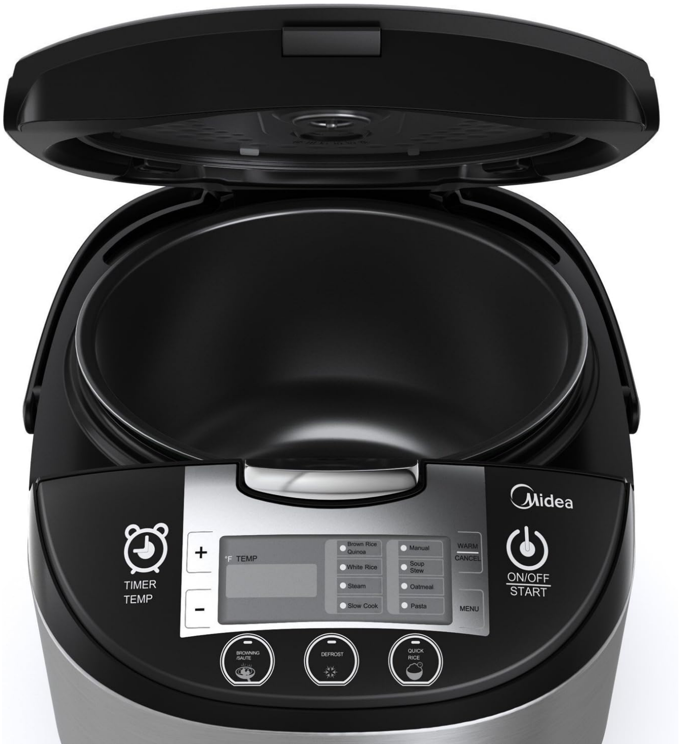
Figure 2.3.2: Interior view of the rice cooker with the lid open, showing the non-stick inner pot and the removable upper lid.