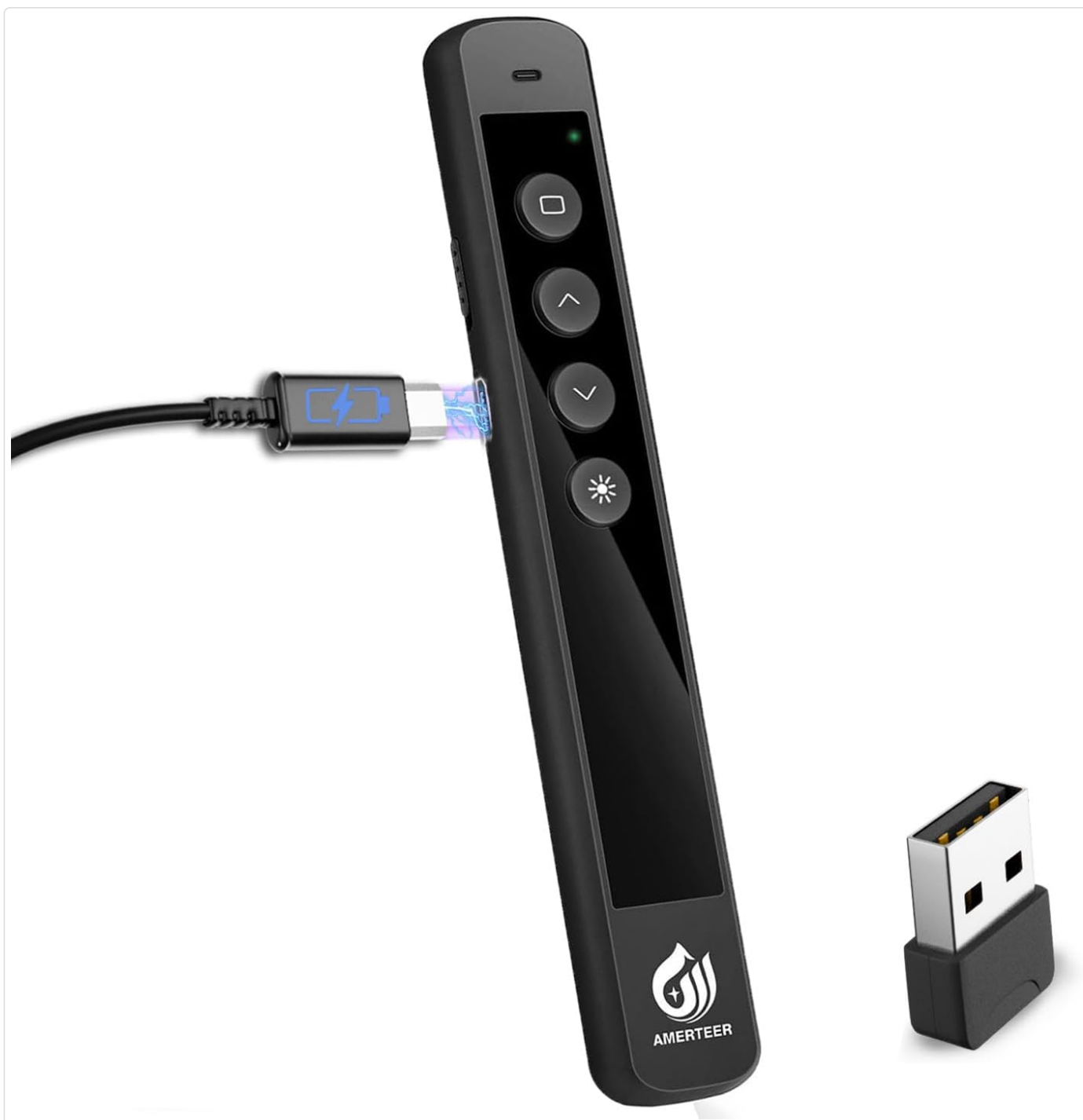
Image: The AMERTEER Wireless Presenter Remote shown alongside its mini USB receiver, ready for connection to a computer, demonstrating its compact design and plug-and-play readiness.