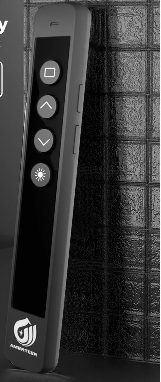
Image: The presenter remote illustrating the volume control buttons on the side and the hyperlink activation button on the front.