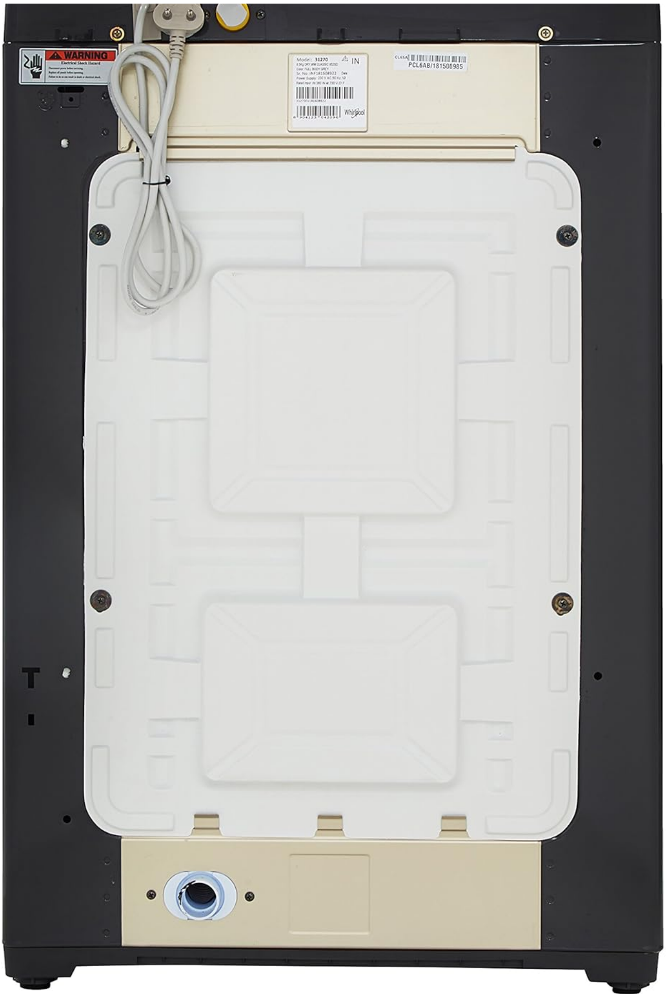
The back of the washing machine, displaying the power cord, water inlet, and drain hose connections.