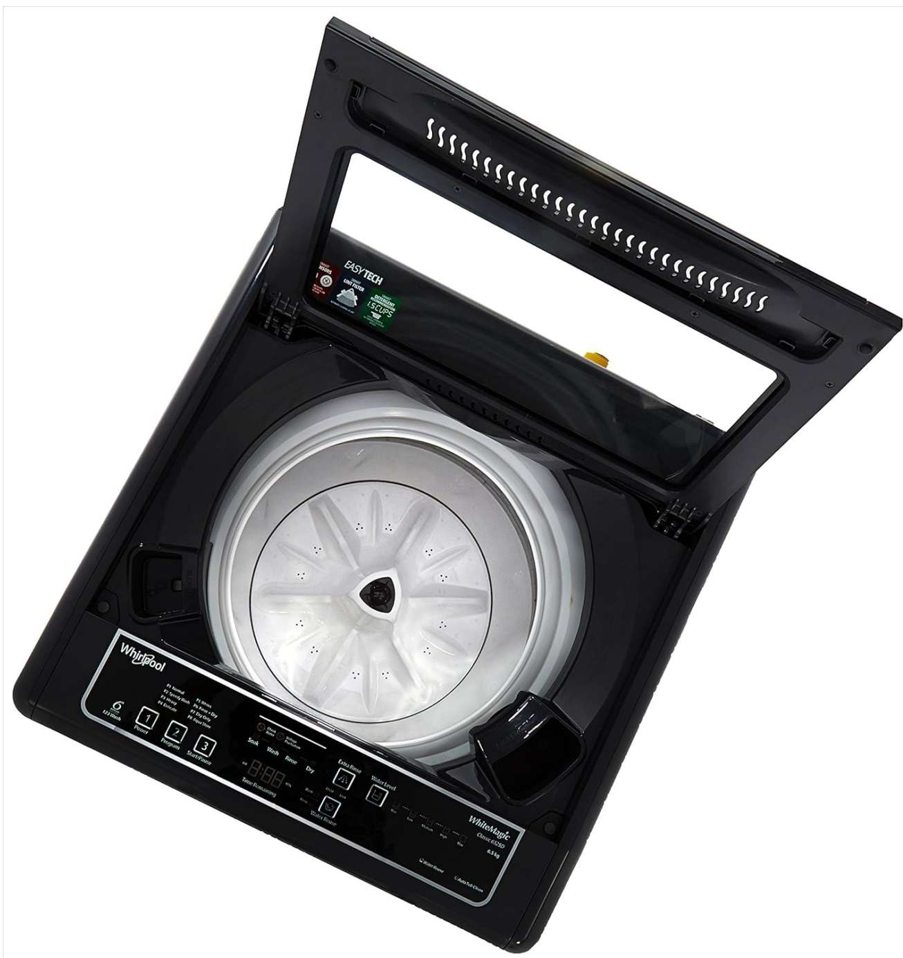
A top-down view of the washing machine with the lid open, revealing the stainless steel Spa Drum and the agitator inside, along with the control panel.