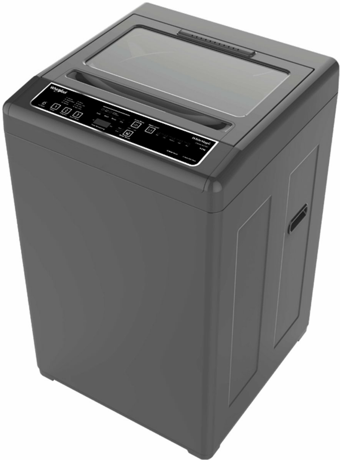
This image displays the Whirlpool Whitemagic Classic 652 SD fully-automatic top-loading washing machine in grey, showing its overall design and the control panel on top.