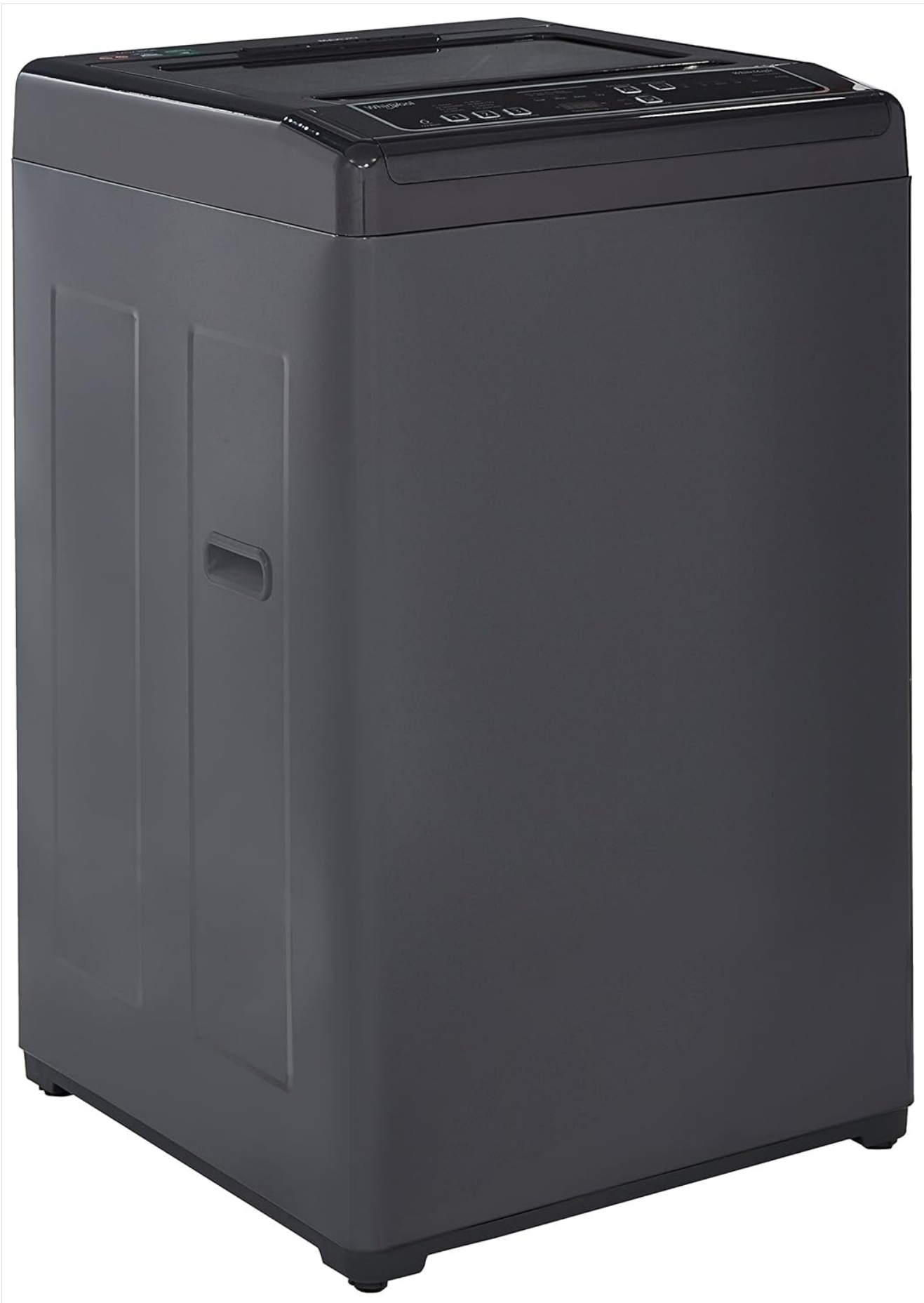
A side view of the washing machine, illustrating its compact design and grey finish.