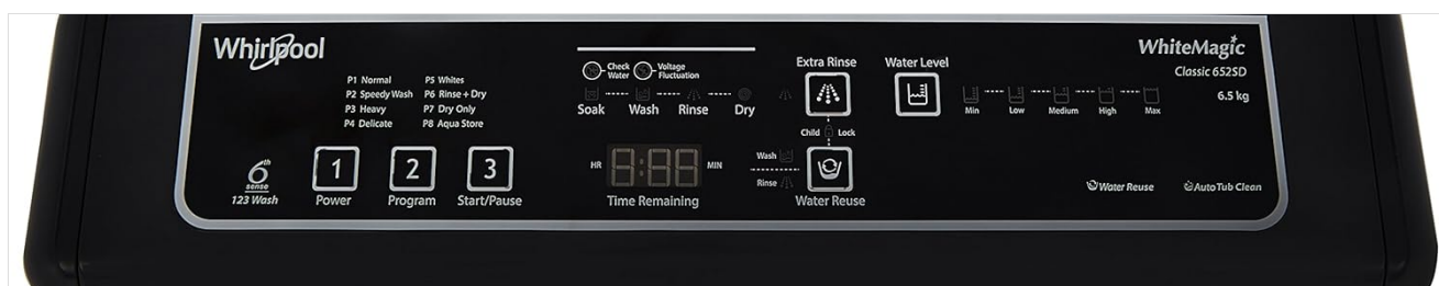
This image provides a detailed view of the washing machine's control panel, highlighting the '6th Sense 1-2-3 Wash' buttons, various wash programs (P1-P8), water level settings, and special features like Child Lock and Auto Tub Clean.