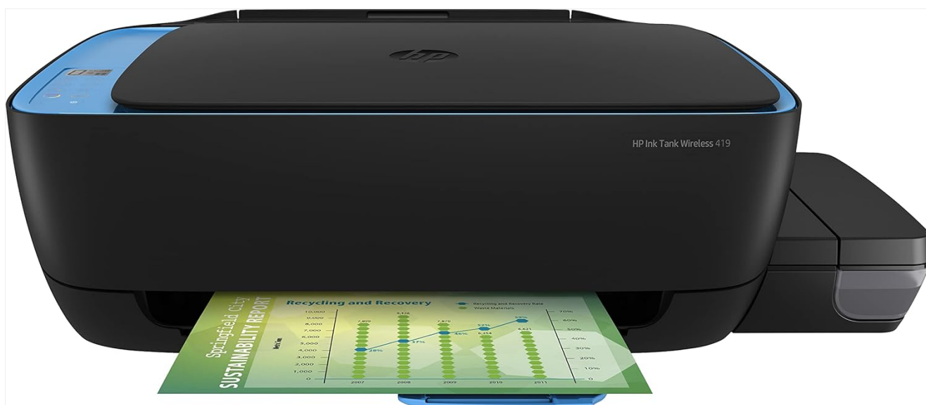
Image: The HP Ink Tank Wireless 419 printer in operation, with a document being printed and exiting the output tray.