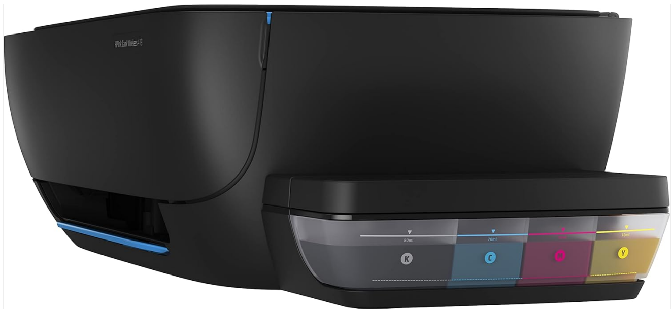
Image: Side view of the HP Ink Tank Wireless 419 printer, highlighting the transparent ink tanks for black, cyan, magenta, and yellow ink.