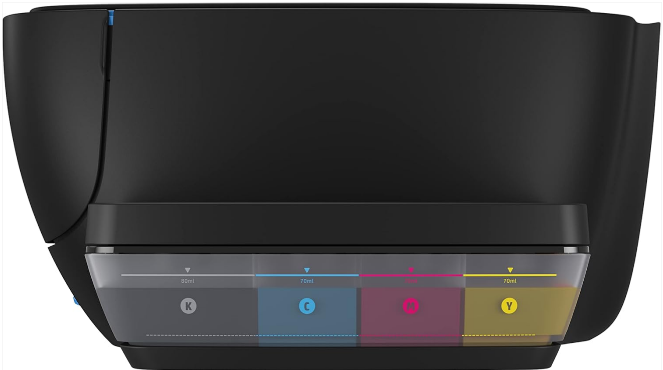
Image: Rear view of the HP Ink Tank Wireless 419 printer, showing the USB port for direct computer connection.

For a direct connection to your computer, use a USB cable.