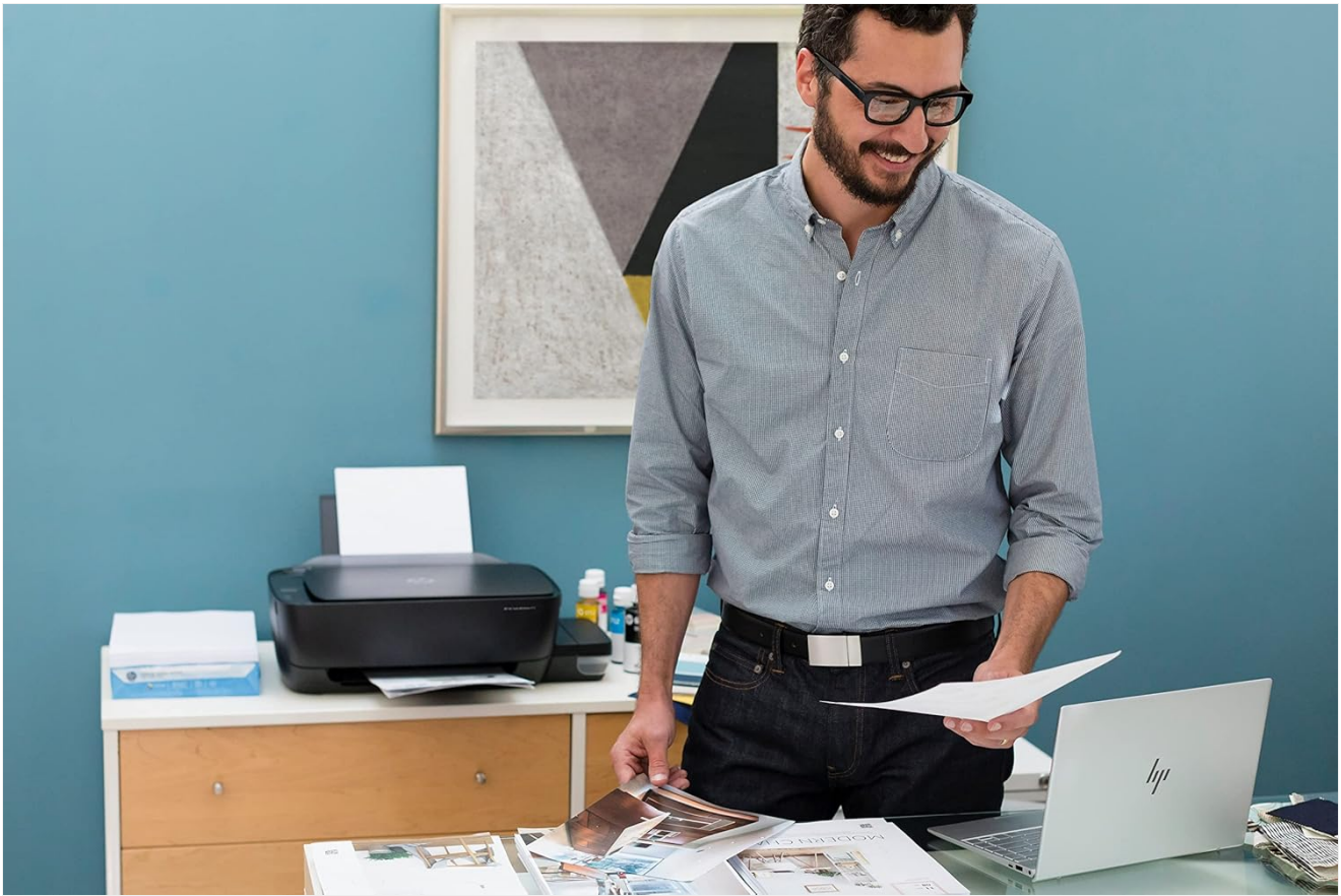
Image: A man in an office setting, with text indicating steps to claim a free 1-year extended warranty for HP printers. This image is relevant for warranty information.