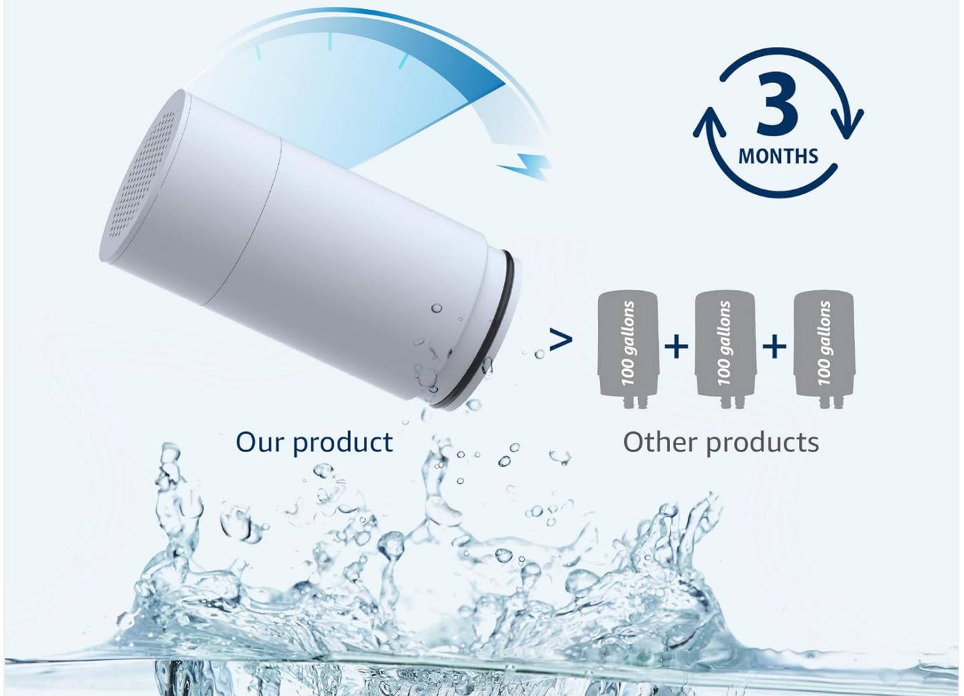
Image: 3x Longer Filter Life, demonstrating the filter's capacity of 320 gallons, equivalent to 2,000 bottled water bottles.

Filters 320 gallons of water. Equivalent to 2,000 bottled water.