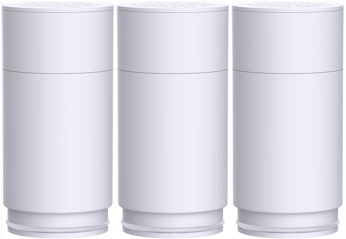
Image: Three Waterdrop Ultra Filtration Faucet System Replacement Filters.