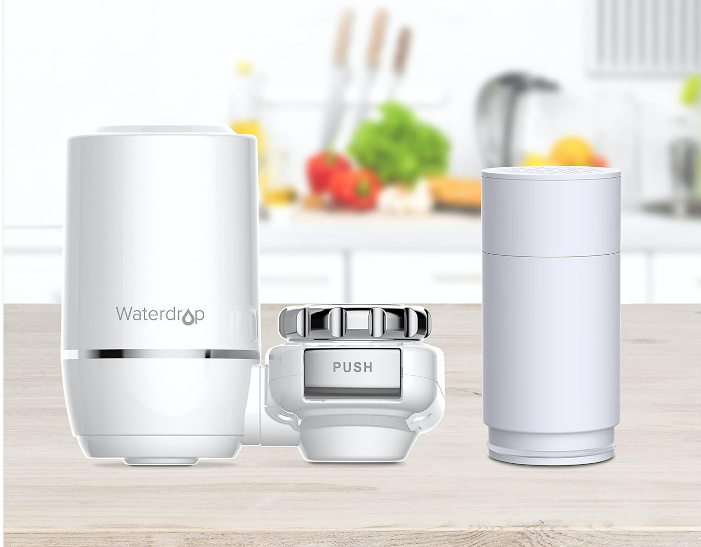
Image: The replacement filter shown next to a compatible Waterdrop Faucet Water Filtration System (WD-FC-02).