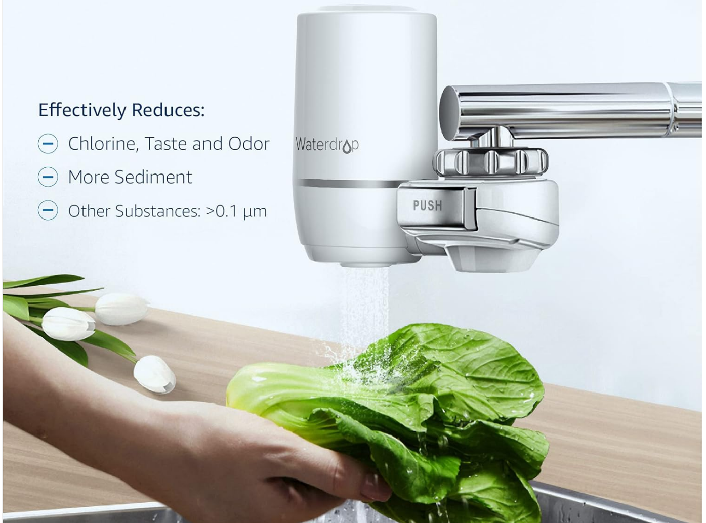
Image: The Waterdrop Faucet Filter System delivering clean water for washing produce.