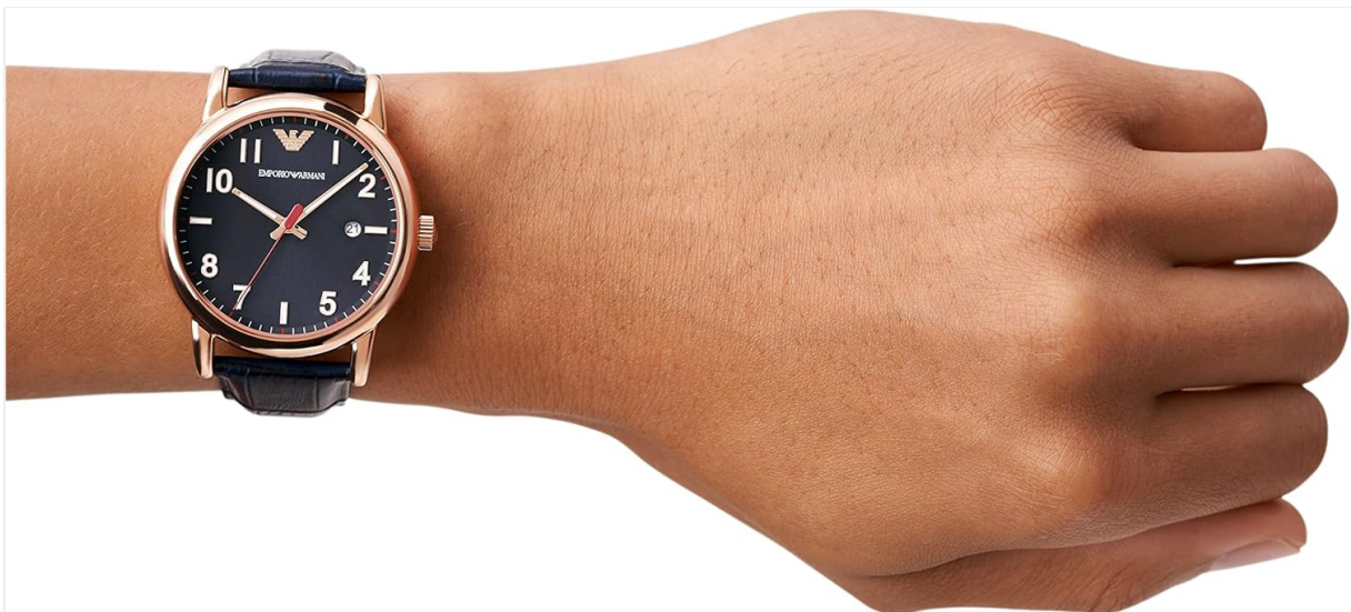
Image 3.1: The Emporio Armani AR11135 watch displayed on a wrist, illustrating its fit and appearance.

For optimal comfort and to prevent excessive wear on the leather band, ensure the watch fits snugly but not too tightly on your wrist. Avoid exposing the watch to extreme temperatures, direct sunlight for prolonged periods, or harsh chemicals.