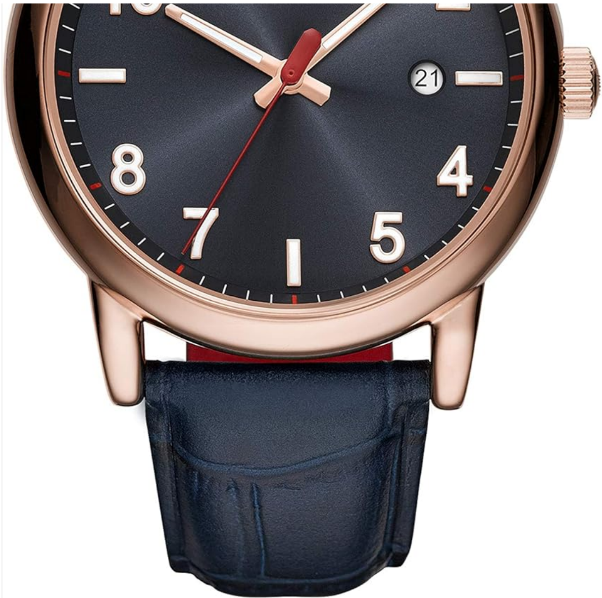
Image 1.1: Front view of the Emporio Armani AR11135 Quartz Watch, showcasing the rose gold case, navy dial, and leather band.