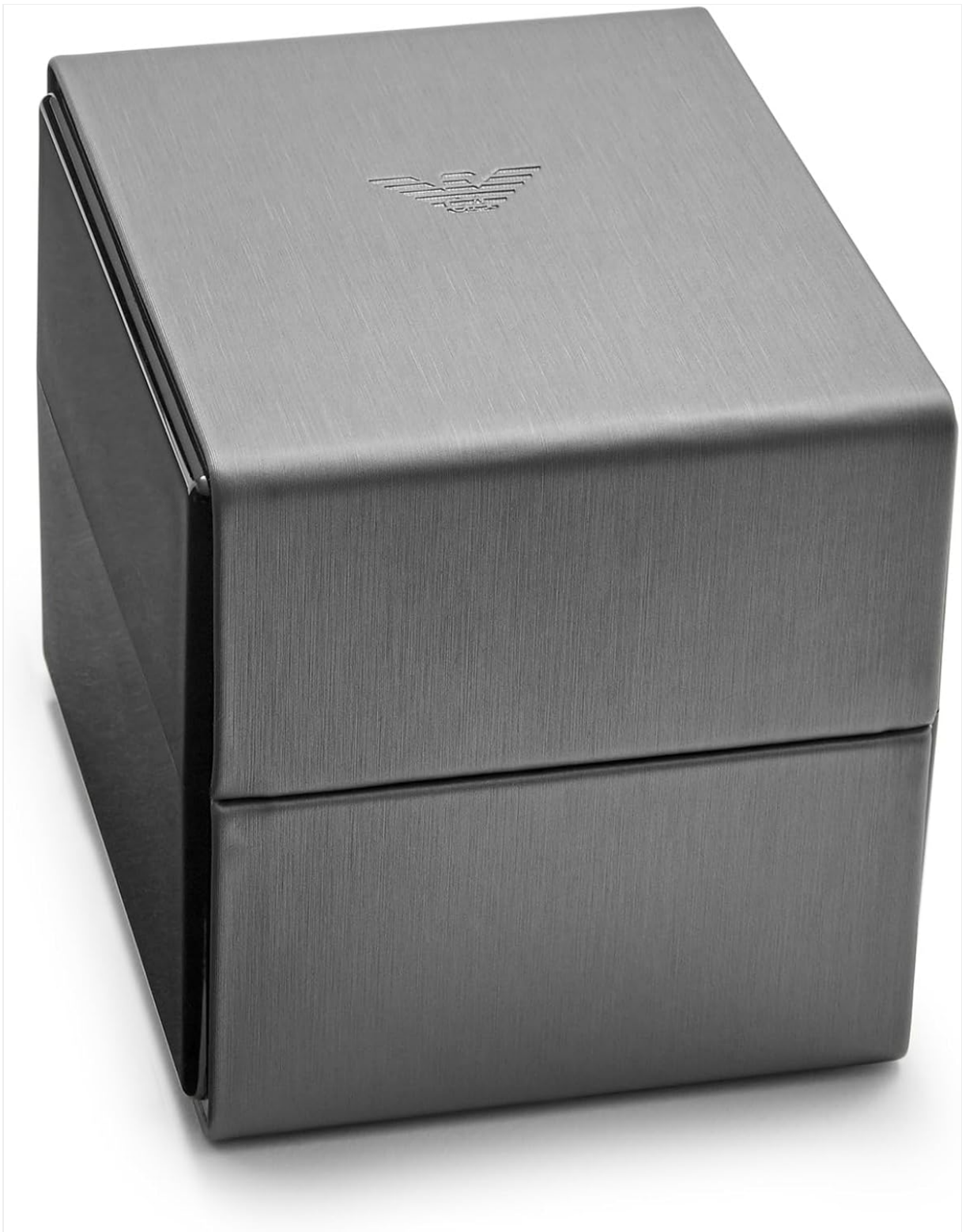
Image 4.1: The Emporio Armani watch box, suitable for safe storage.