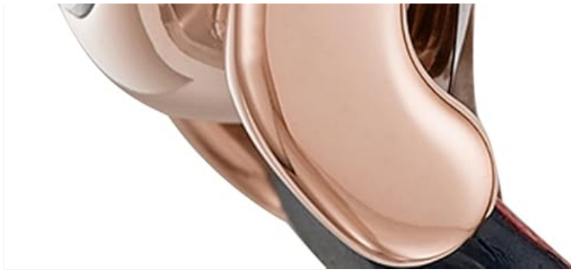
Image 2.1: Side view of the watch, highlighting the crown used for setting time and date.