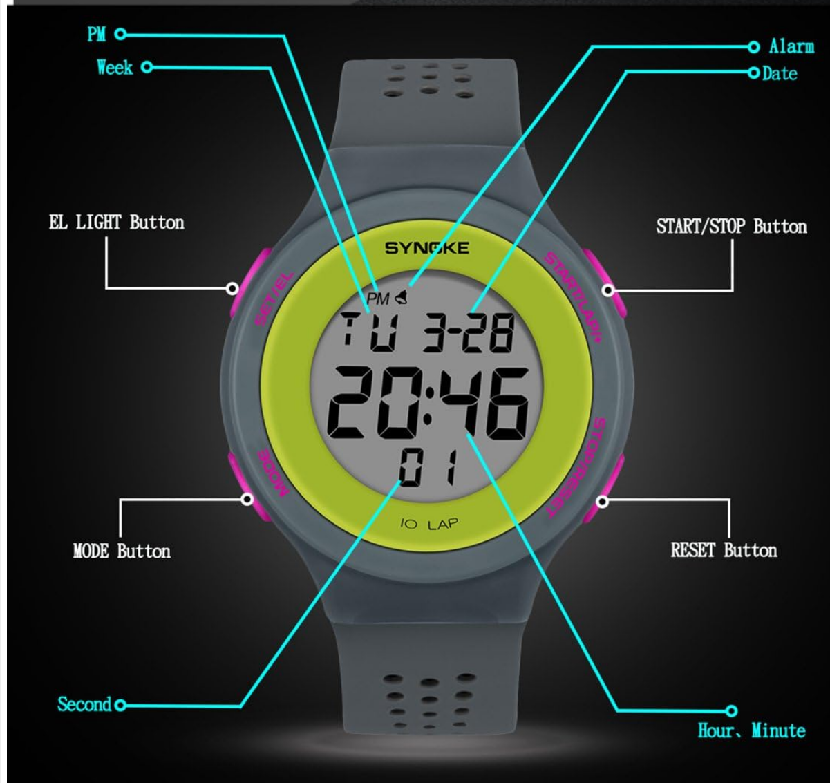
Image Description: This image displays the SYNOKE Digital Sport Watch with its various buttons and display segments clearly labeled. The labels indicate the 'EL Light Button' (top left), 'MODE Button' (bottom left), 'RESET Button' (bottom right), and 'START/STOP Button' (top right). The digital display shows time, date, and day, with indicators for 'PM', 'Week', 'Alarm', and 'Date'.