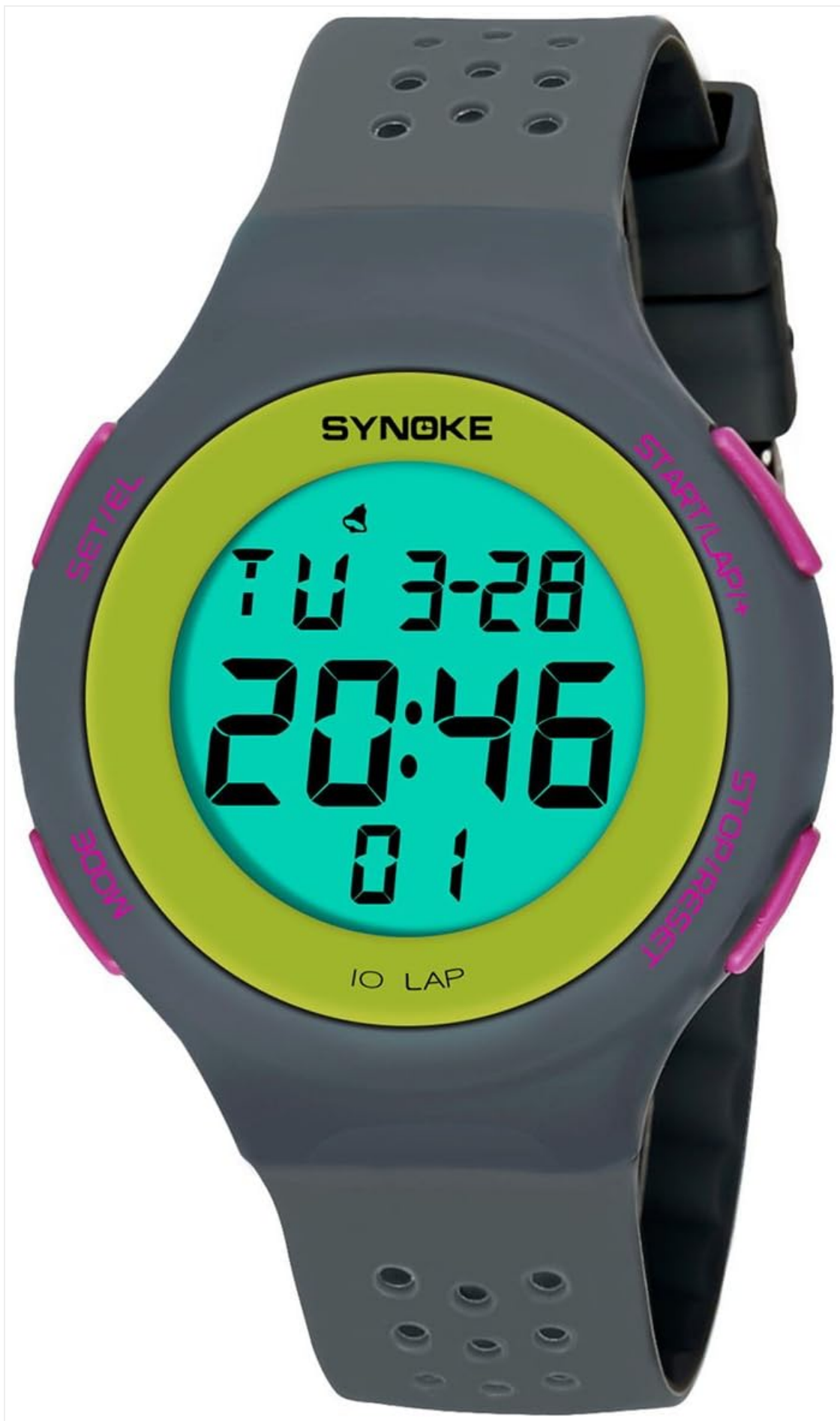
Image Description: This image shows the SYNOKE Digital Sport Watch with its display illuminated by a green backlight, making the time and date clearly visible in low light.