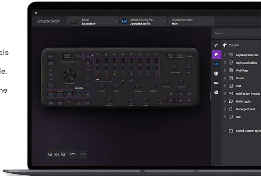
Figure 5: Loupedeck software interface for customization.

Explore new plugins in the Loupedeck Marketplace.