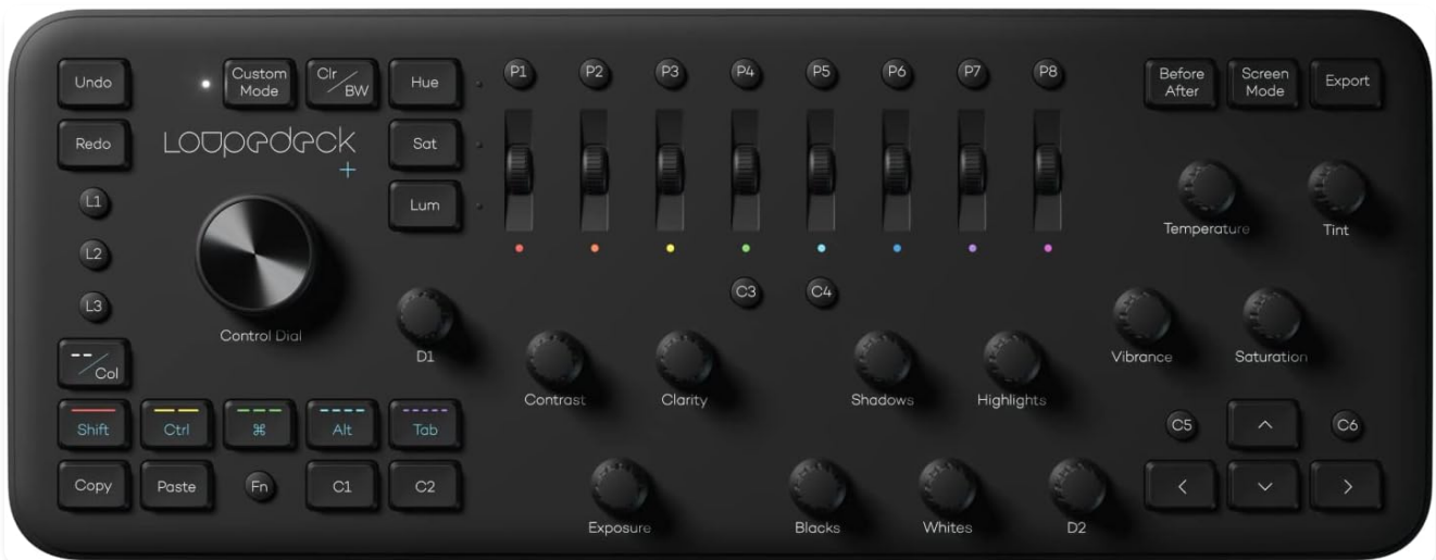
Figure 1: Top view of the Loupedeck+ console.

The Loupedeck+ is a versatile editing console designed to streamline photo and video editing workflows. It offers tactile control over various software functions, enhancing precision and efficiency for both professional and amateur creators. This manual provides essential information to help you get started and make the most of your Loupedeck+ device.