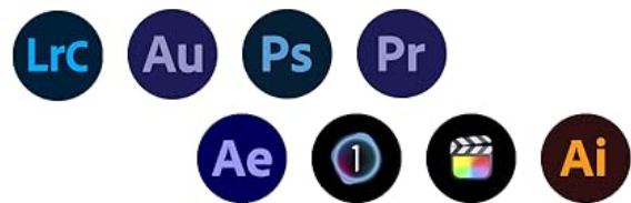
Figure 4: Loupedeck+ compatibility with various software applications.

Loupedeck+ integrates seamlessly with leading creative software such as Adobe Lightroom Classic, Photoshop, Premiere Pro, Final Cut Pro, Capture One Pro, and more, offering time-saving features that make editing faster and easier.