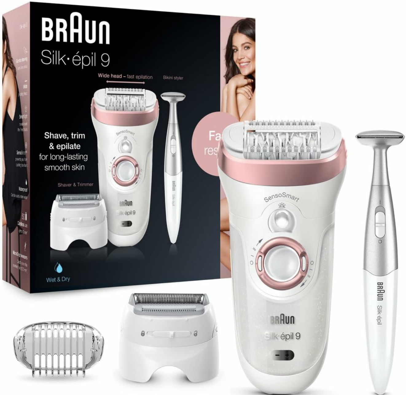
Image: Braun Silk-épil 9 9-890 Epilator device.