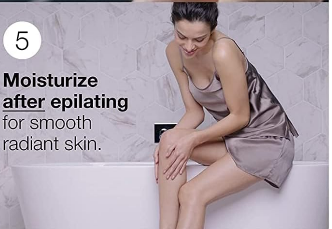
Image: Visual guide demonstrating the five steps for effective epilation: exfoliate, use wet, hold at 90-degree angle, slow movement, and moisturize.

Moisturize after epiling for smooth radiant skin.