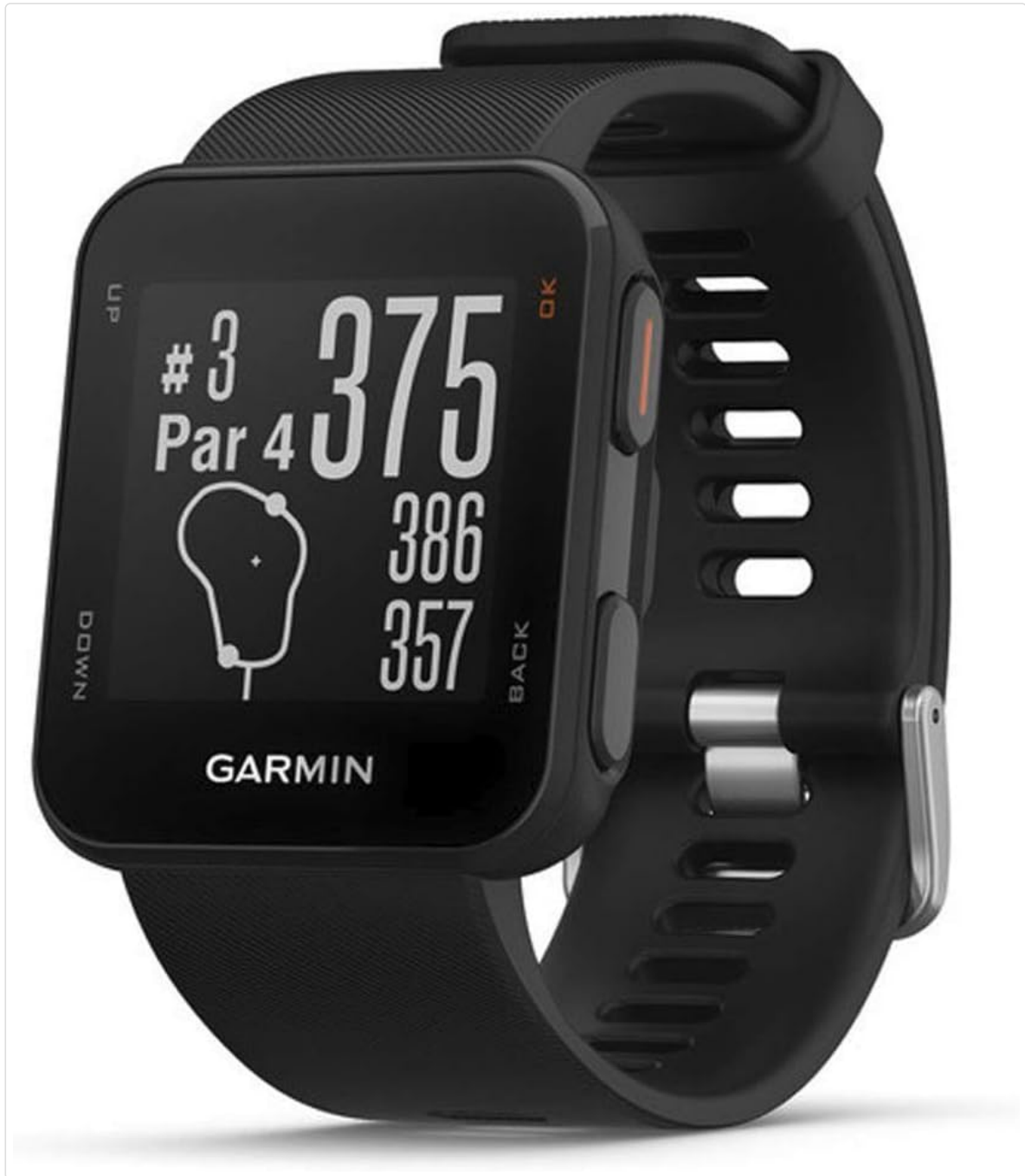
The Garmin Approach S10 watch showing hole number 3, par 4, with distances to the front, middle, and back of the green. The display is clear and easy to read.