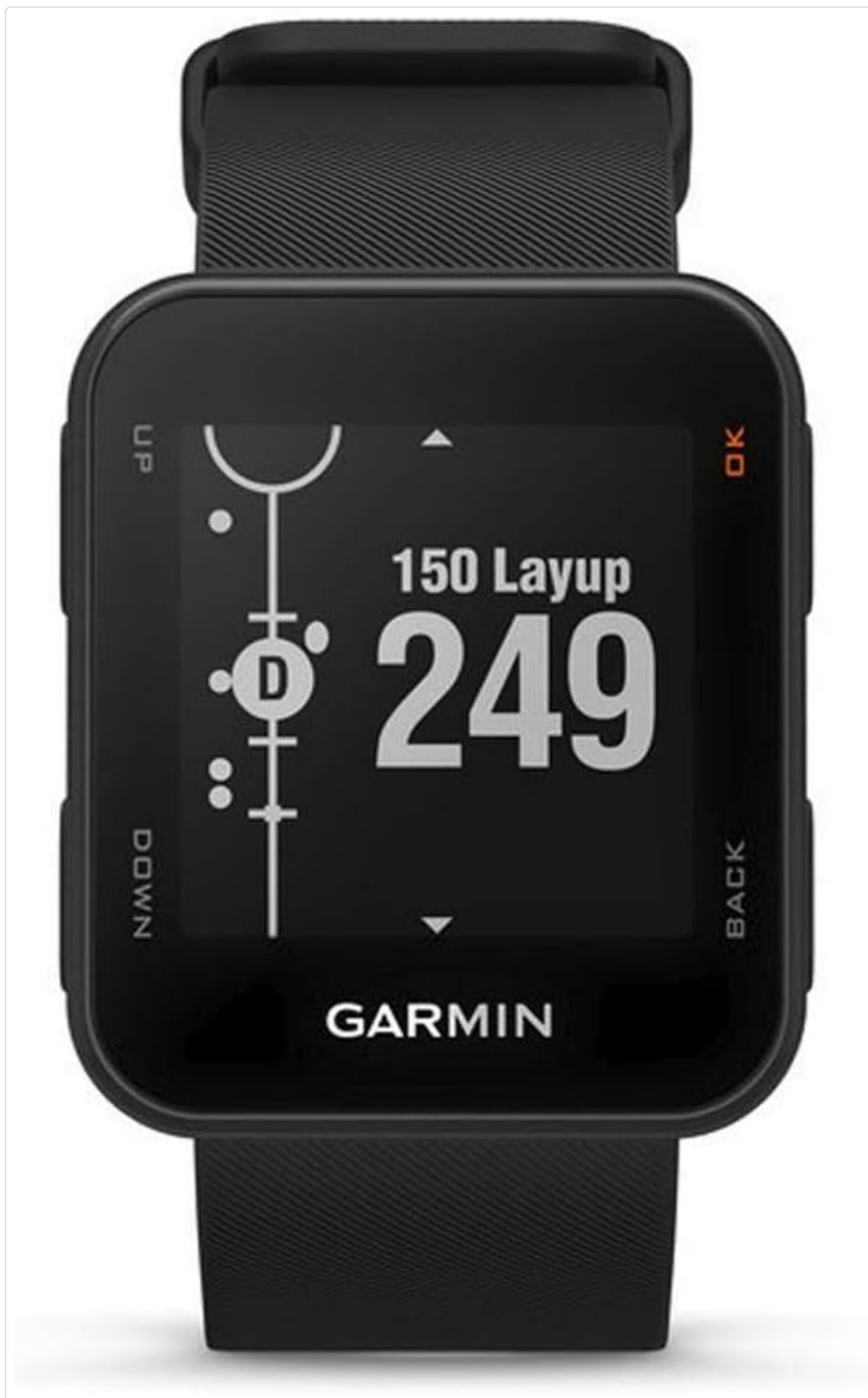
The Garmin Approach S10 watch displaying a 150-yard layup distance to a specific point on the course, with the total distance to the green also visible.