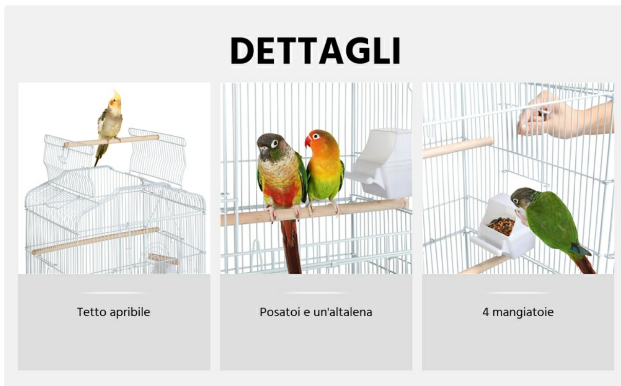
Image 6.1: Features highlighting solid structure, easy cleaning, and adequate bar spacing.