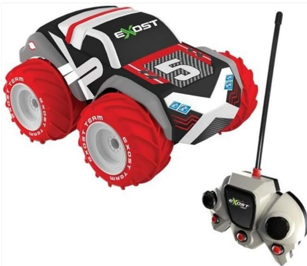
Image 1: The Exost Aqua Typhoon remote control car, black and red, shown with its accompanying remote control unit.

The Exost Aqua Typhoon is a 1:24 scale remote-controlled vehicle designed for all-terrain use. Its robust construction allows it to operate on various surfaces, including snow, dirt, and water puddles. This model features a unique wheelie function for dynamic play. This manual provides essential information for the safe and proper operation, maintenance, and care of your Exost Aqua Typhoon.