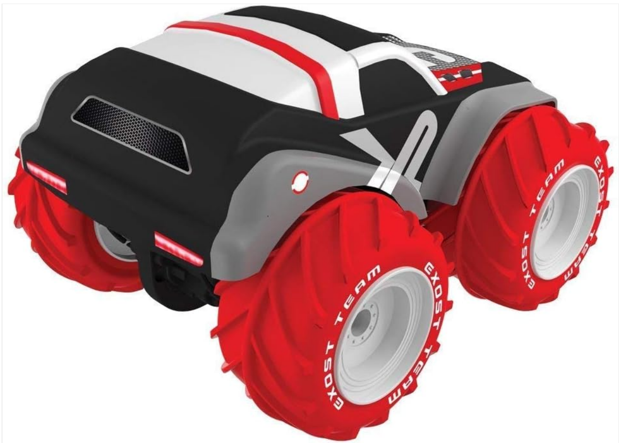
Image 2: Rear view of the Exost Aqua Typhoon, highlighting the robust wheels and chassis design. The battery compartment is typically located on the underside.