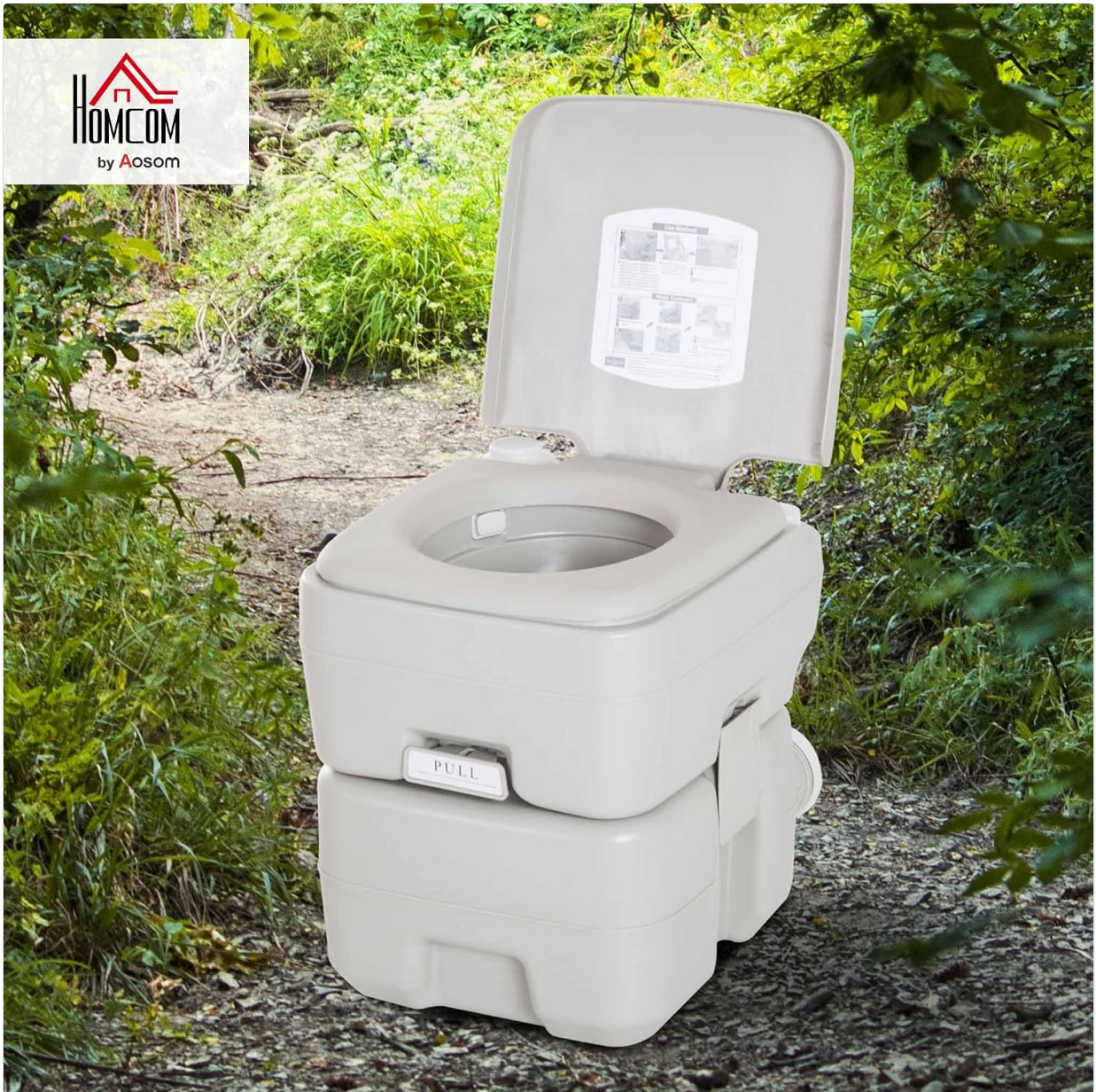
Image: The kleankin portable travel toilet, designed for outdoor use.