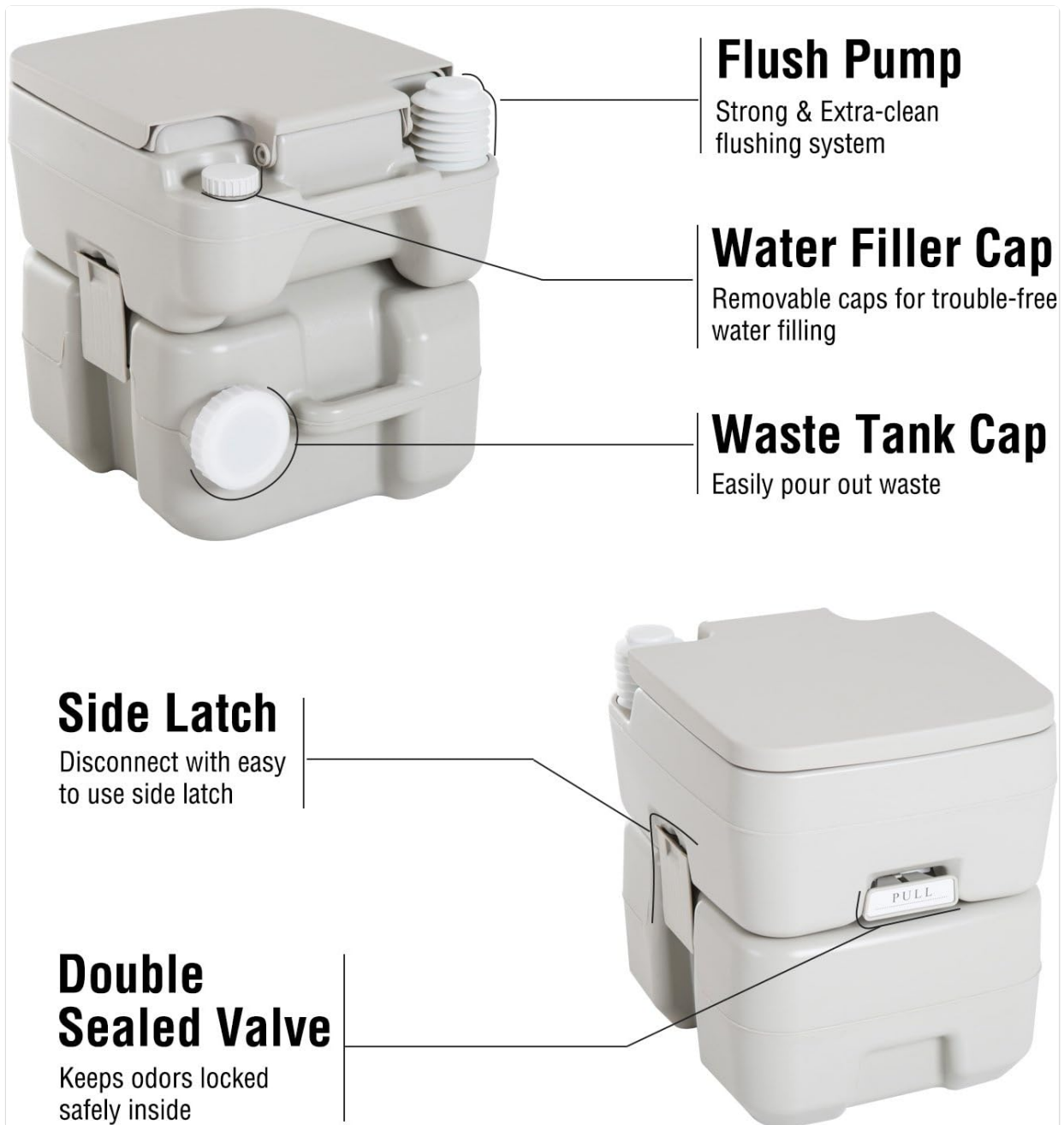
Image: Detailed view of the toilet's components, including the flush pump, water filler cap, waste tank cap, side latch, and double sealed valve.