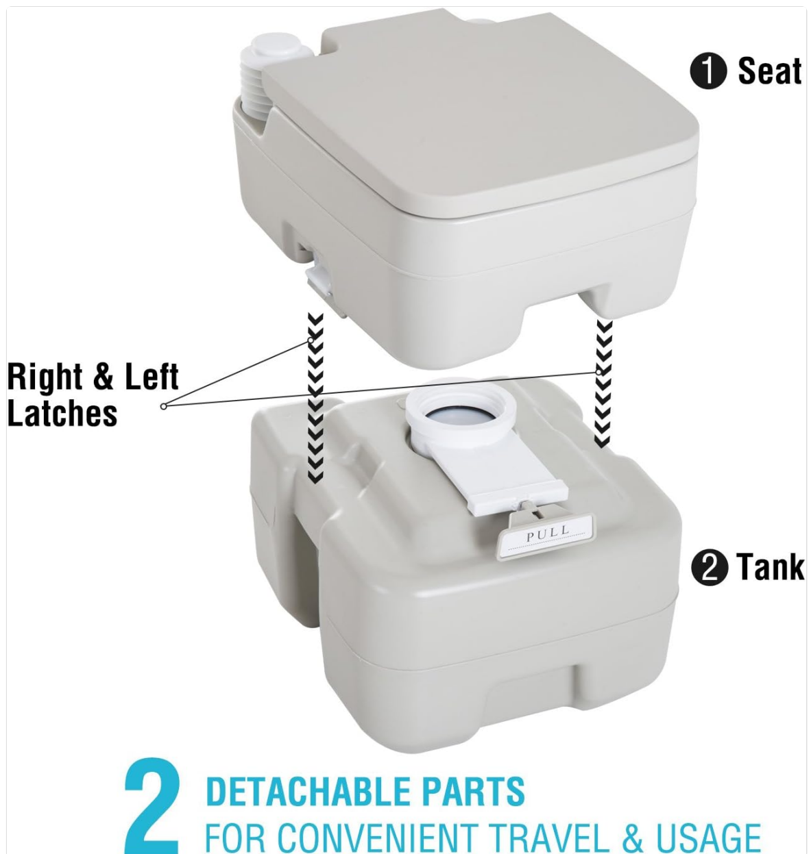
Image: The portable toilet disassembled into its two main parts: the upper seat unit and the lower waste tank, highlighting the connecting latches.