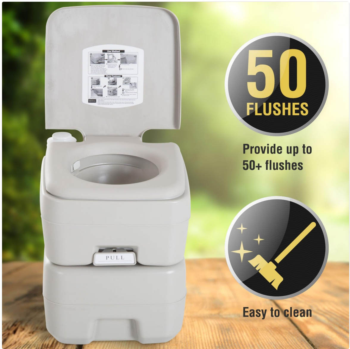
Image: The portable toilet highlighting its capacity for over 50 flushes and ease of cleaning.