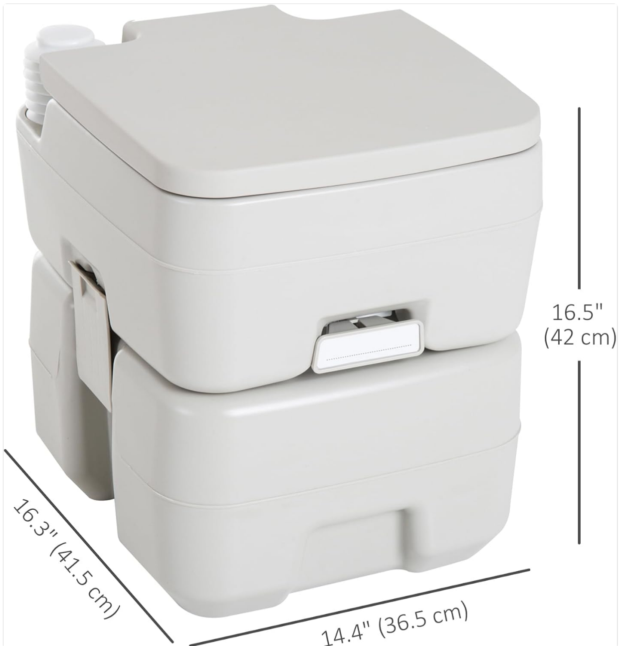
Image: The portable toilet with its length, width, and height dimensions clearly marked.