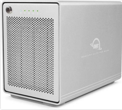
Angled view of the OWC Mercury Elite Pro Quad enclosure.