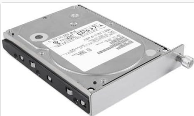
A 3.5-inch hard drive secured to a drive tray.