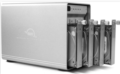
Drive trays being inserted or removed from the enclosure.