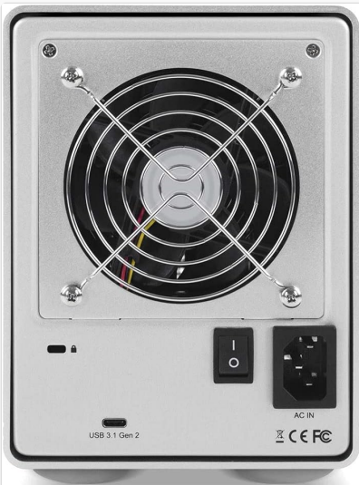
Rear panel with USB-C port, power input, and cooling fan.