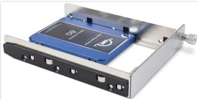
A 2.5-inch SSD secured to a drive tray adapter.